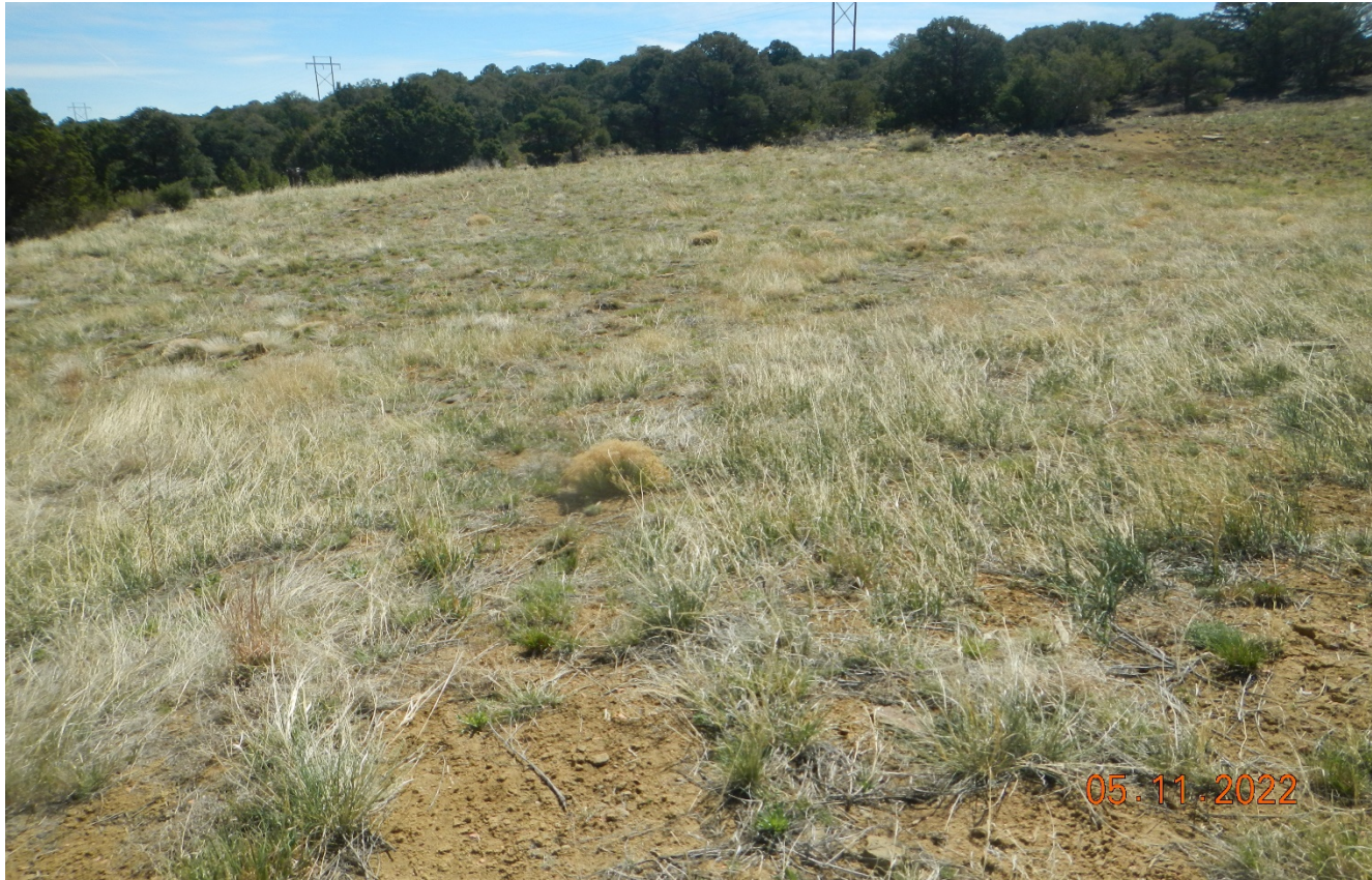
Photo 7. Facing toward the east side of the location. The vegetation is well established at the eastern portion of the location.