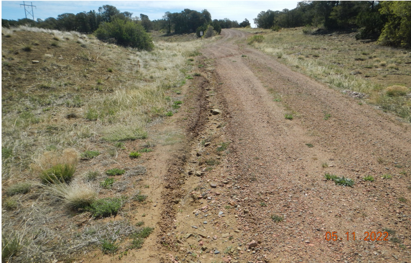
Photo 3. Facing southeast further along the access road. There is erosion occurring along the road that has not been repaired. Previous corrective action not completed.