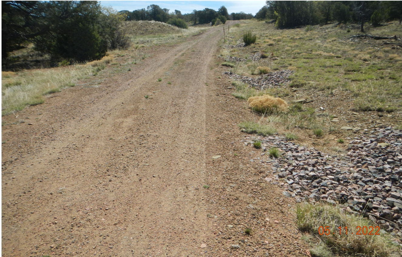
Photo 2. Facing southeast along the access road. The rock check dams along the road side appear to be controlling erosion.