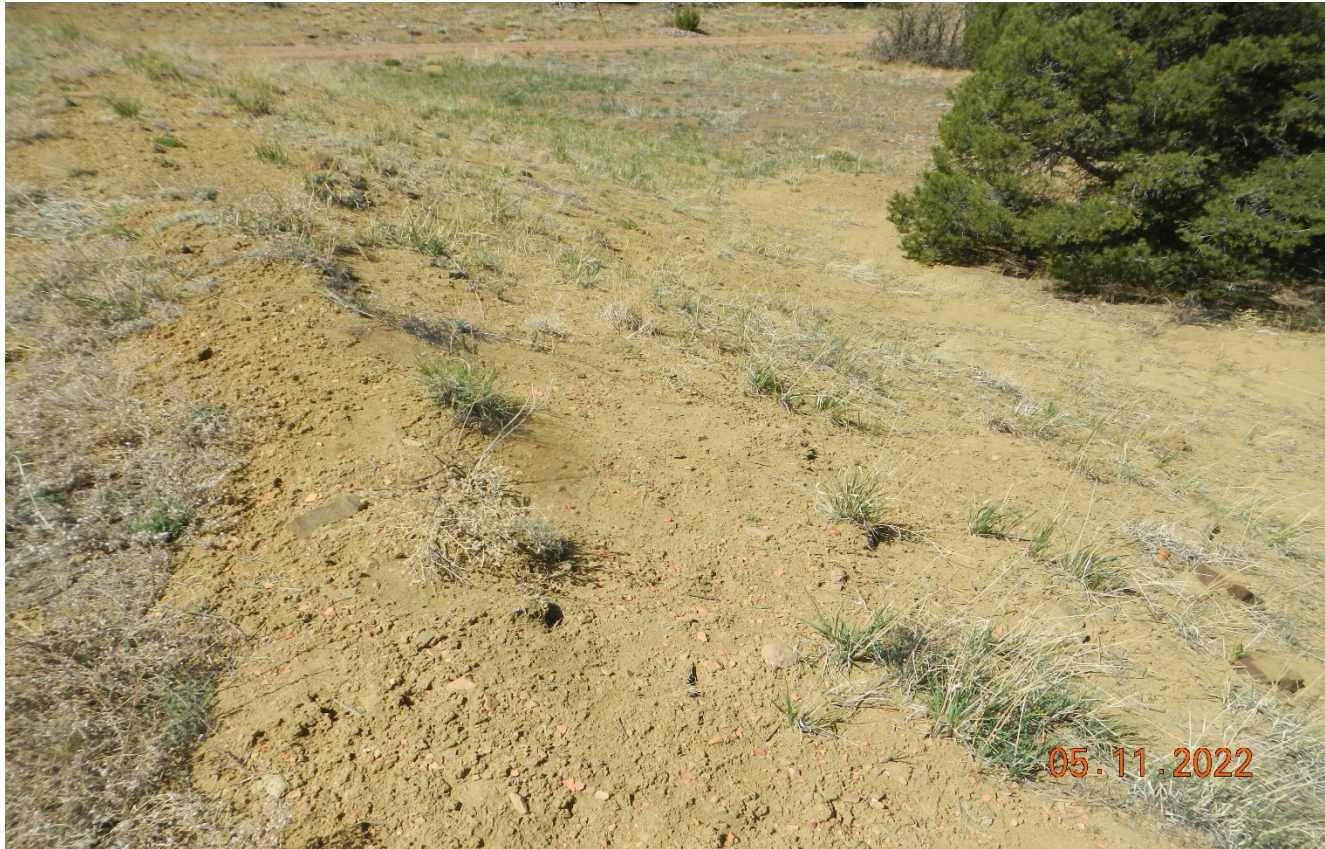
Photo 5. Facing toward the fill slope. There is sparse vegetation along the fill slope and the plastic netting still remains.