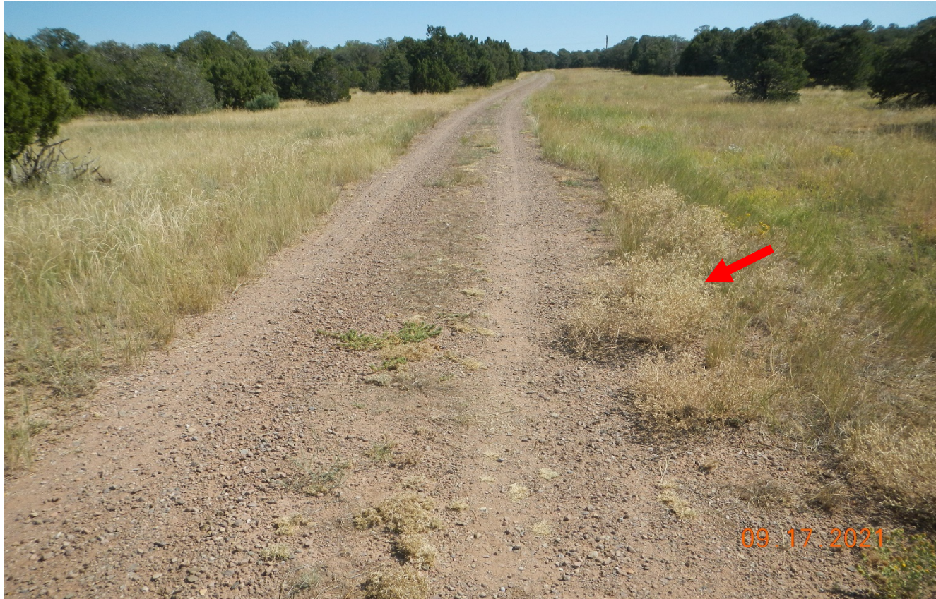
Photo 1. Facing southeast along the access road. There are noxious weeds along the road (Diffuse knapweed).