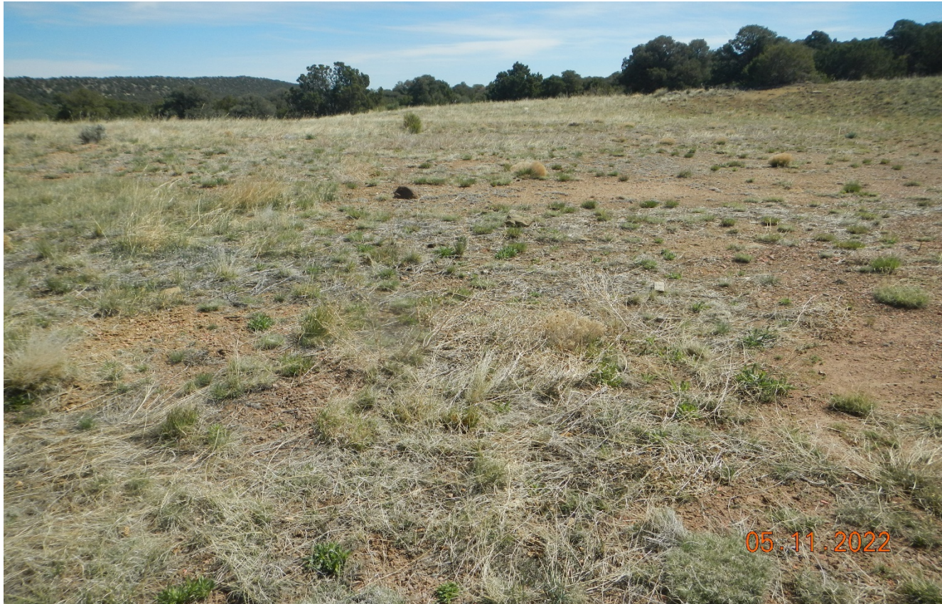
Photo 4. Facing east toward the location.