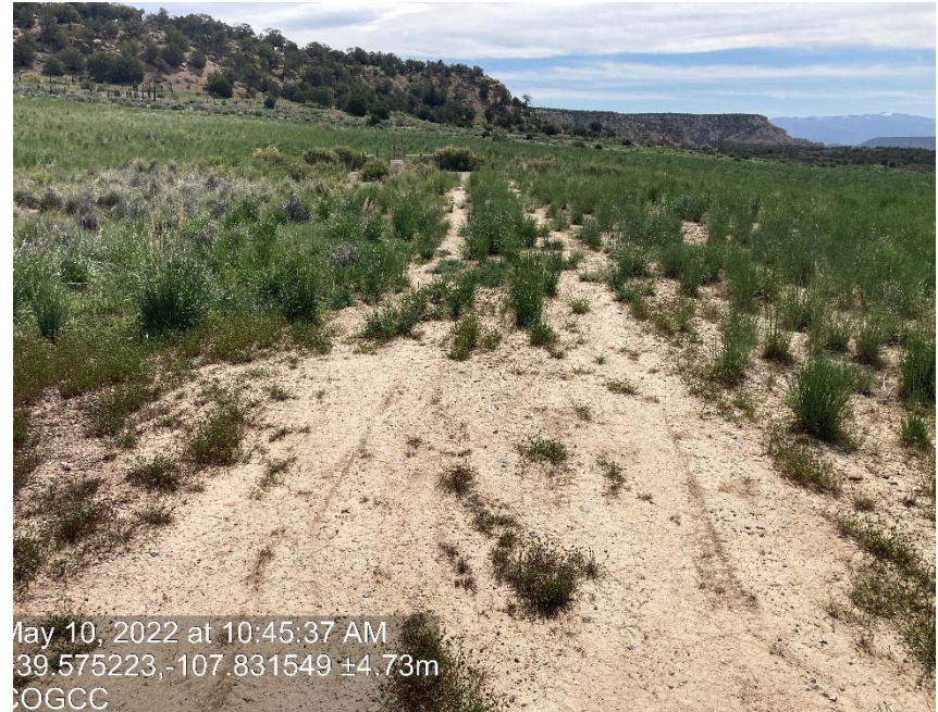
Access to well head