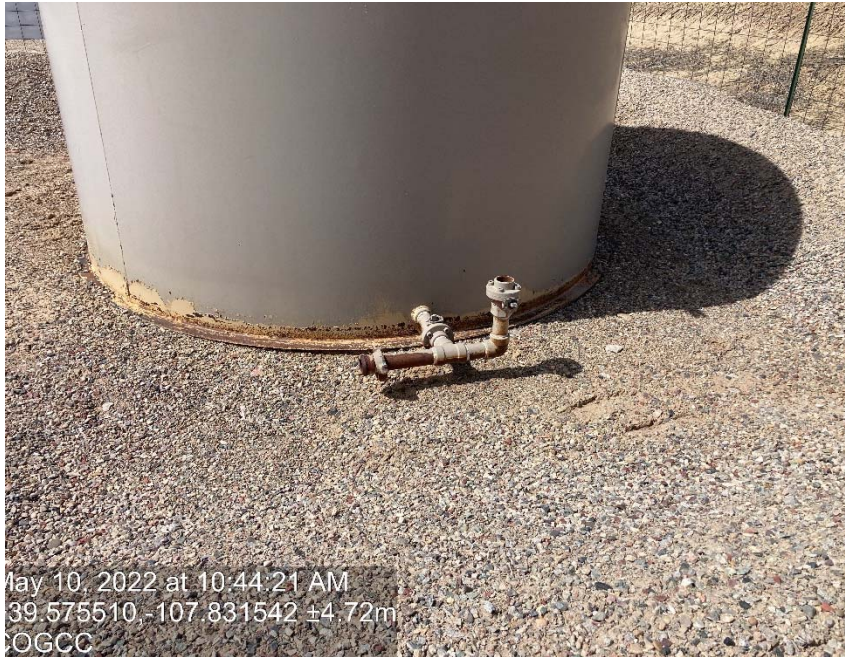
Valves missing caps/plugs