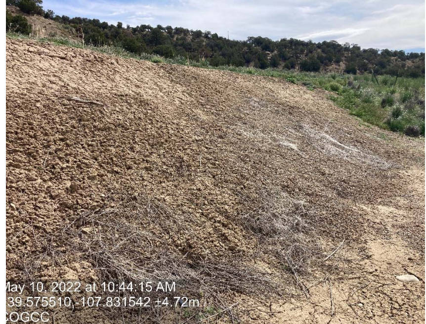
Cut slope lack of stabilization