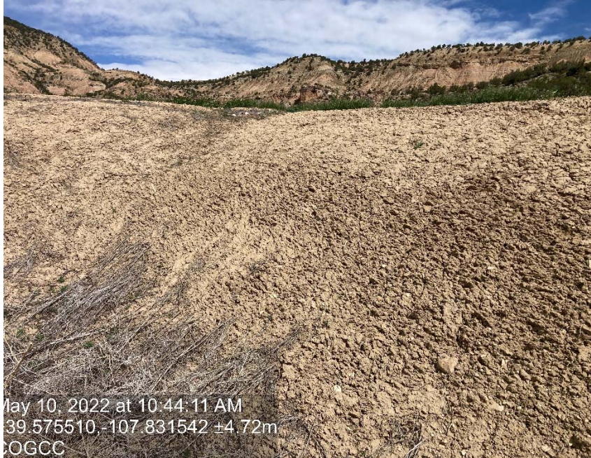
Cut slope lack of stabilization