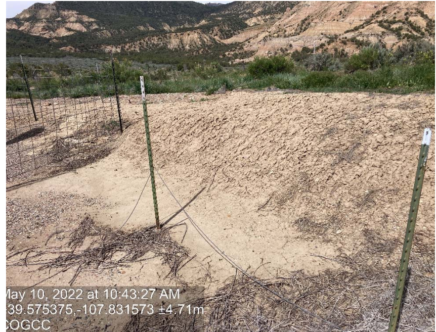
Cut slope lack of stabilization