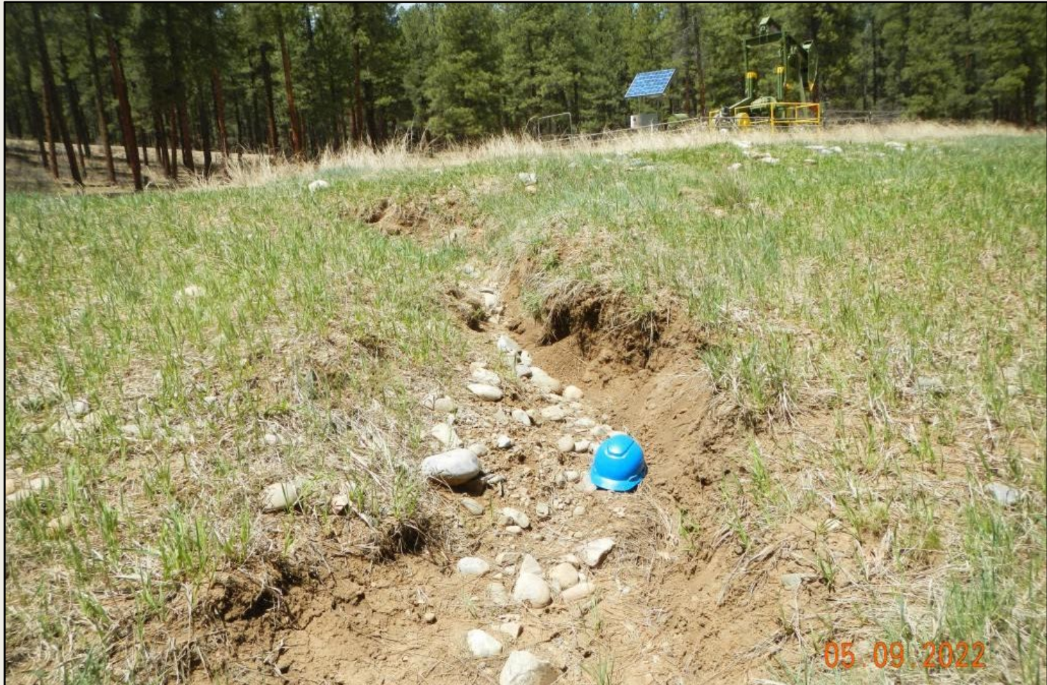
Photo 4. View erosional channeling approximately 2ft wide and deep within the southeastern project area, downslope from diversion in Photo 3.