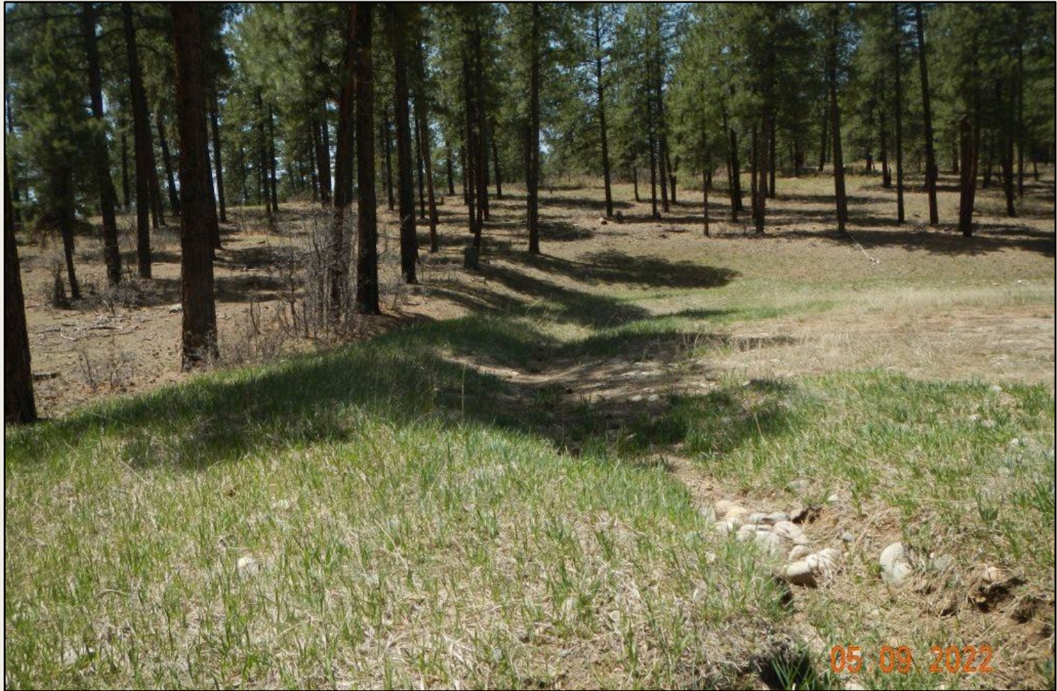
Photo 3. View of the southern project area from the southeastern corner facing westward. Stormwater diversion needs stabilization (Photo 4).