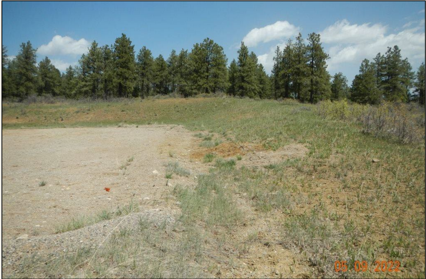
Photo 2. View of the eastern project area from the southeastern corner facing northward. Revegetation is progressing with smooth brome, sand dropseed, crested wheatgrass, and western wheatgrass.