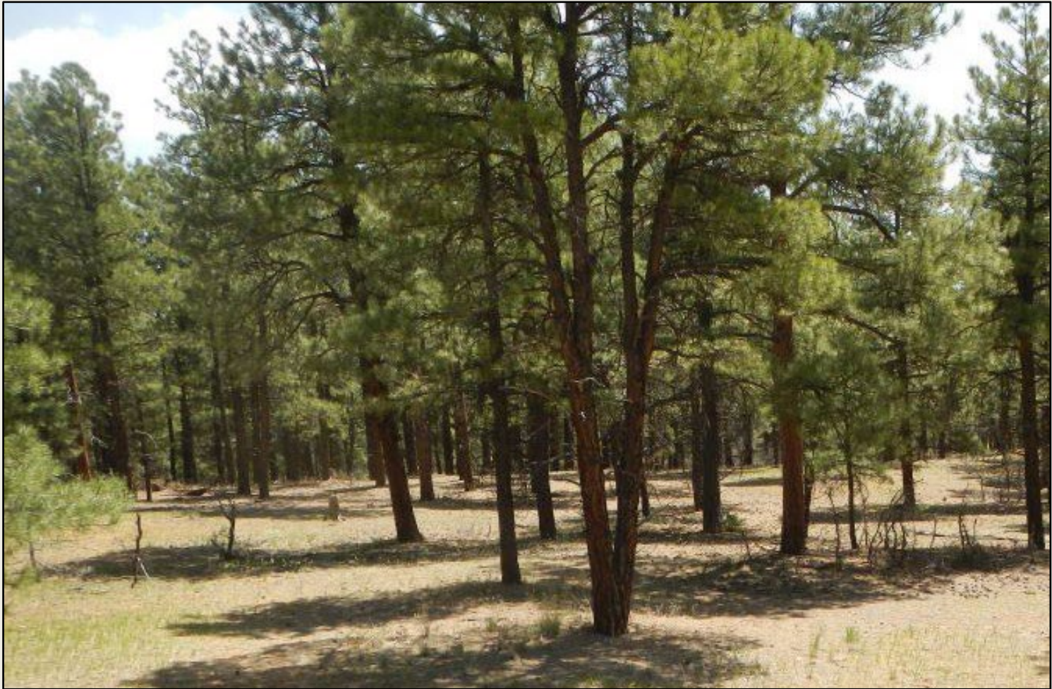
Photo 4. View of reference area comprised of ponderosa pine forest with gambel oak, Oregon grape, balsamroot, and muttongrass.