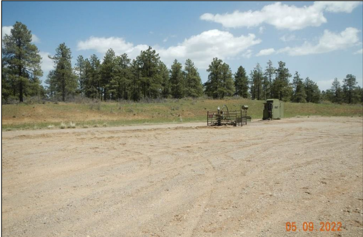
Photo 1. View of the project area from the well pad entrance facing center.