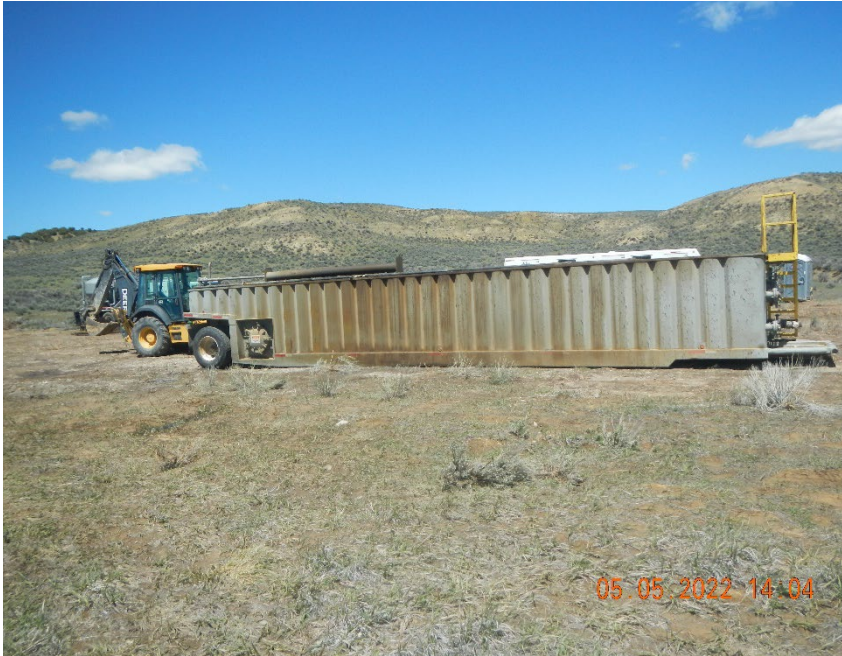
Photo #11 Open top tank. Well head is near front bucket of backhoe.

Inspection Date: 5/5/2022