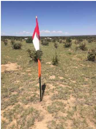
WELL LOCATION LOOKING EAST 7/4/2021