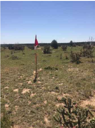
WELL LOCATION LOOKING WEST 7/4/2021