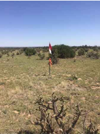
WELL LOCATION LOOKING NORTH 7/4/2021

PAD LOCATION: LAT: N 37.426963 LONG: W 103.465100