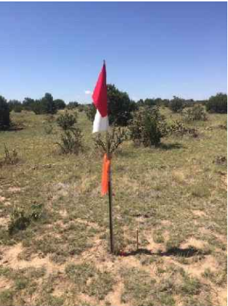
WELL LOCATION LOOKING SOUTH 7/4/2021