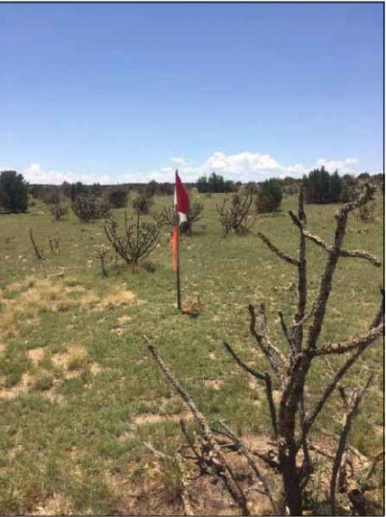
WELL LOCATION LOOKING SOUTH 7/4/2021