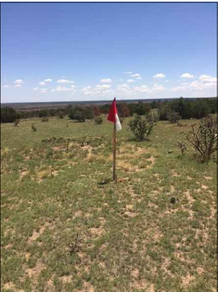
WELL LOCATION LOOKING EAST 7/4/2021