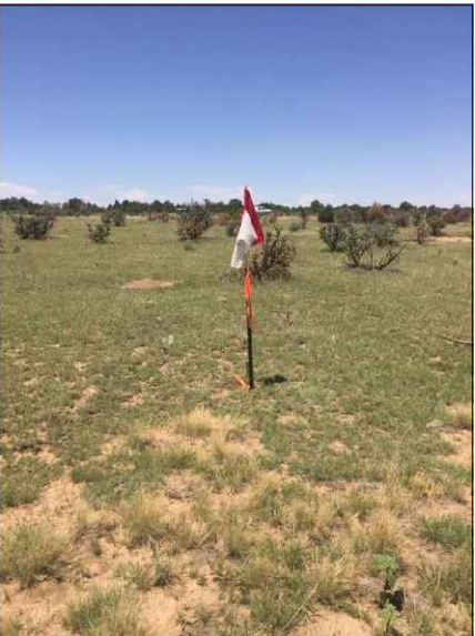
WELL LOCATION LOOKING WEST 7/4/2021