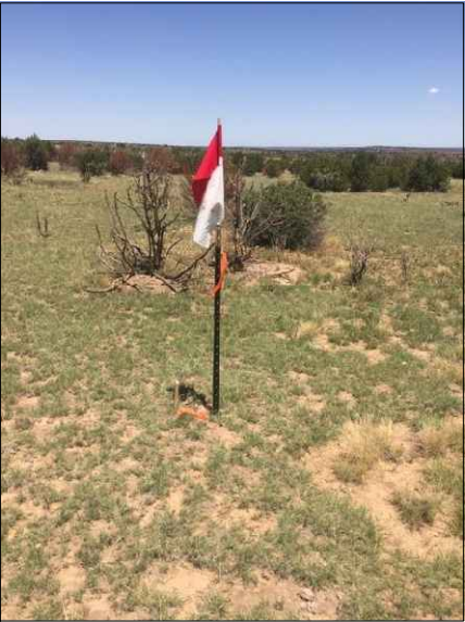
WELL LOCATION LOOKING NORTH 7/4/2021

PAD LOCATION: LAT: N 37.440863 LONG: W 103.465880