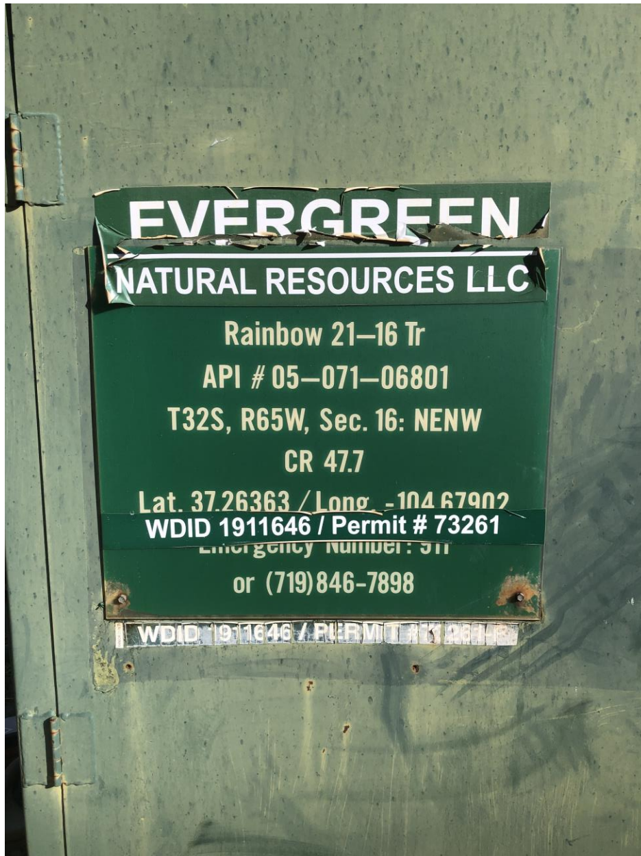
Rainbow 21-16 TR