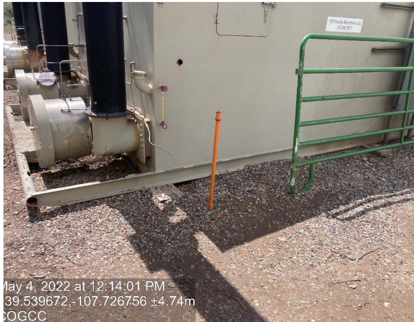
Separators not anchored