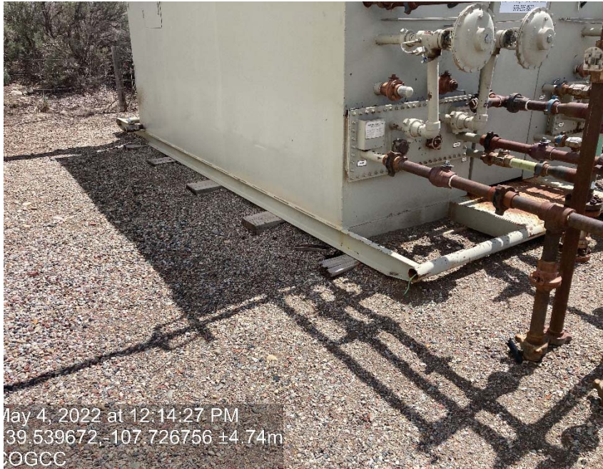
Separators not anchored