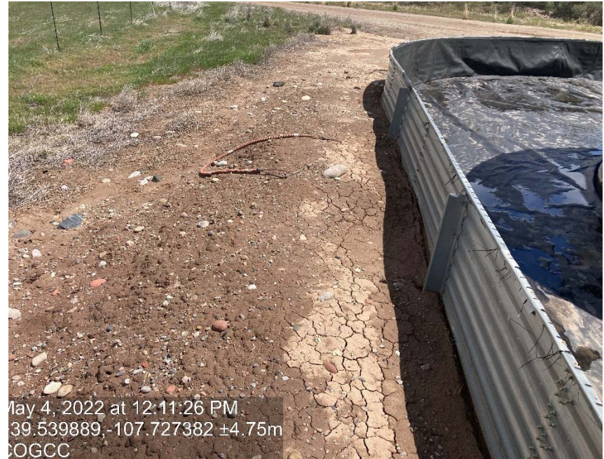
Cables that used to anchor tanks