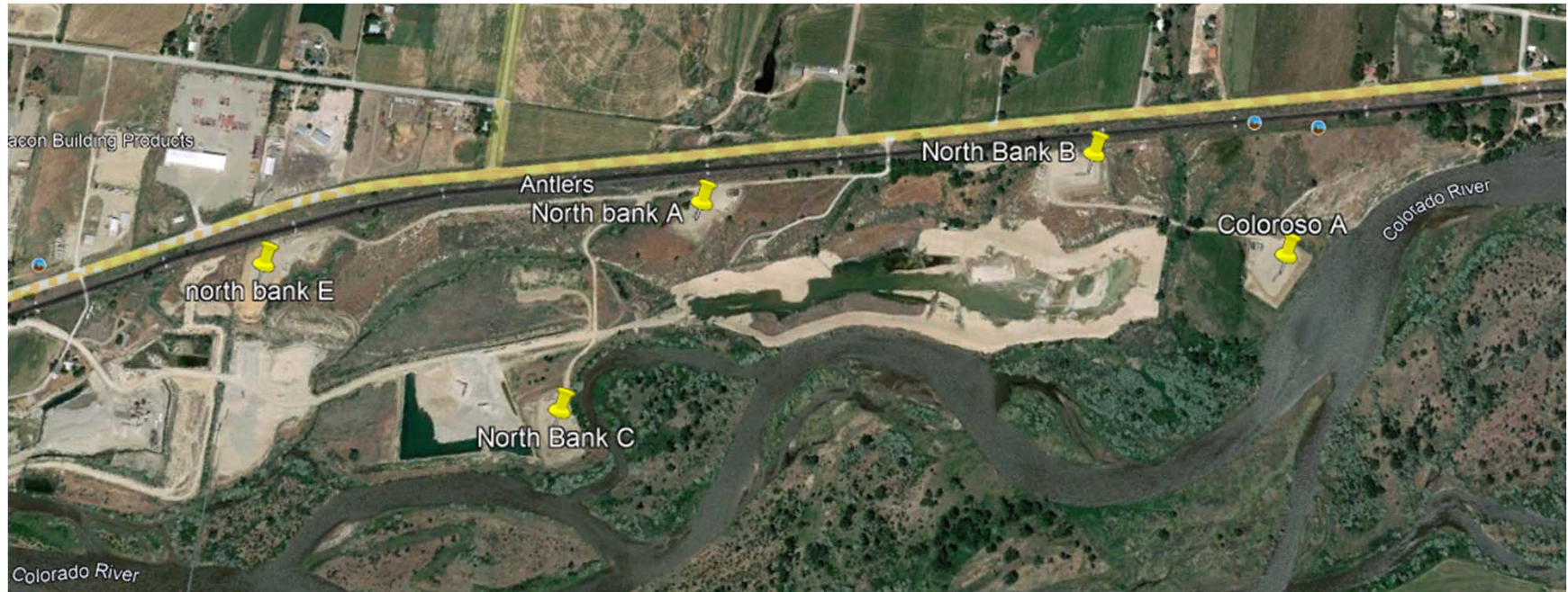
North Bank C proximity to Colorado River