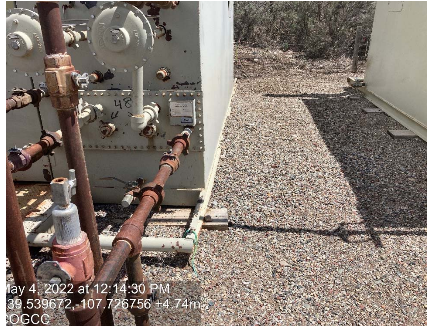
Separators not anchored