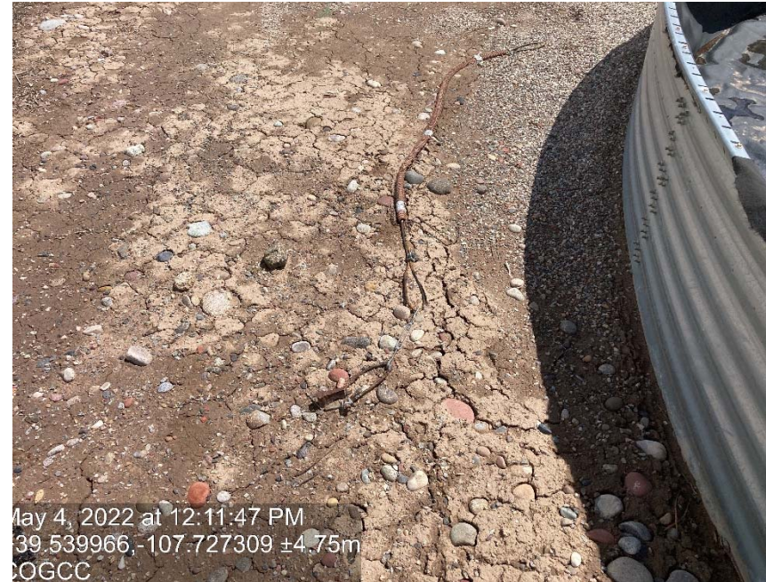
Cables that used to anchor tanks