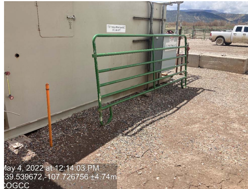
Separators not anchored