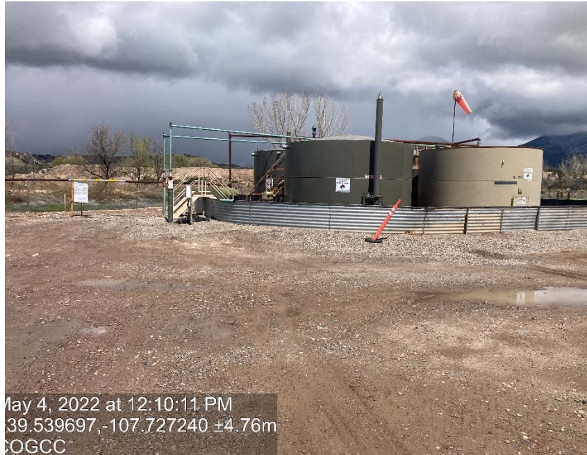
Location/ tanks not anchored