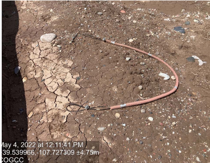
Cables that used to anchor tanks