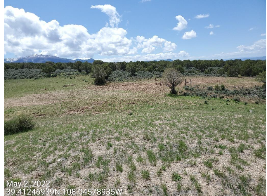
Photo 7: Photos taken from the western interim areas of the Location, facing north. Photos show interim areas that appear to have been recently disturbed.