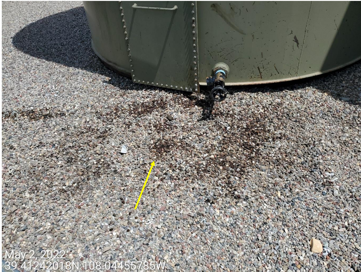
Photo 4: Photo example showing additional stained soils observed at the tank battery.