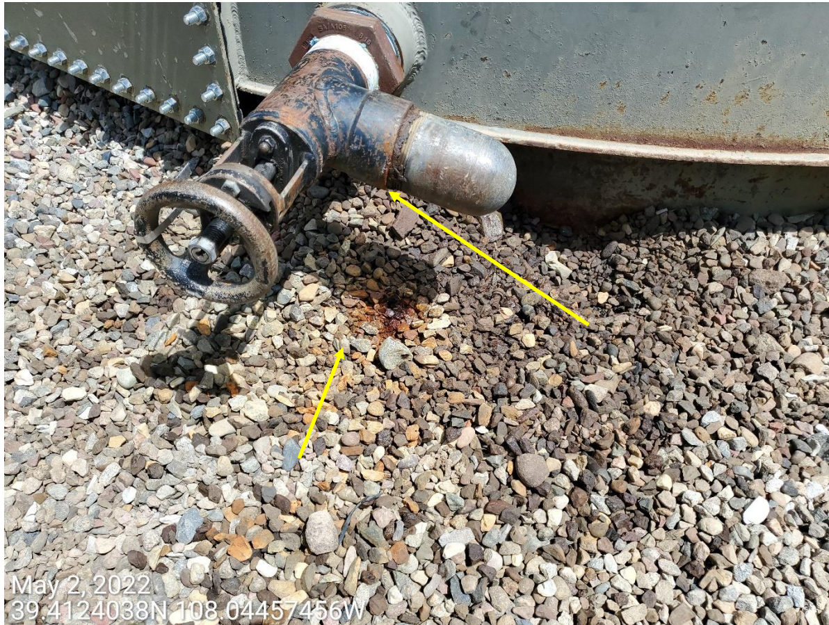
Photo 3: Photo taken from the west side, of the southwestern produced water tank; leak observed at the bull plug. Photo also shows stained soils observed within the tank battery.