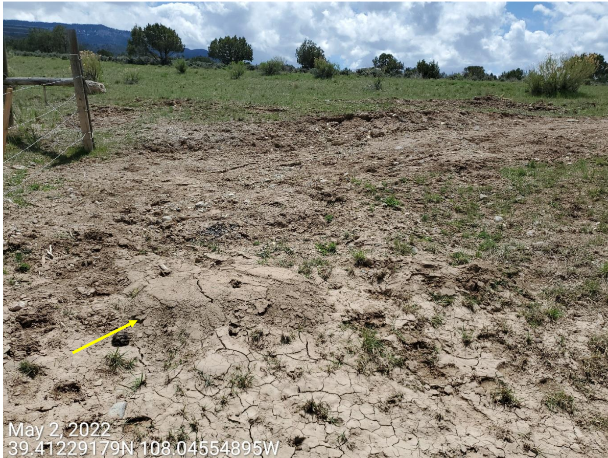
Photo 9: Photo taken from the interim areas on the west end of the Location. Photo shows control measures to minimize erosion are missing or insufficient; erosion degradation observed. Arrow showing sediment deposition due to erosion degradation on the interim areas.