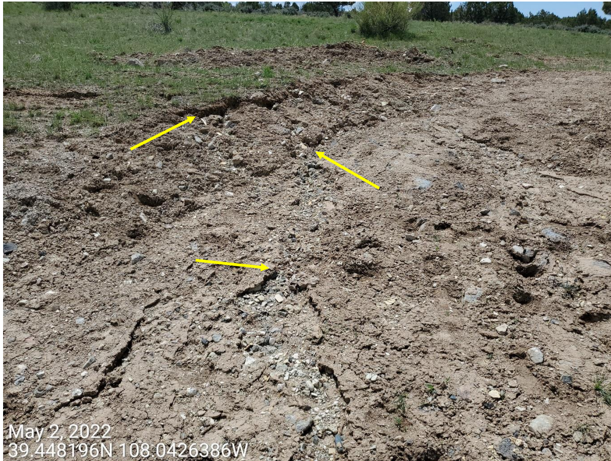
Photo 8: Photo taken from the interim areas on the west end of the Location. Photo shows control measures to minimize erosion are missing or insufficient; erosion degradation observed.