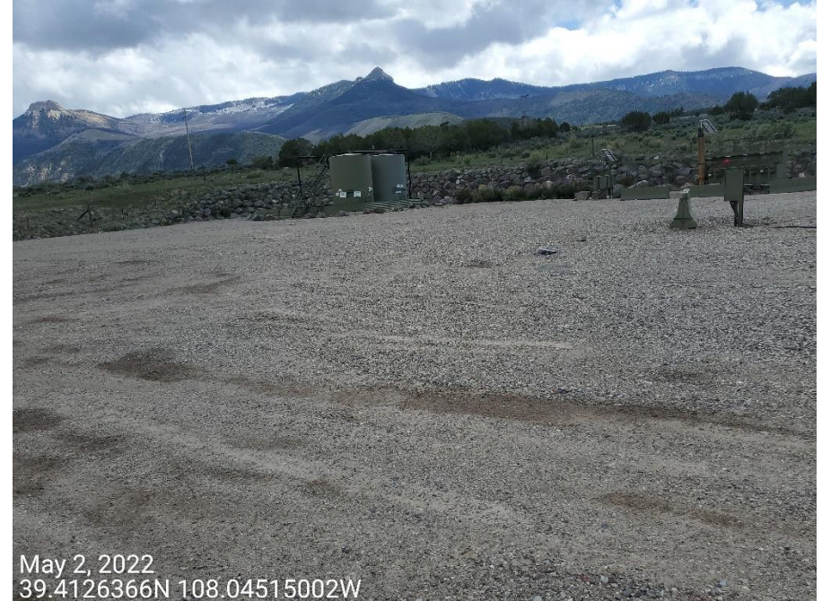
Photo 1: Photos taken from the north end of the Location. Photos 1-2 provide an overview of the Location from east, southeast, southwest to west.