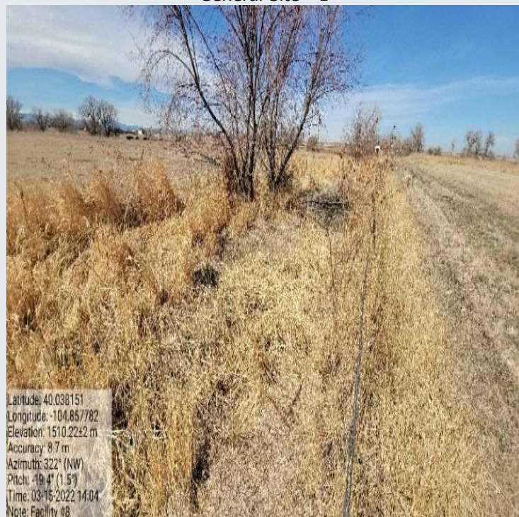
General Site - 1