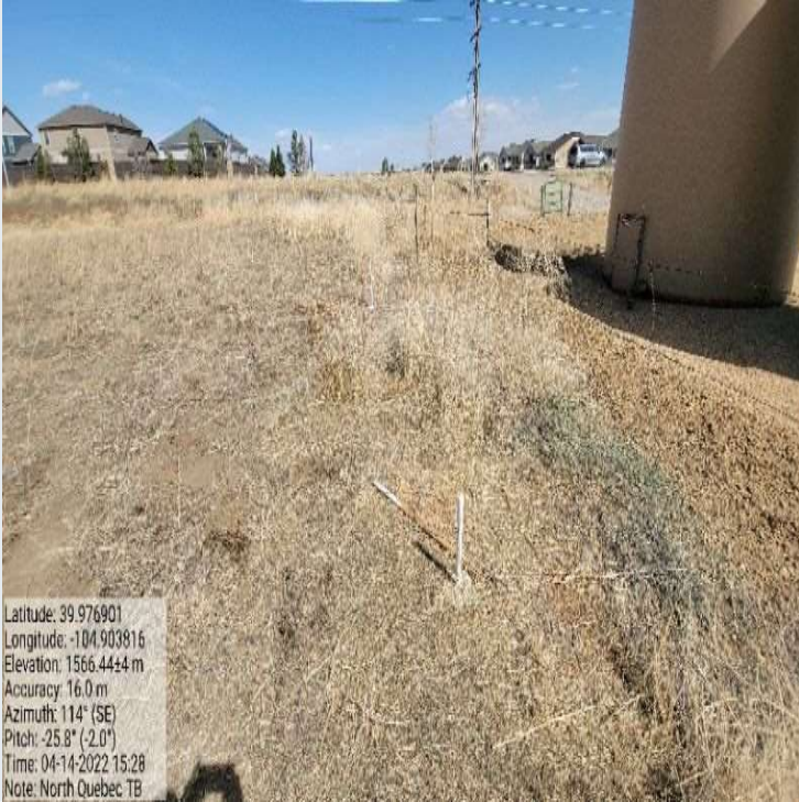
General Site - 1 Two more monitoring wells