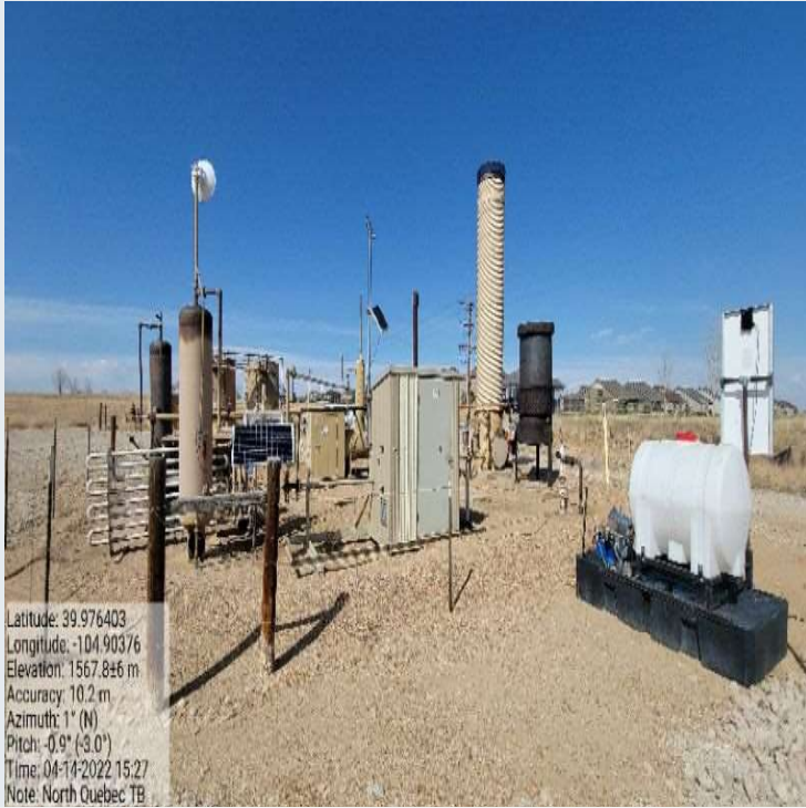
General Site - 5