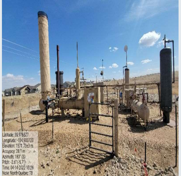
General Site - 2