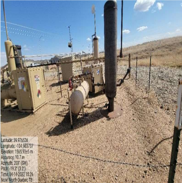
General Site - 3