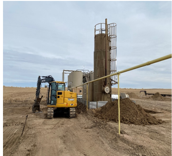
Photograph 6: Excavating impact west of heater treater, view north