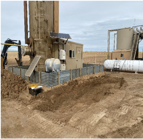
Photograph 5: Excavated area of impact east of heater treater, release point at gasket behind small tank, view northwest