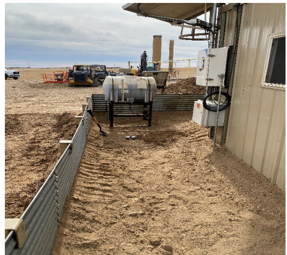
Photograph 12: Backfilled area of impact removed within east side of heater treater secondary containment, release point at gasket behind panels, view south