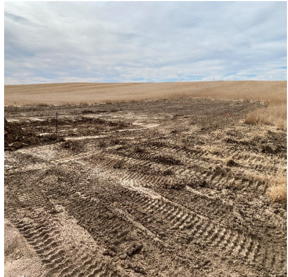
Photograph 18: Excavated area of impact in adjacent field to west, view southwest