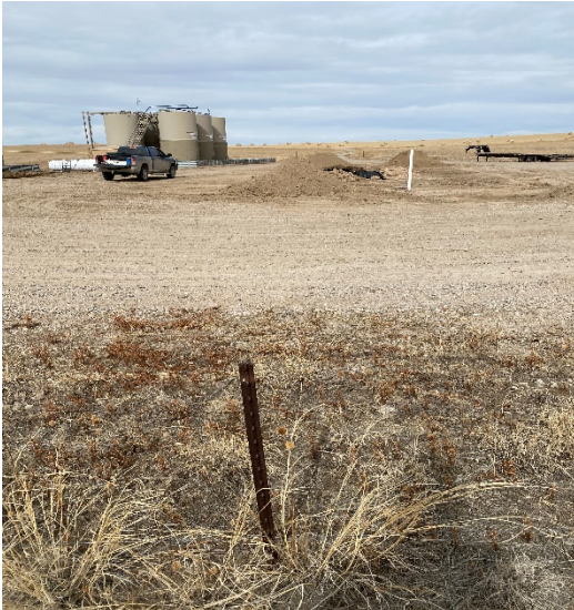
Photograph 17: Background sample location south central pad, impacted soil stockpile to north, view north