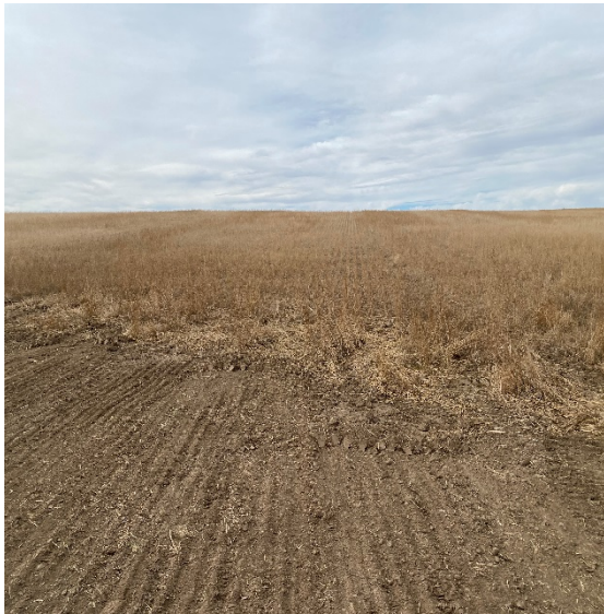
Photograph 15: Background sample location in adjacent property to west, view west