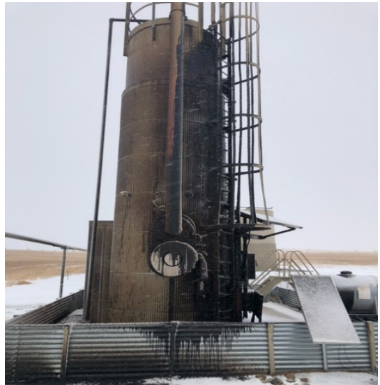
Photograph 4: Heater Treater release point, day of discovery, view north