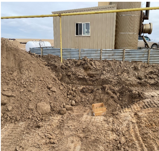
Photograph 11: Excavated area west of heater treater, view east