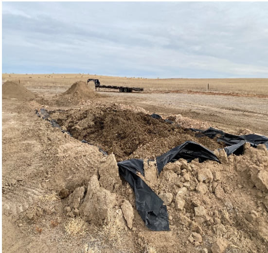
Photograph 19: Temporary stockpile of excavated impacted soil, central pad, view northeast