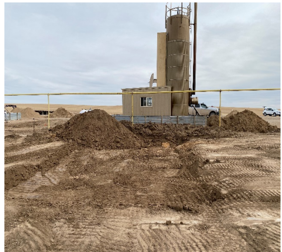
Photograph 10: Excavated areas of impact west of heater treater, view east