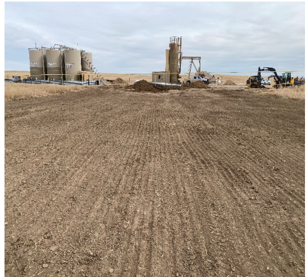
Photograph 16: Excavated area of impact on adjacent property to west, view east