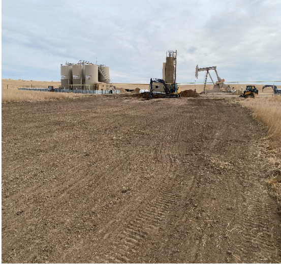
Photograph 13: Excavated area of impact on adjacent property to west, view east