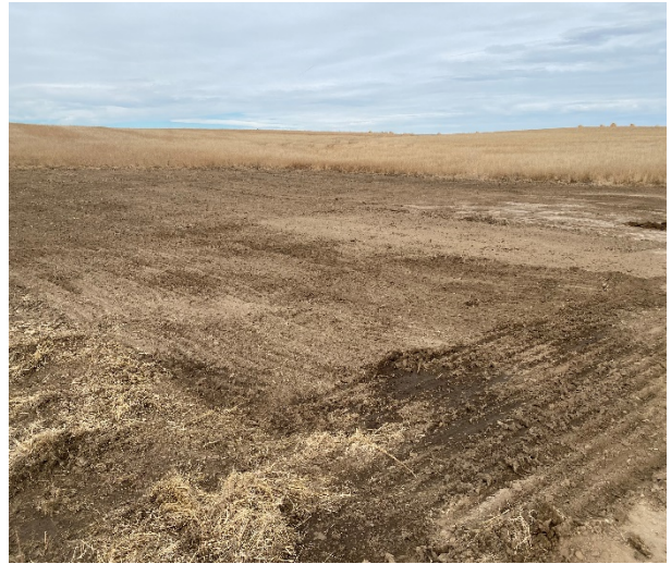
Photograph 14: Excavated area of impact on adjacent property to west, view southwest