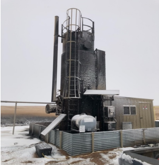
Photograph 1: Heater Treater release point, day of discovery, view northwest