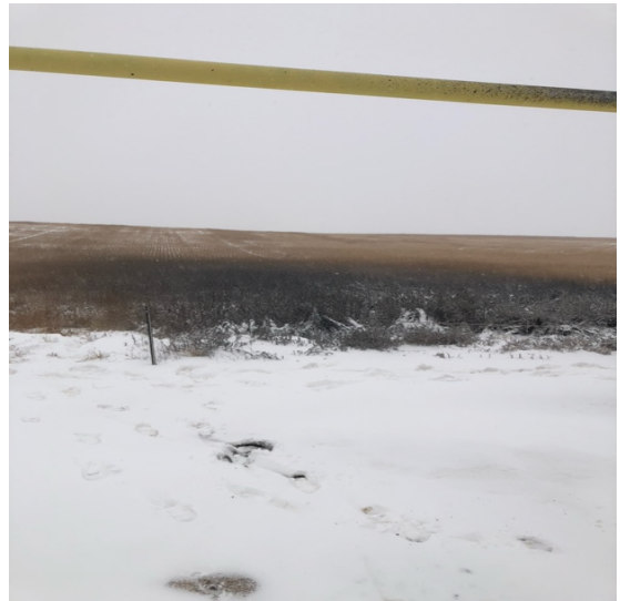
Photograph 2: Impact to adjacent field to west, day of discovery, view west