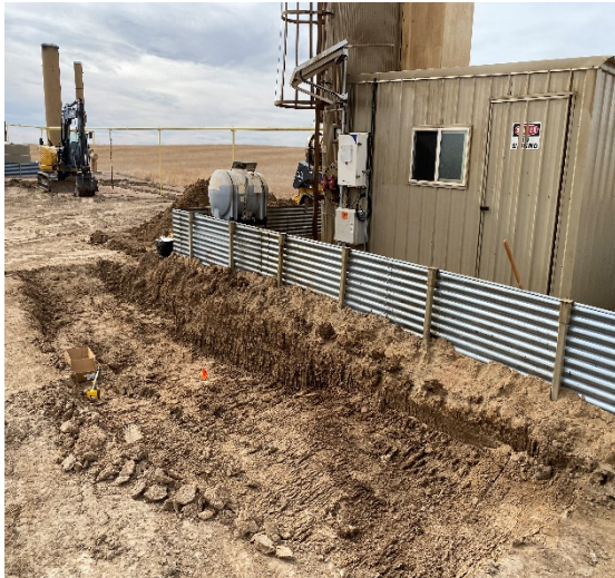
Photograph 7: Excavated area of impact east of heater treater, release point at gasket behind panels, view southwest