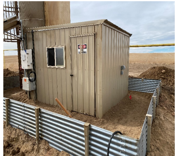
Photograph 8: Heater treater, shed and backfilled area of impact removed within heater treater secondary containment, release point at gasket behind panels, view southwest