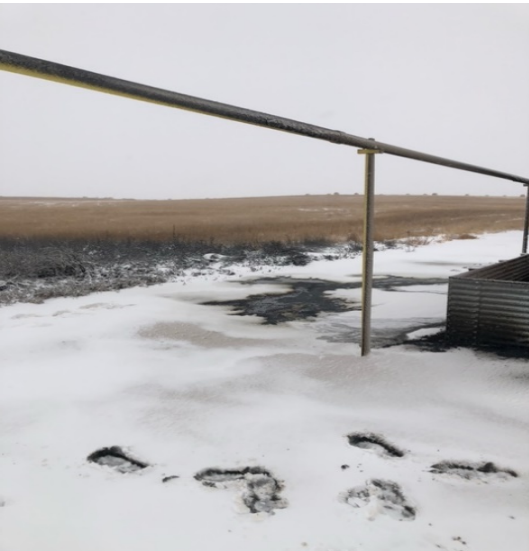
Photograph 3: Impact west and southwest of heater treater and adjacent field to west, day of discovery, view northwest