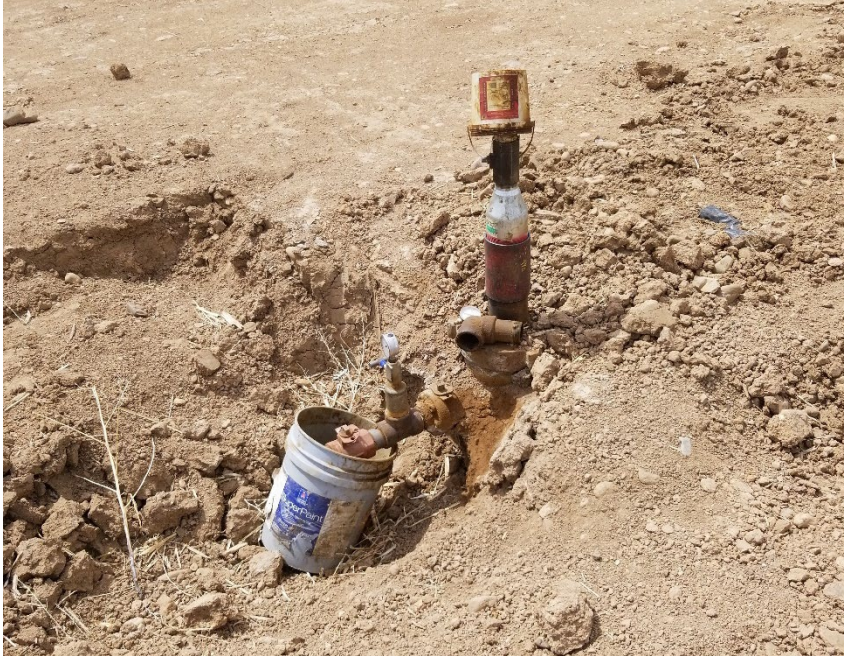
Sack 7-11 wellhead.