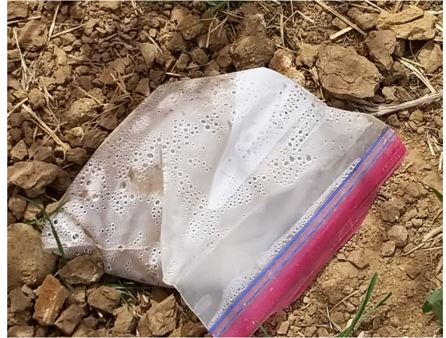
Zip lock back containing what is assumed to be investigation-derived waste.