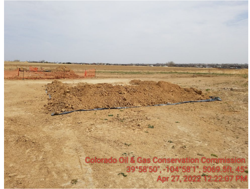
Spoils pile with inadequate stormwater BMPs.