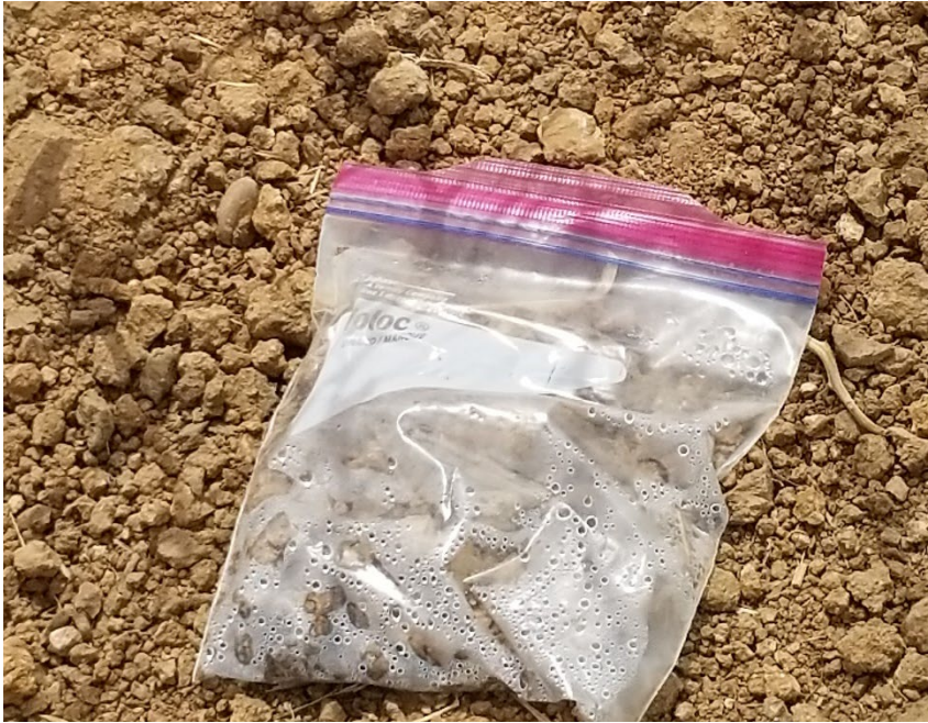
Zip lock back containing what is assumed to be investigation-derived waste.