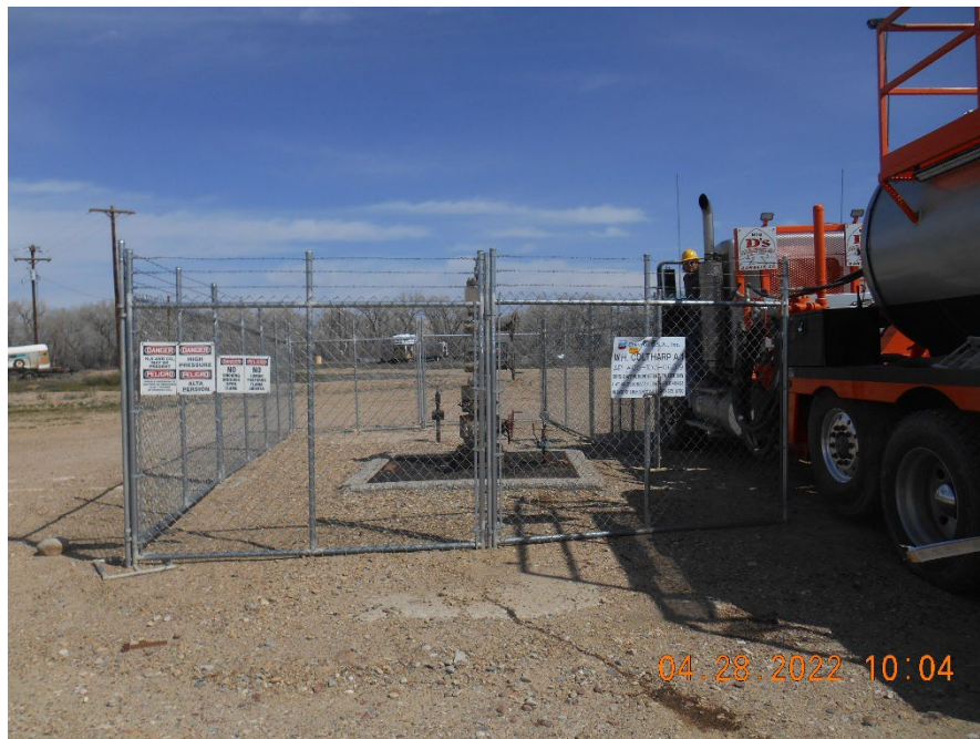
Injection wellhead during MIT