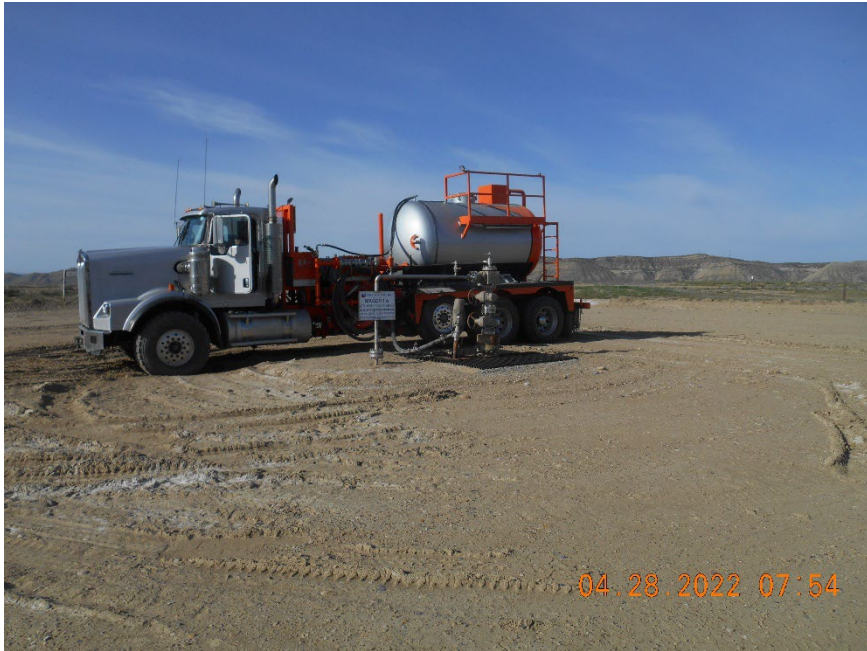
Injection wellhead during MIT