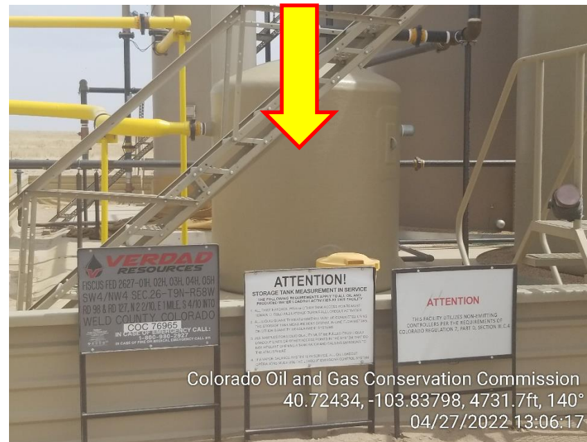
Photo 14 – Tanks Battery Signs Tank missing Labels – NFPA, Content and Capacity