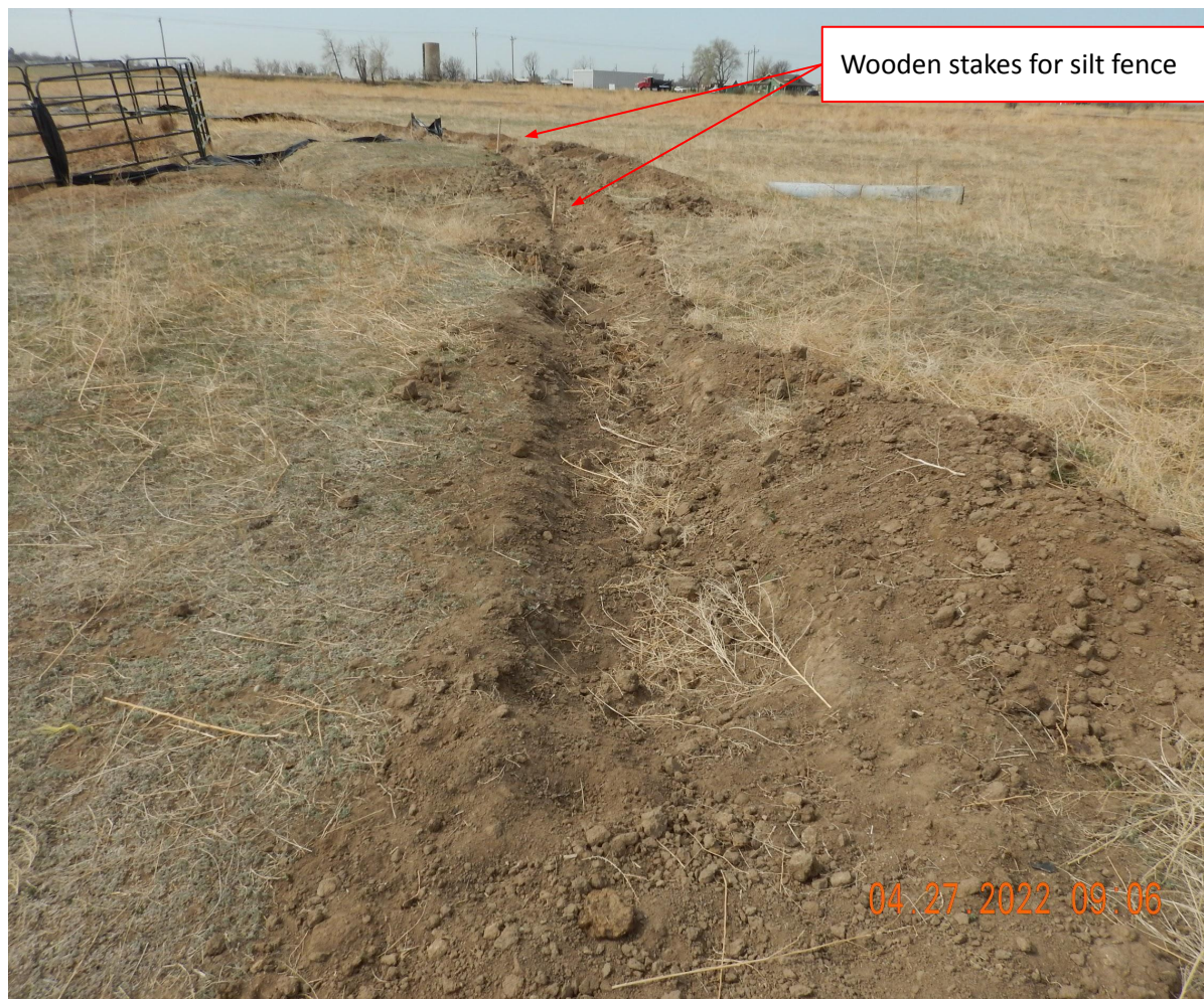
Photo 1. Photo taken north of the excavation, facing South. Photo illustrates Operator has either improperly installed a ditch BMP after the installation of silt fence BMP or has improperly installed the silt fence BMP. If this was intended to be a ditch BMP, Operator has failed stabilize soil material. If this was intended to be a silt fence BMP, Operator has failed to compact and backfill the trenched area. See Photos 2 and 3 regarding additional observations north and west of the excavation area.