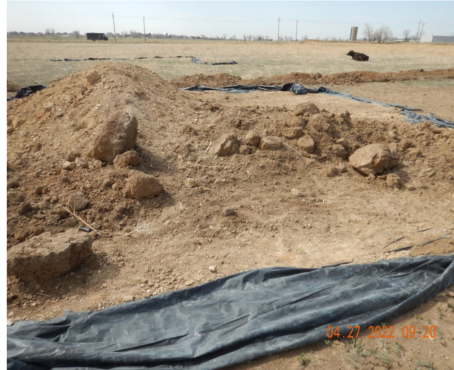
Photo 6. Photo taken southeast of the excavation, facing South. Photo illustrates what appears to be contaminated soil material that has not been excluded from cattle disturbances. Cattle have walked over the contaminated soil and could potentially compromise the liner.