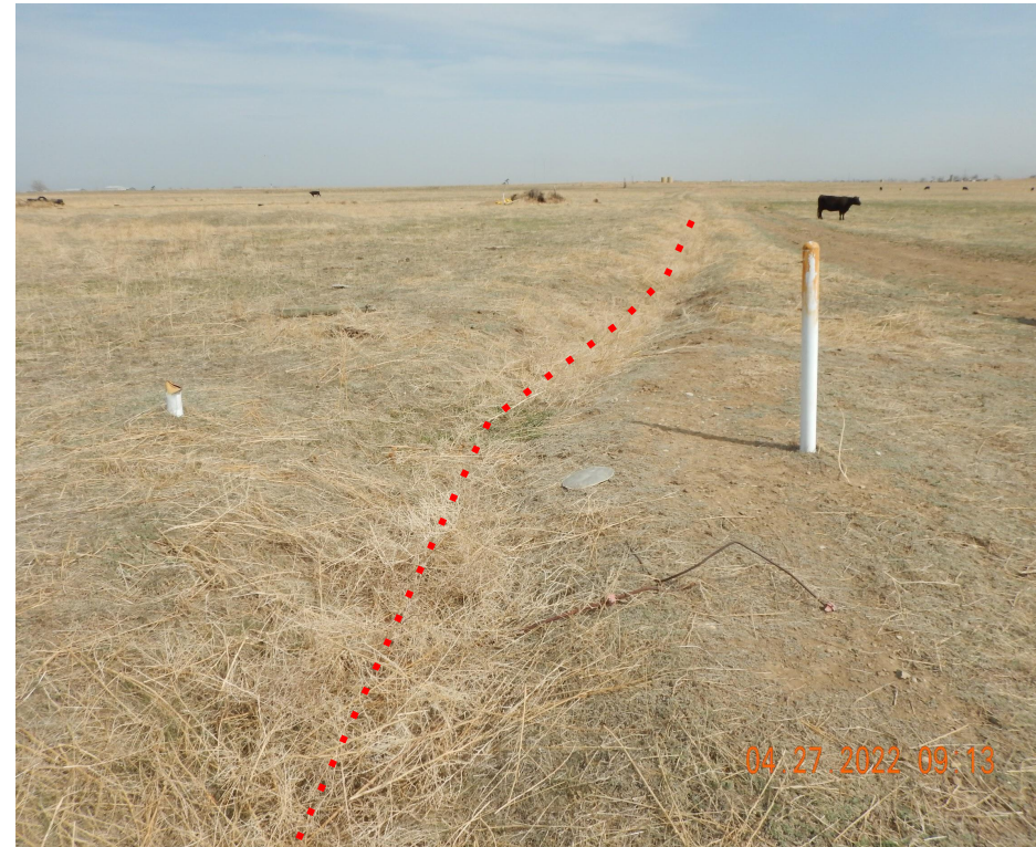
Photo 3. Photo taken north of the excavation, facing North. Photo highlights the existing vegetated ditch mentioned in Photo 2.