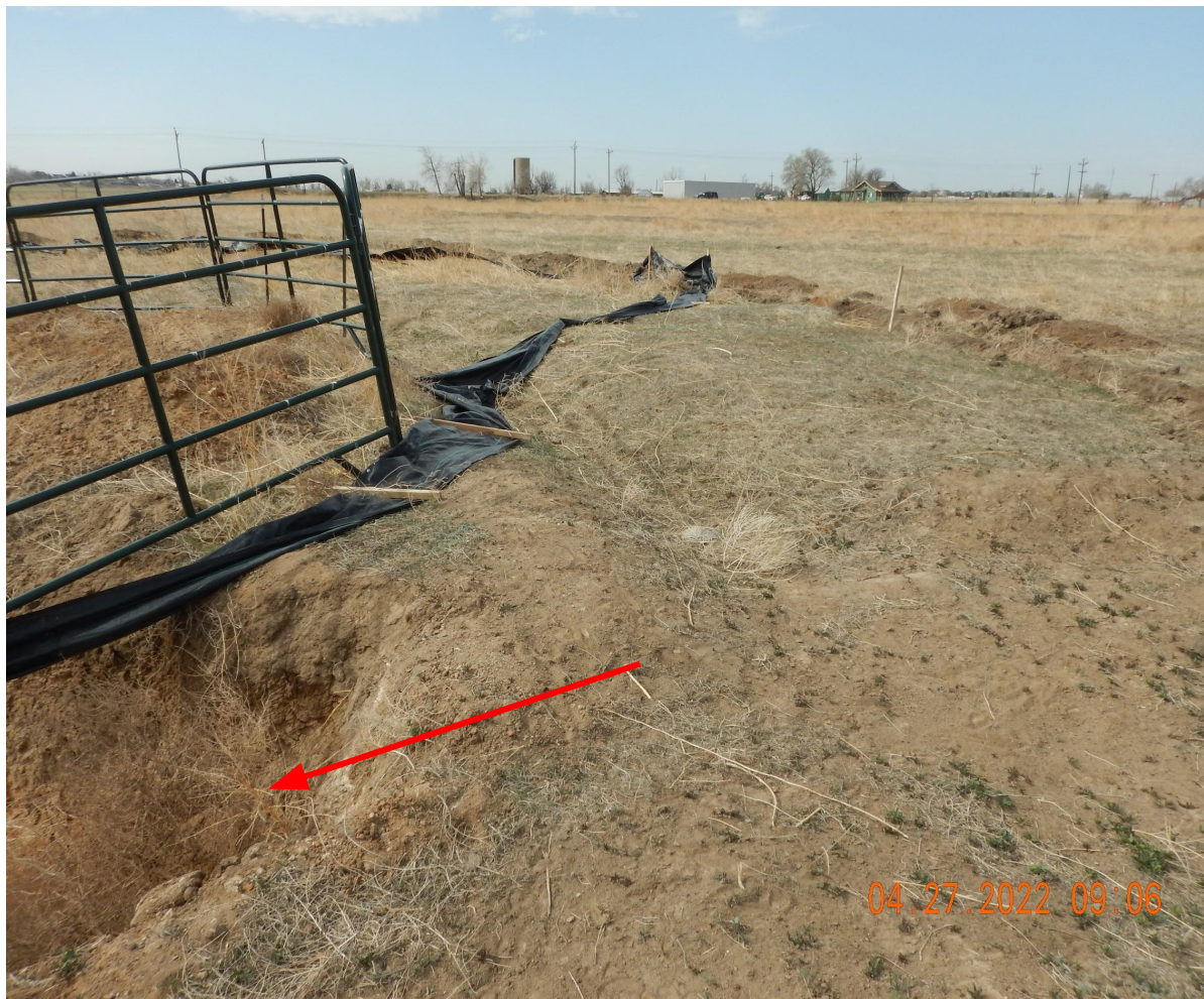
Photo 4. Photo taken from the northwestern excavation area, facing South. Photo illustrates silt fence material that is now considered debris and shall be removed. Also, this photo highlights fencing has not surrounded the excavation area to prevent livestock or wildlife entry.