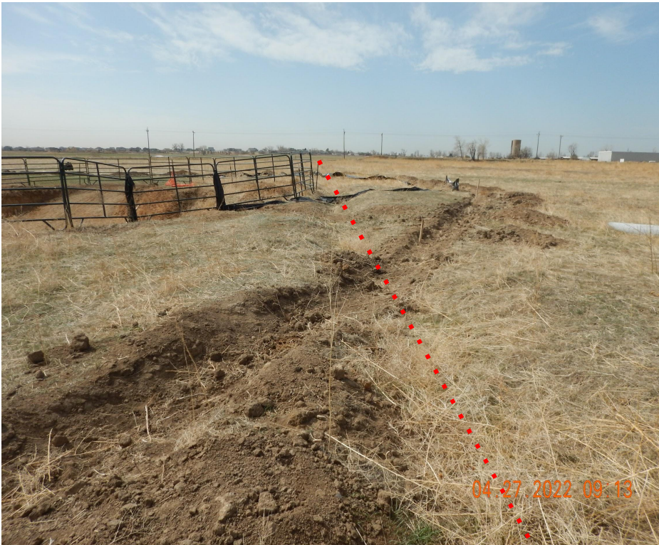
Photo 2. Photo taken north of the excavation, facing South. Photo highlights an existing vegetated ditch that the Operator could have considered as a BMP for run-on mitigation. Instead, the Operator created additional disturbances and failed to minimize disturbances.