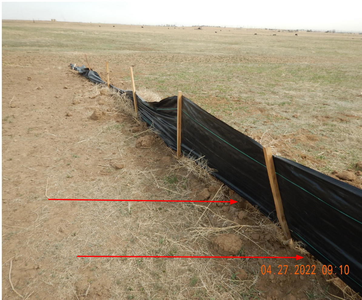
Photo 7. Photo taken east of the excavation, facing North. Photo illustrates Operator has improperly installed the silt fence BMP. The silt fence in this area would be acting to control runoff from the site; therefore, the Operator has installed the wooden stakes on the wrong side of the silt fence. Also, the silt fence has not been properly trenched, as there is daylight evident. The BMP is not in proper functioning condition.