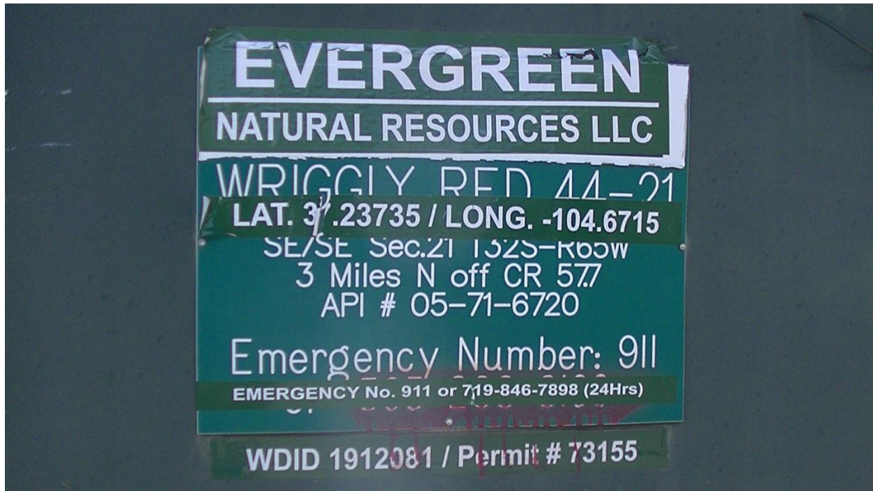
Wriggly Red 44-21