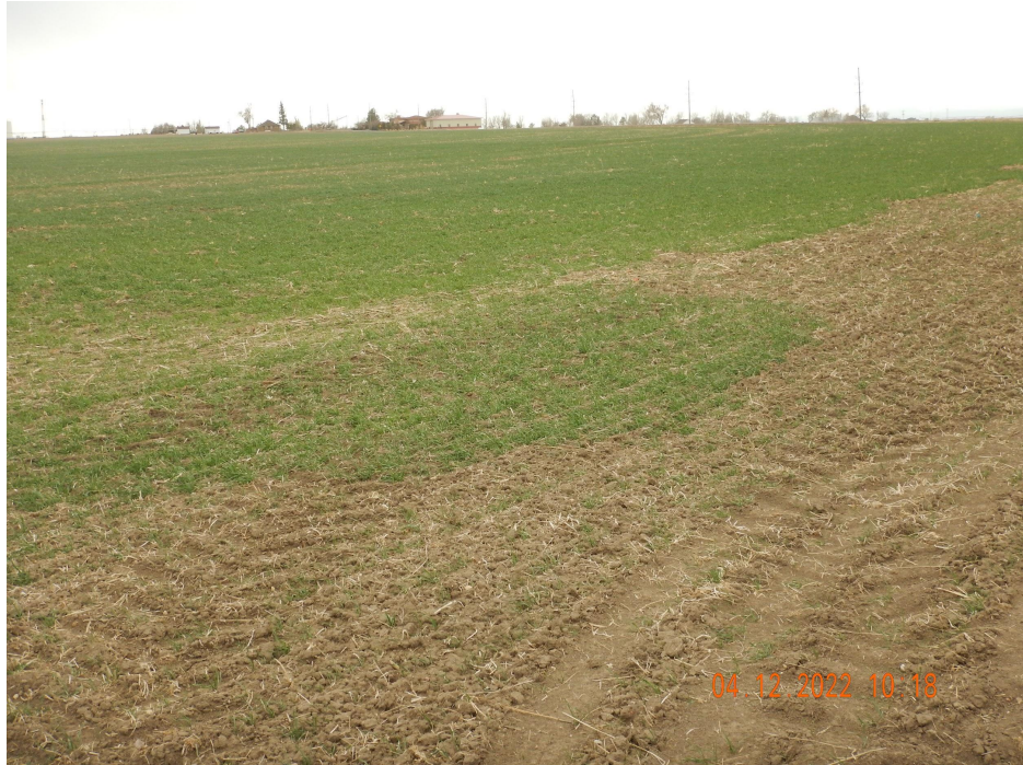
Photo 3. Photo taken from the northern access road, facing Southwest. See comments under Photo 1.