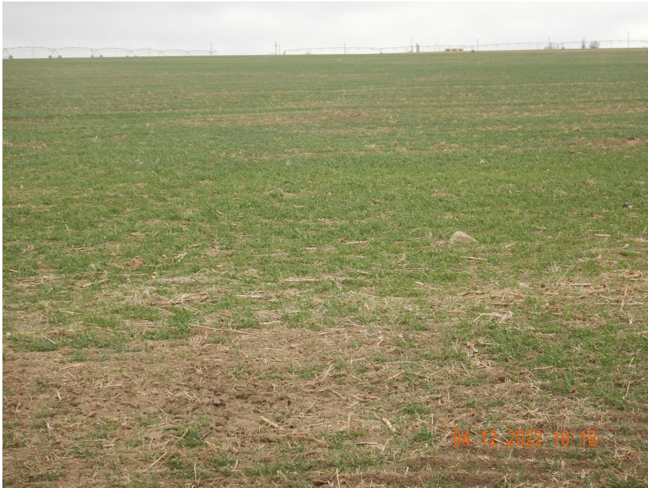
Photo 1. Photo taken from the northern access road, facing South. Photo illustrates the crop growth has uniform establishment which is reflective of reference areas.