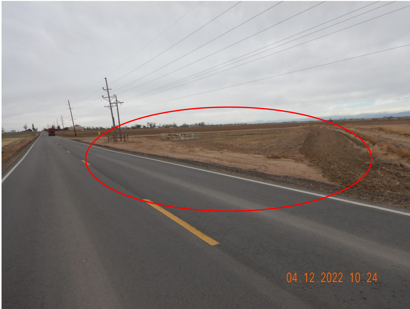
Photo 4. Photo taken from the associated offsite tank battery, facing South. Photo illustrates all equipment has been removed. Post plugging operations, midstream operations installed equipment which is not related to this location.