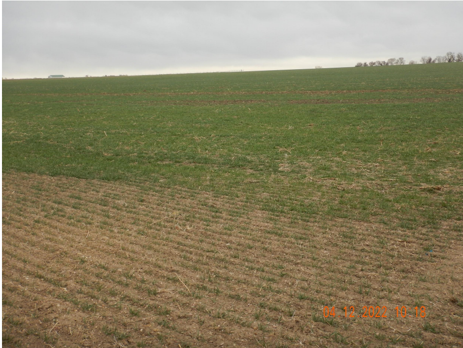
Photo 2. Photo taken from the northern access road, facing Southeast. See comments under Photo 1.