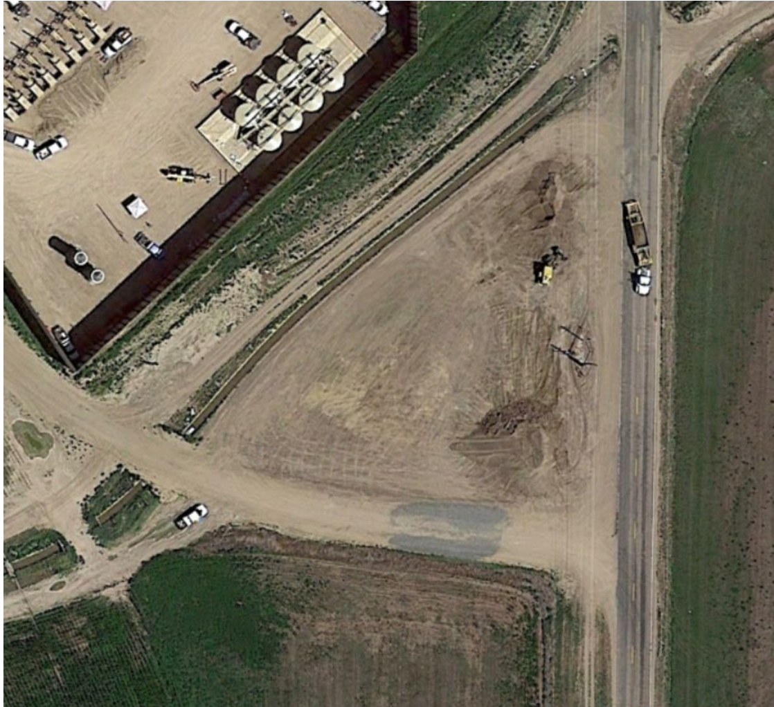
Photo 6. Google Earth aerial imagery taken 7/17/2019 after plugging operations. Photo illustrates the former tank battery area is being disturbed, likely from midstream operations related to the new oil and gas location to the north.