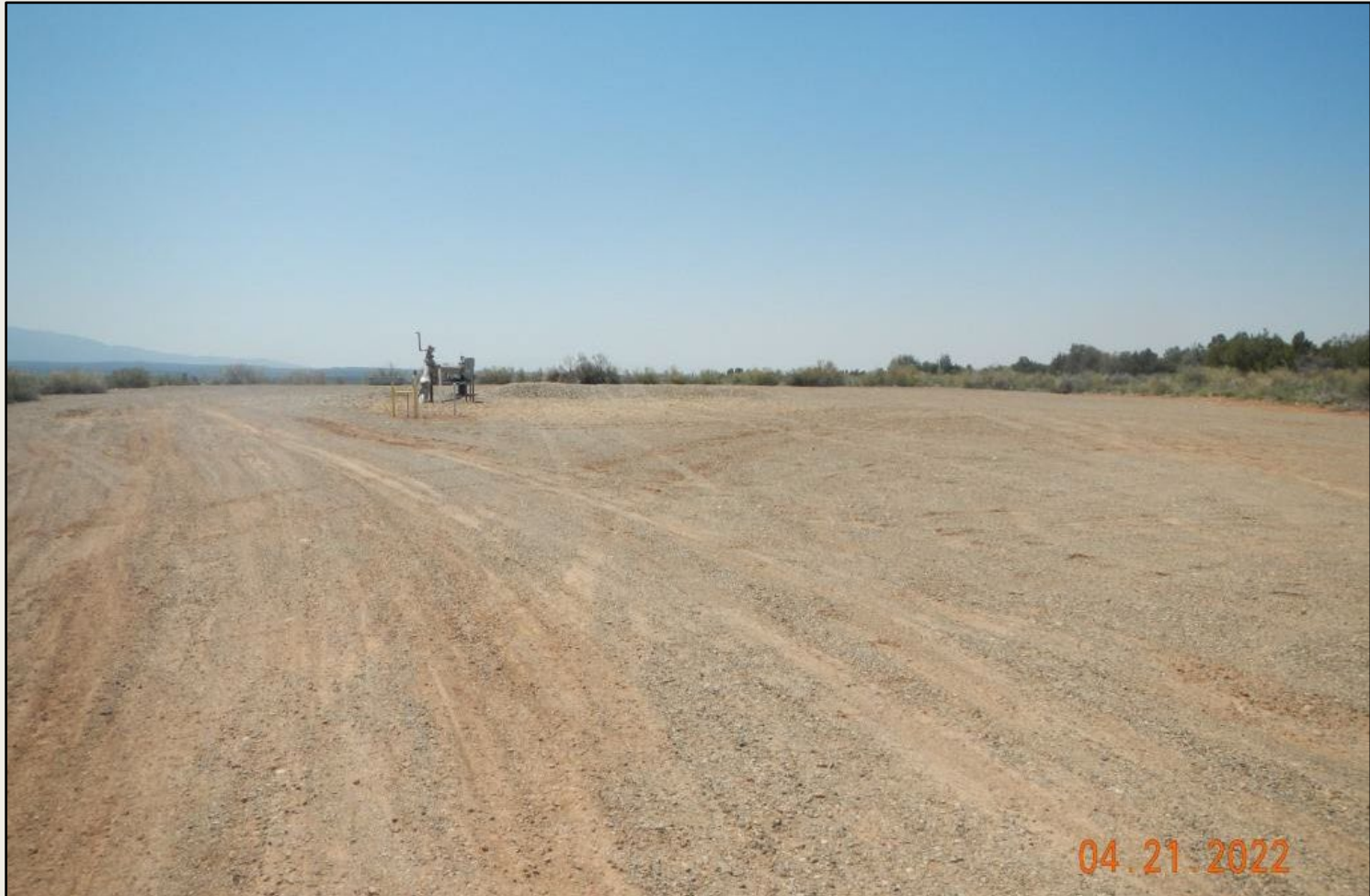
Photo 1. View of the project area from the well pad entrance facing center.