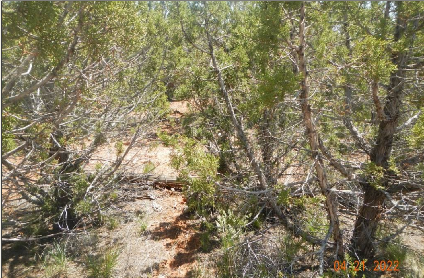
Photo 5. View of reference area comprised of pinyon and juniper woodland with sagebrush ( Artemisia tridentata ), snakeweed ( Guiterrezia sarothrae ), Indian ricegrass ( Achnatherum hymenioides ), and muttongrass ( Poa fendleriana ).