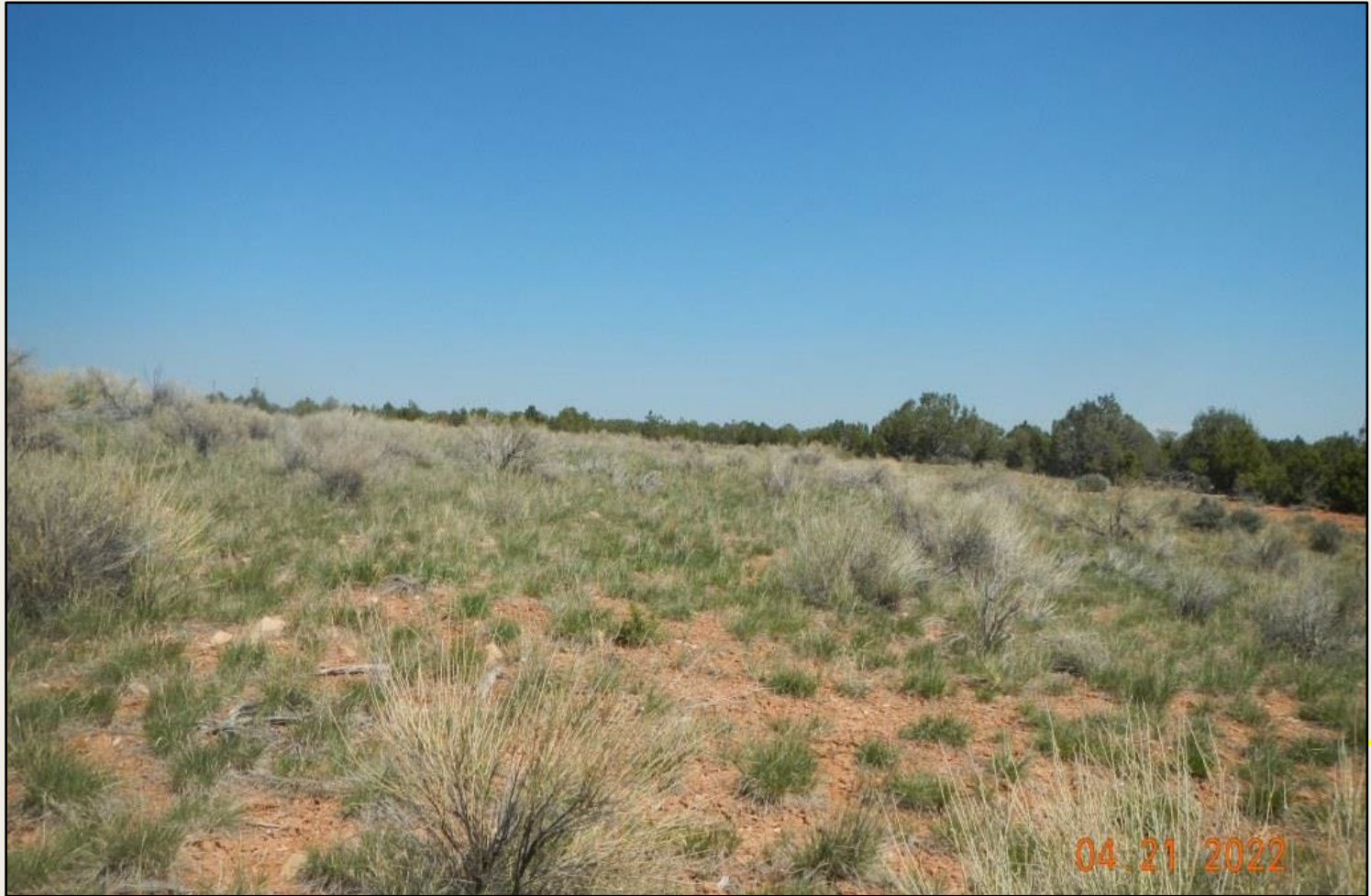
Photo 3. View of the eastern project area from the southeastern corner facing northward.