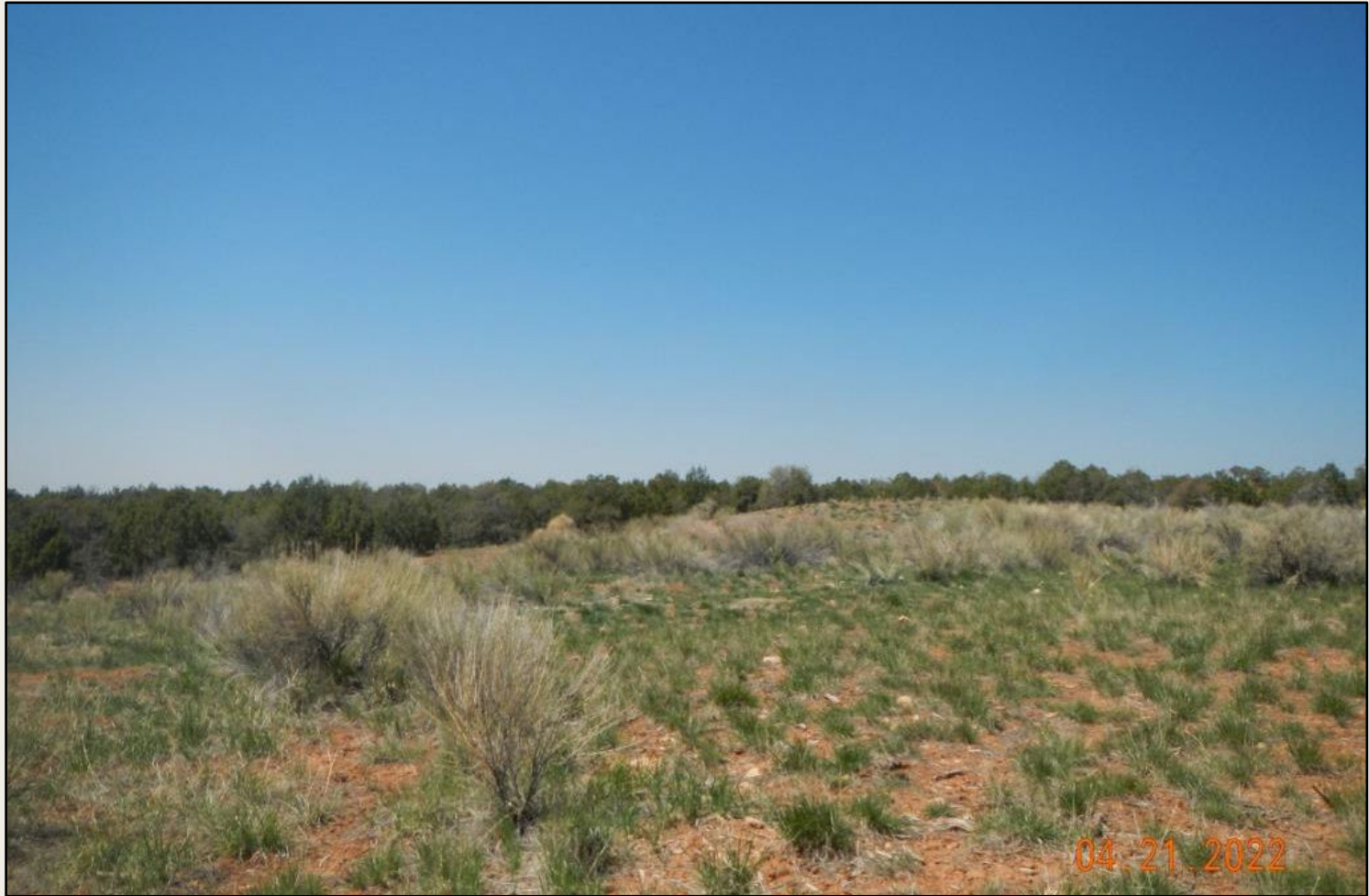
Photo 2. View of the southern project area from the southeastern corner facing westward. Revegetation is progressing with rubber rabbitbrush ( Chrysothamnus nauseosus ), crested wheatgrass ( Agropyron smithii ), western wheatgrass ( Pascopyrum smithii ), and sand dropseed ( Sporobolus cryptandrus ).