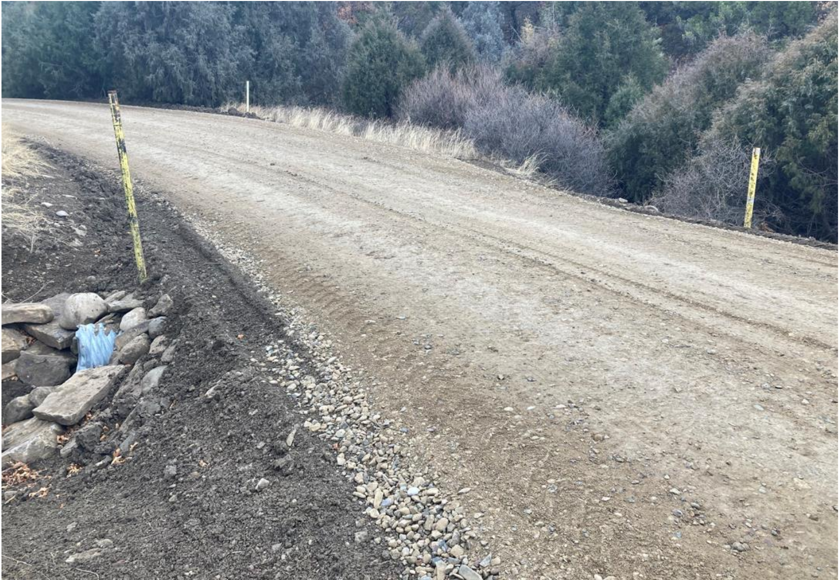
GRAVEL WAS INSTALLED OVER THE DISTURBACE FROM THE NEW CULVERT INSTALLATION TO STABILIZE THE ROAD SURFACE.

APACHE CANYON 17-14 API# 05-071-06341 – OGRIS OPERATING OGCC OPERATOR NUMBER 10758 - DATE: APRIL 19, 2022 CORRECTIVE ACTIONS COMPLETED REGARDING COGCC FIR DOCUMENT # 693503475