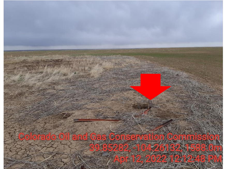
Photo 10 Guy line anchors not properly marked. Dead weeds around location.