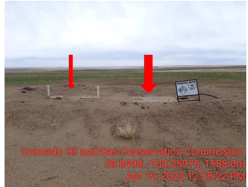
Photo 18 Produced water vaults. There are two vaults and only signage for one tank. Secondary containment has eroded away and is Inadequate.