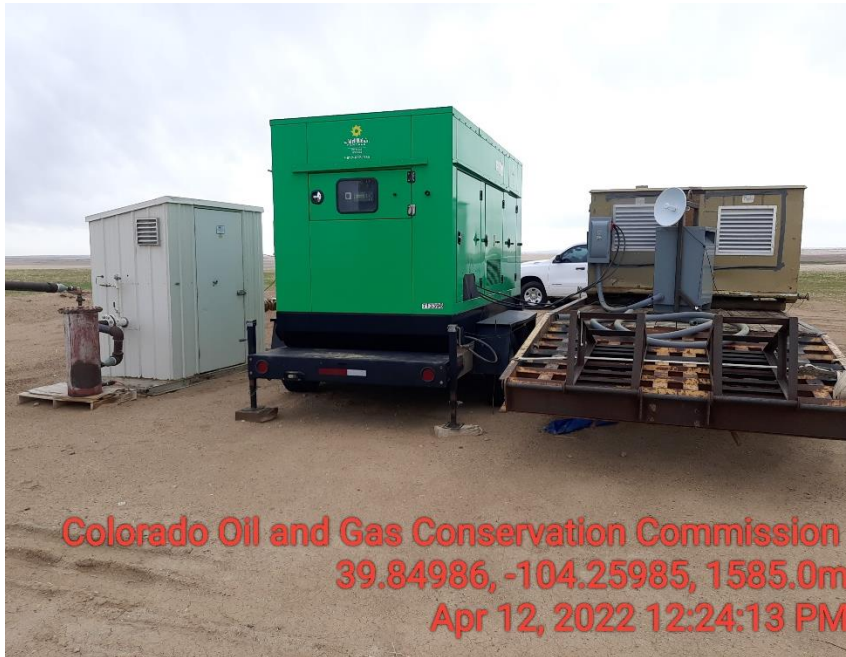
Photo 13 meter house and crypto mining equipment