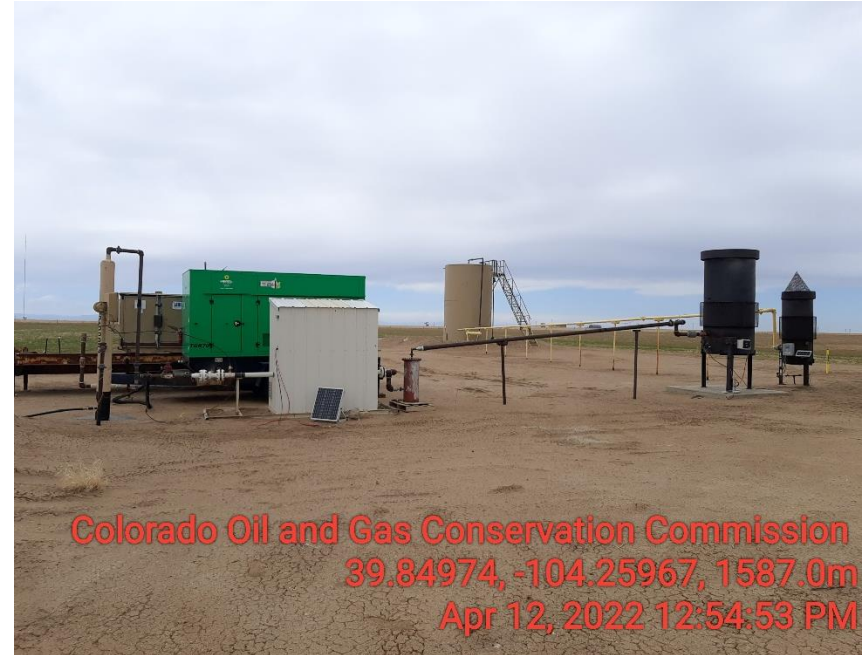
Photo 24 location piping