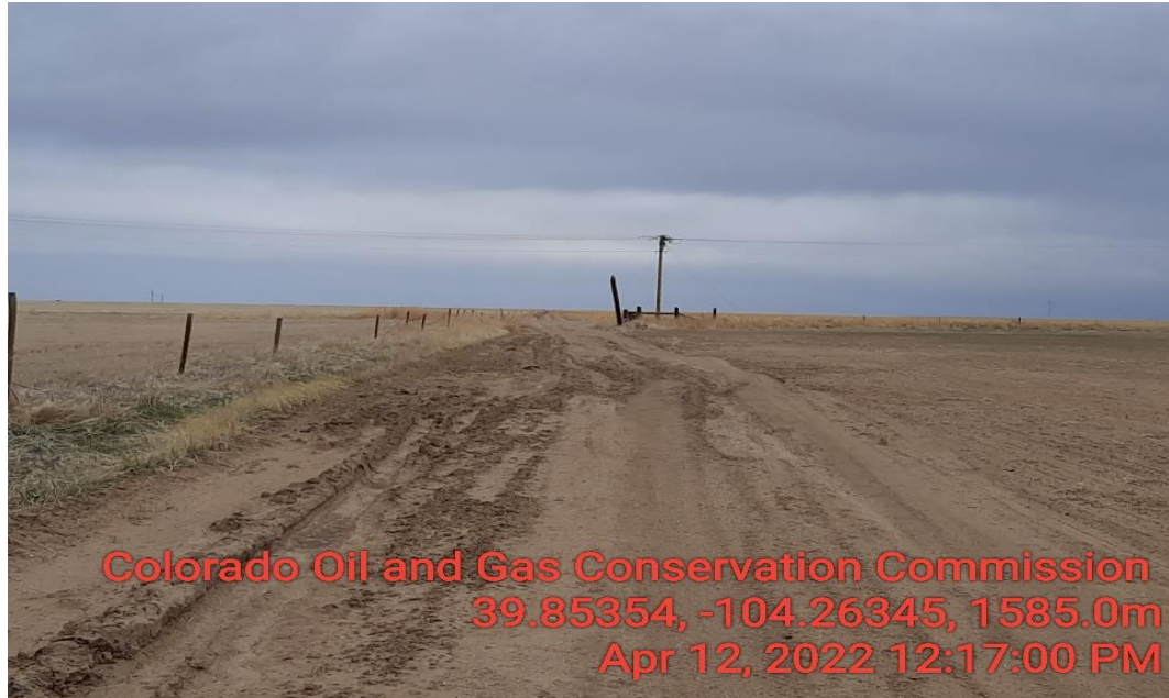
Photo 25 Access road off county road in disrepair vehicles driving off road and in farmers field.