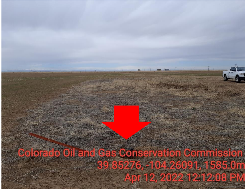
Photo 9 Guy line anchors not properly marked. Dead weeds around location.