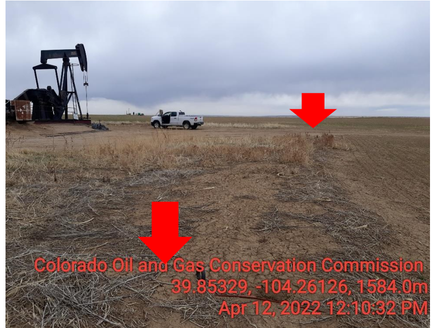
Photo 6 Guy line anchors not properly marked. Dead weeds around location.