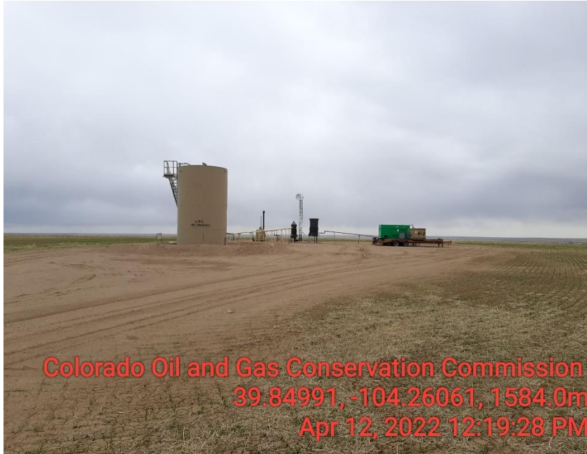
Photo 11 Facility Pic