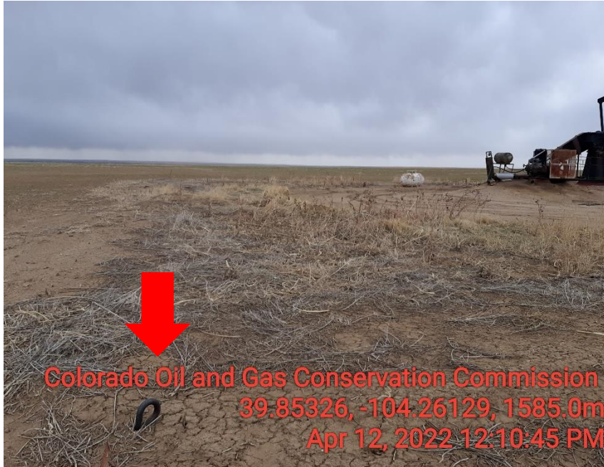
Photo 7 Guy line anchors not properly marked. Dead weeds around location.