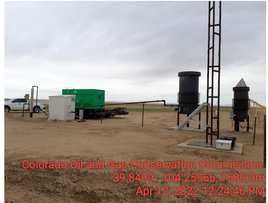
Photo 14 Facility pic.