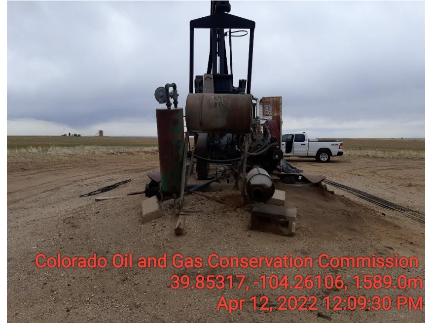
Photo 4 Mechanical issue and stained soil under and around gas powered motor.