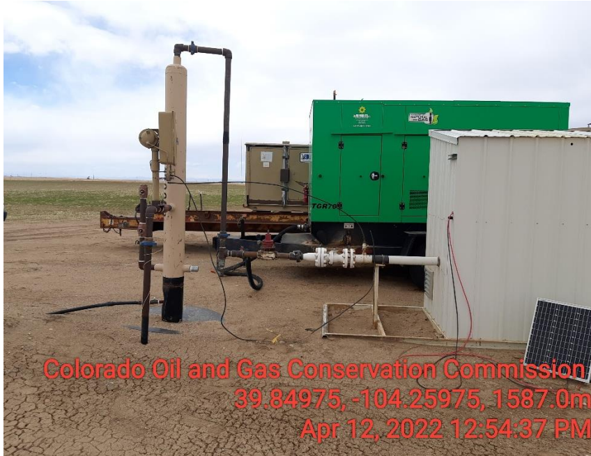
Photo 23 location piping