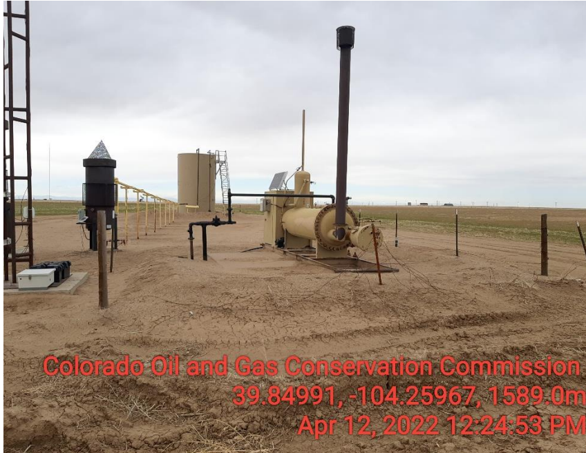
Photo 15 production equipment. Barb wire fence in disrepair.