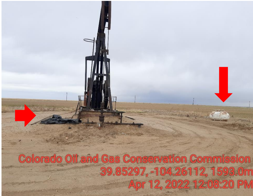
Photo 1 Well head. Trash and unused equipment