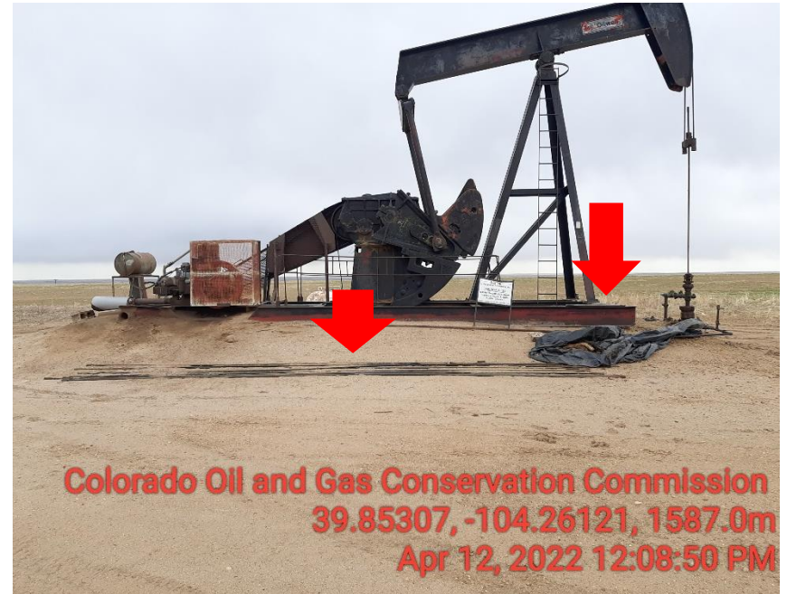
Photo 2 Trash and unused equipment.