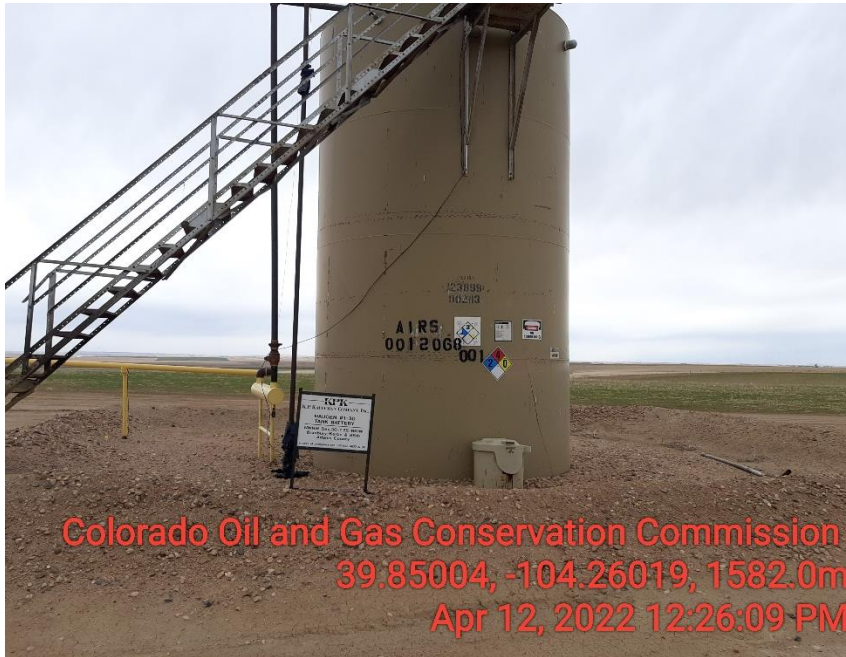
Photo 17 Crude oil tank