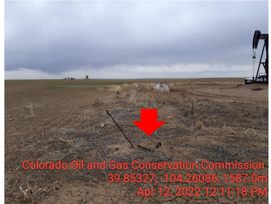
Photo 8 Guy line anchors not properly marked. Dead weeds around location.