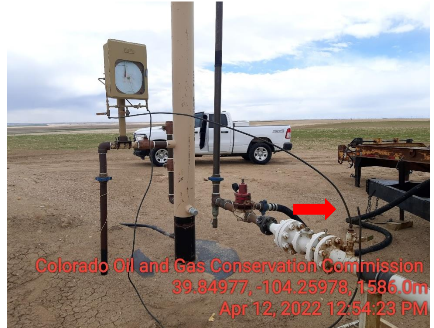
Photo 22 Piping to inlet of meter house and gas supply to generator. Meter tubing not connected.