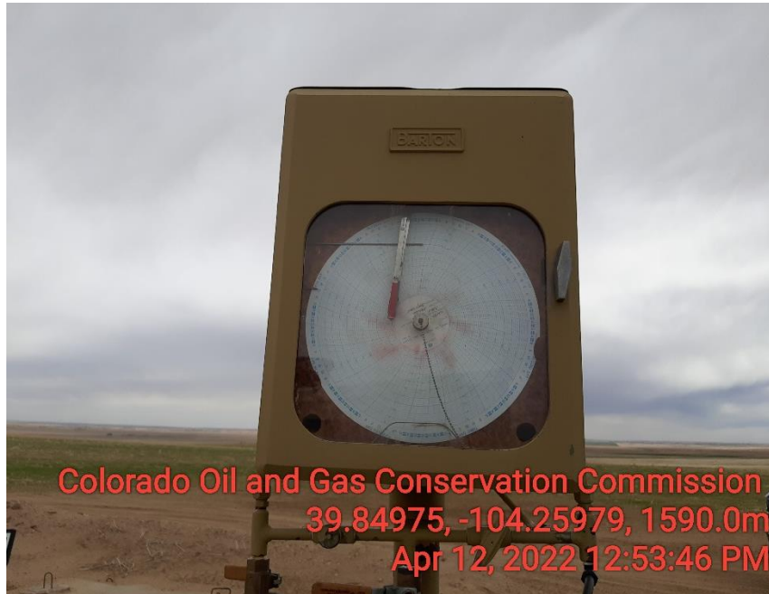
Photo 21 meter on inlet side to meter house