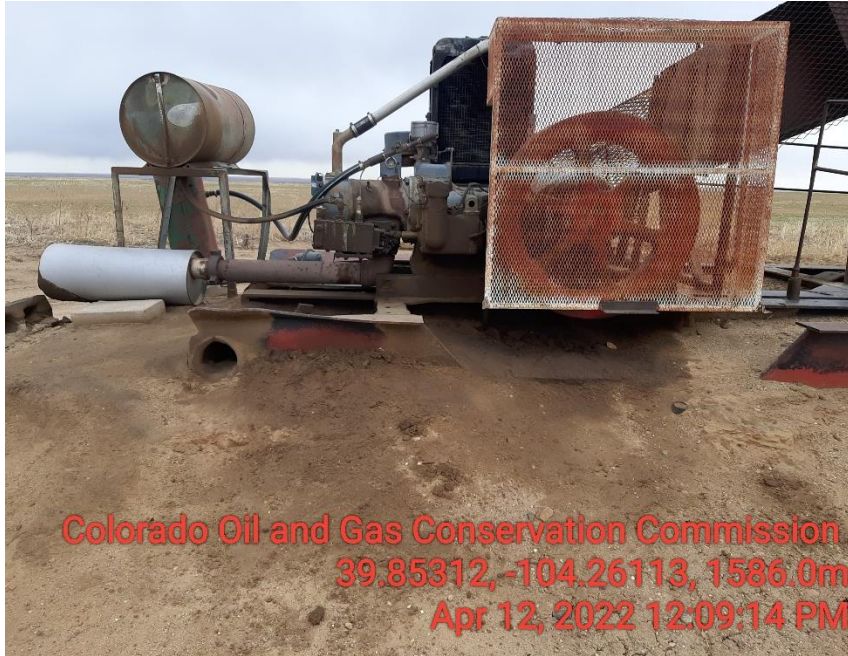
Photo 3 Mechanical issue and stained soil under and around gas powered motor.