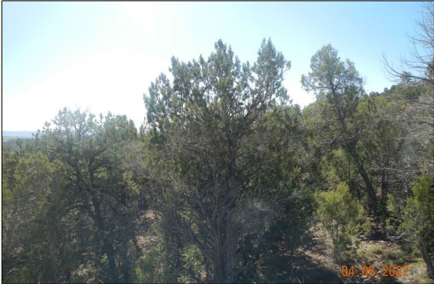
Photo 7. View of reference area comprised of pinyon and juniper woodland with understory of blue grama, prickly pear, Indian ricegrass, sagebrush, and banana yucca.