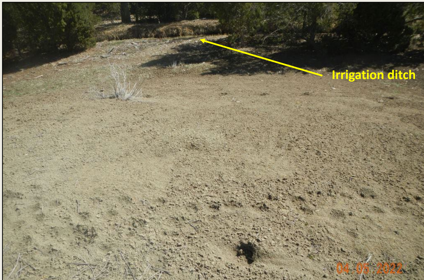
Photo 3. View of bare soils within the eastern fill slope, facing downslope. Irrigation ditch observed at the bottom of the slope.