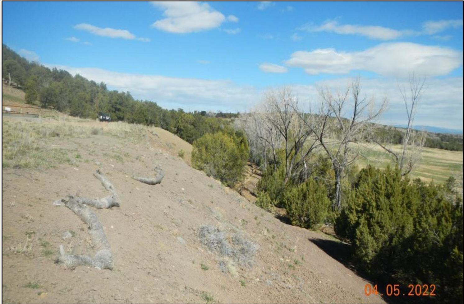
Photo 4. View of the southeastern portion of the fill slope facing northward. Wattles are full of sediment with gaps observed through them. Additional stabilization is needed.