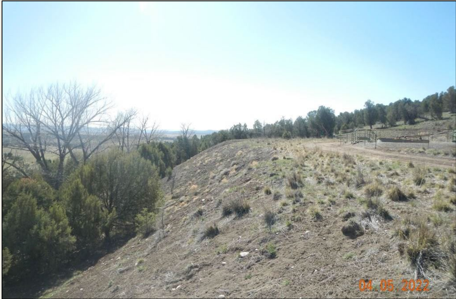
Photo 2. View of the eastern fill slope from the northeastern corner facing southward. Revegetation remains sparse on this slope with scattered grasses such as crested wheatgrass and intermediate wheatgrass becoming established in portions.