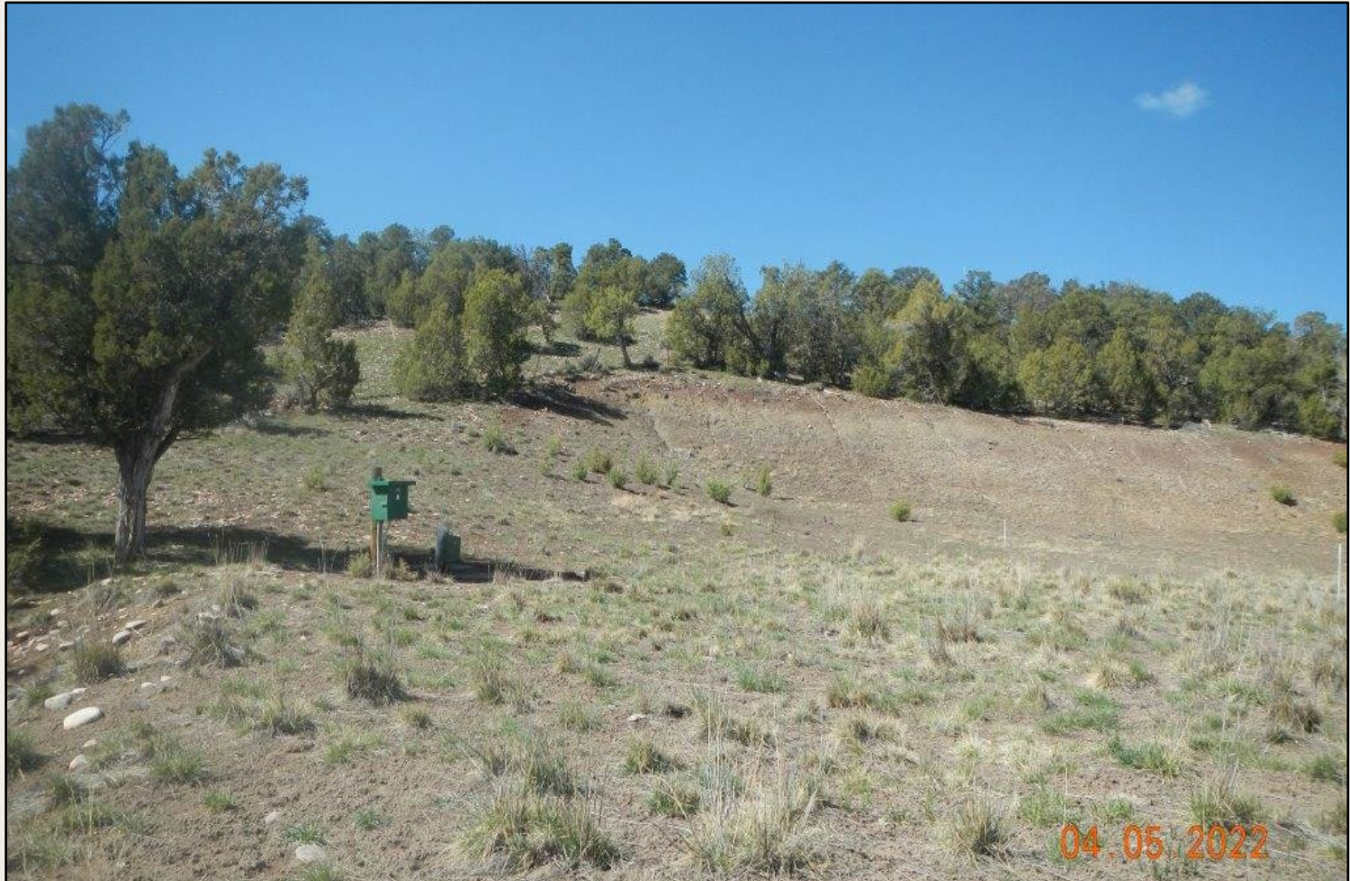
Photo 5. View of the southern project area from the southeastern corner facing westward.