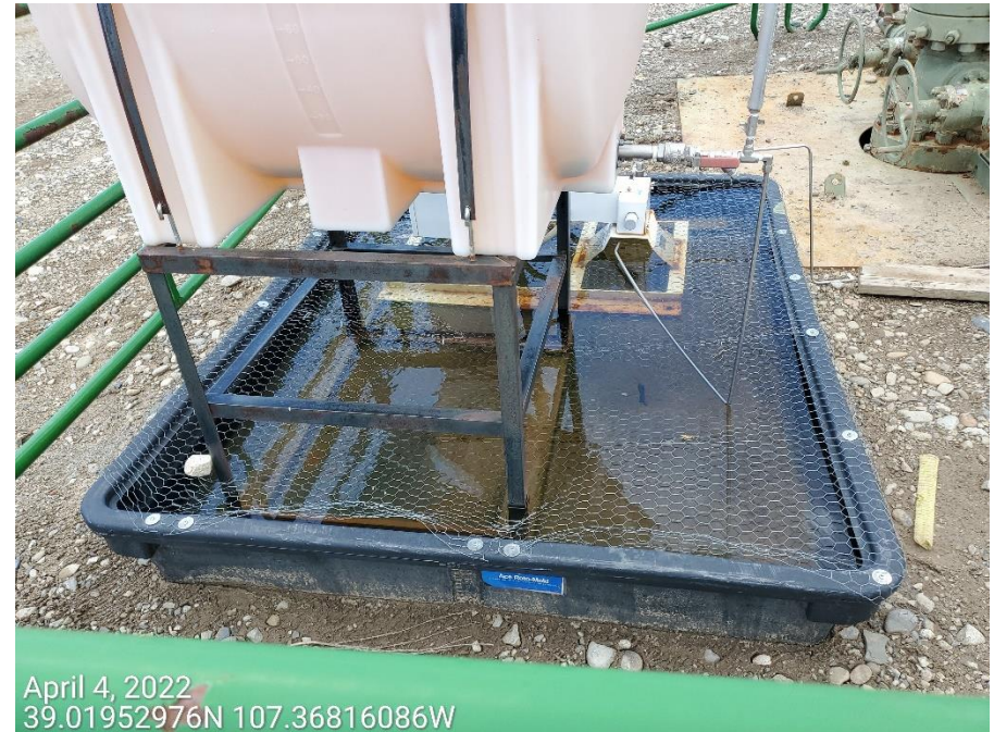
Photo 4: Photo left shows legal description on well sign remains illegible. Photo right shows containment BMP has filled with fluids and is no longer adequate to contain a spill.