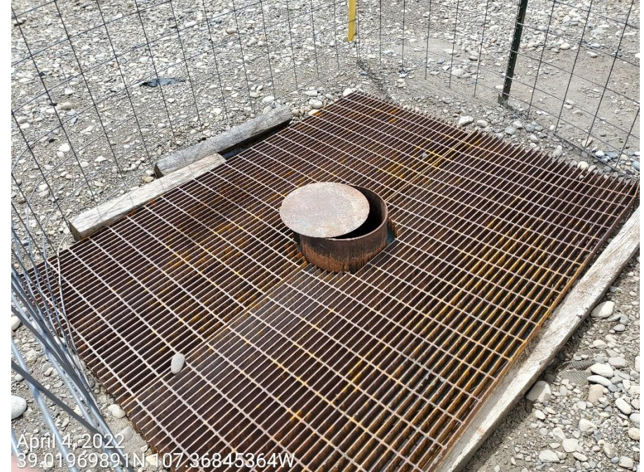
Photo 5: Photos show conductor and cellar for Well API #051-06213; records show well is abandoned; conductor and cellar for this well have not been plugged and reclaimed per Rule 406 requirements; conductor and cellar remaining; plate on top of the conductor pipe not welded per requirements. No Form 4 - "Report of work done" to report plugging of the conductor has been submitted. Well conductor requires plugging and reclamation.