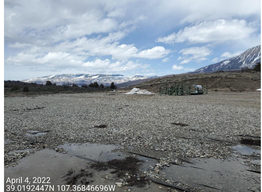
Photo 2: Photos 2-3 taken from the west end of the production area. Photos provide an overview of the Location from northwest, north, southeast to south.