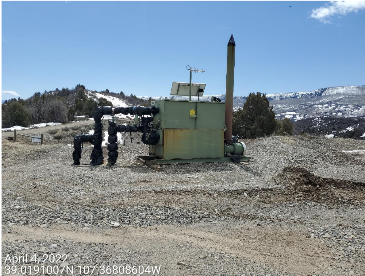
Photo 7: Required labeling at Heated separator with glycol storage tank not evident.