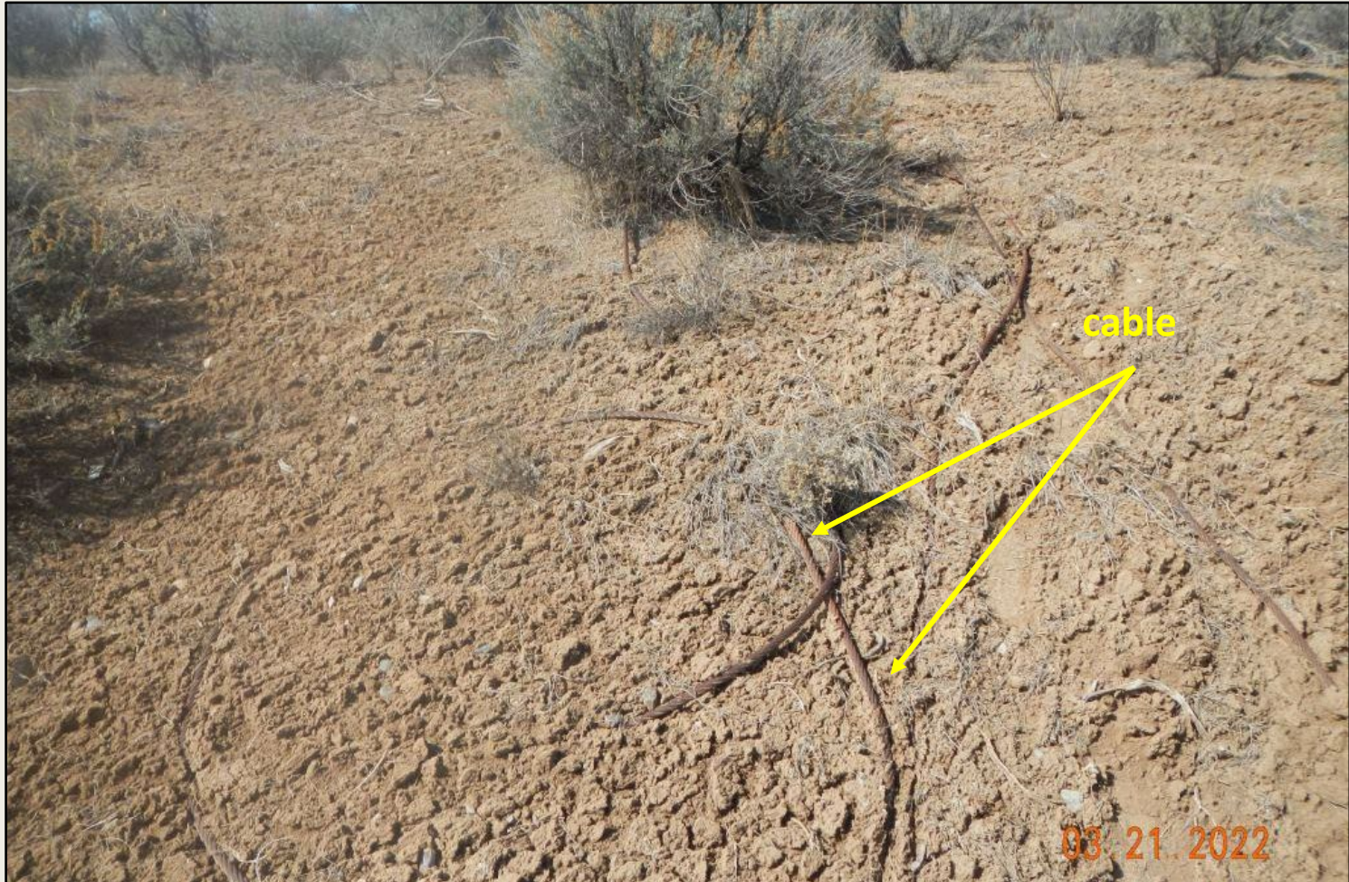
Photo 3. View of cable debris that remains within the eastern project area.