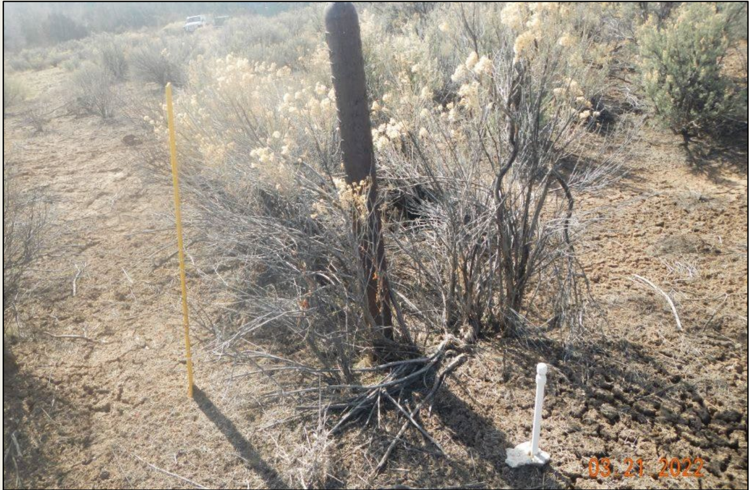
Photo 2. View of risers that remain around the wellhead marker.