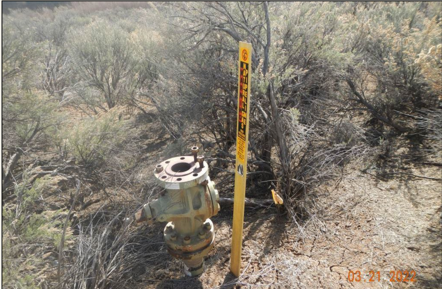
Photo 4. View of riser east of the former well pad that appears to be no longer in use.