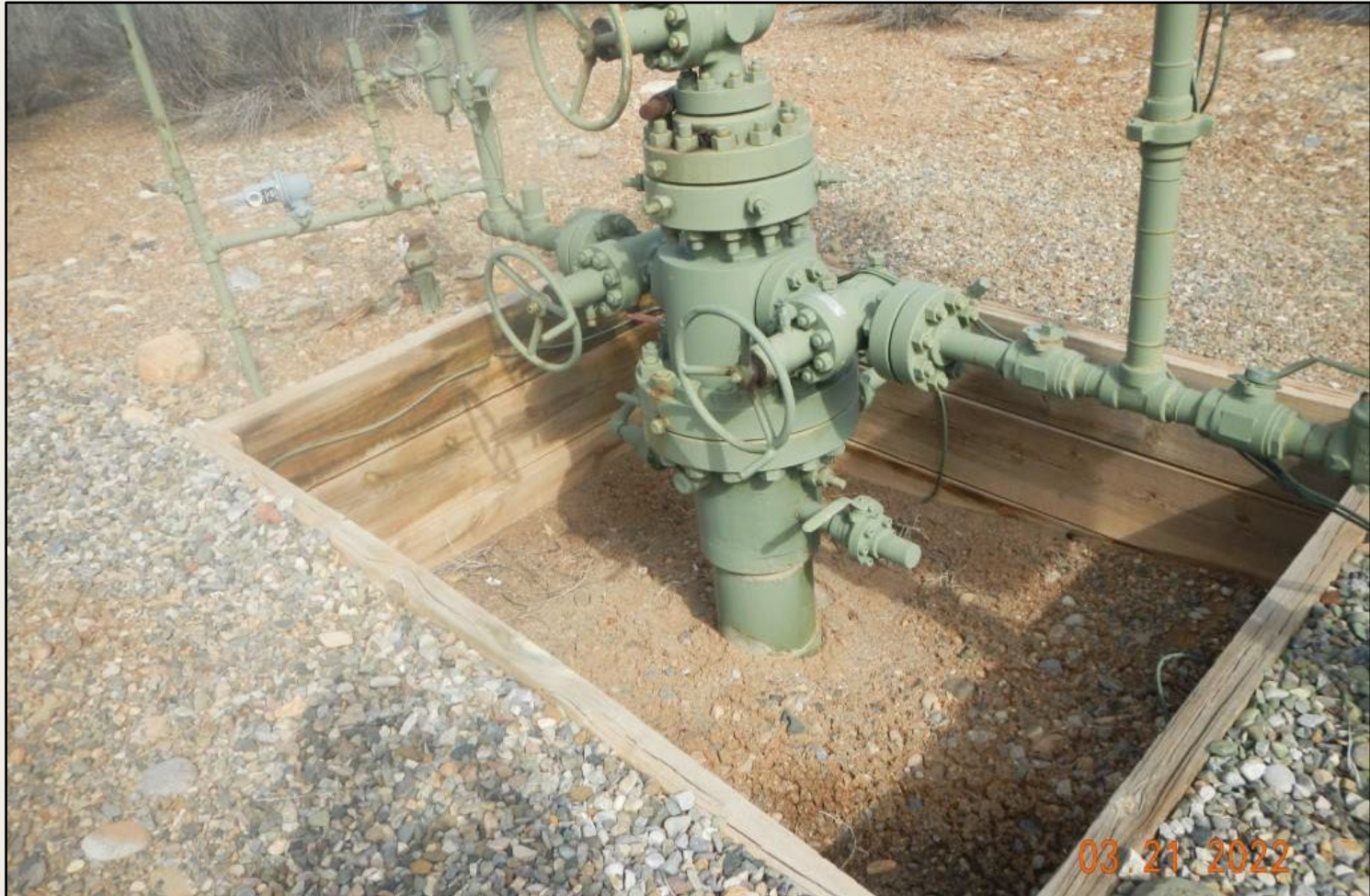
Photo 6. View of open cellar around the wellhead needing cover for wildlife protection.