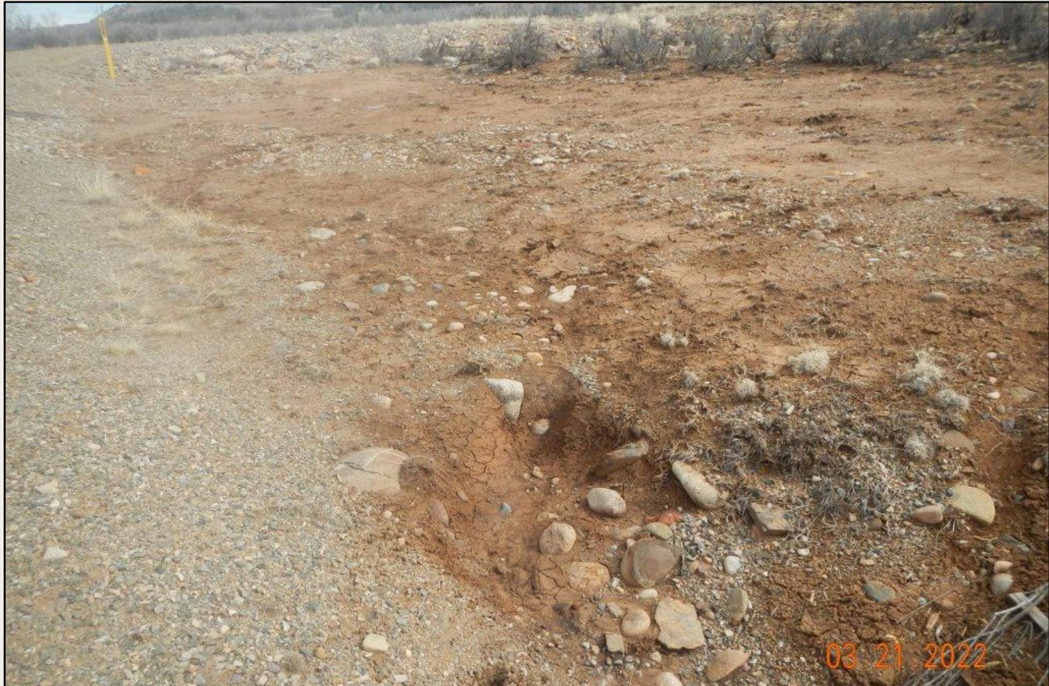
Photo 4. Another view of area in the southern project area (between access road and well pad, where vegetation is killed. Revegetation has not been conducted here. Topsoil scouring, pedestalling, and rilling observed.