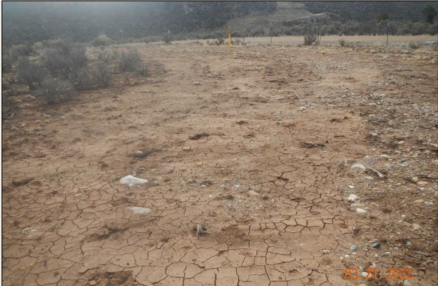
Photo 2. View of area where it appears that herbicide overspray has killed vegetation. Corrective action to revegetate areas where vegetation is killed from previous reclamation inspection is not addressed.