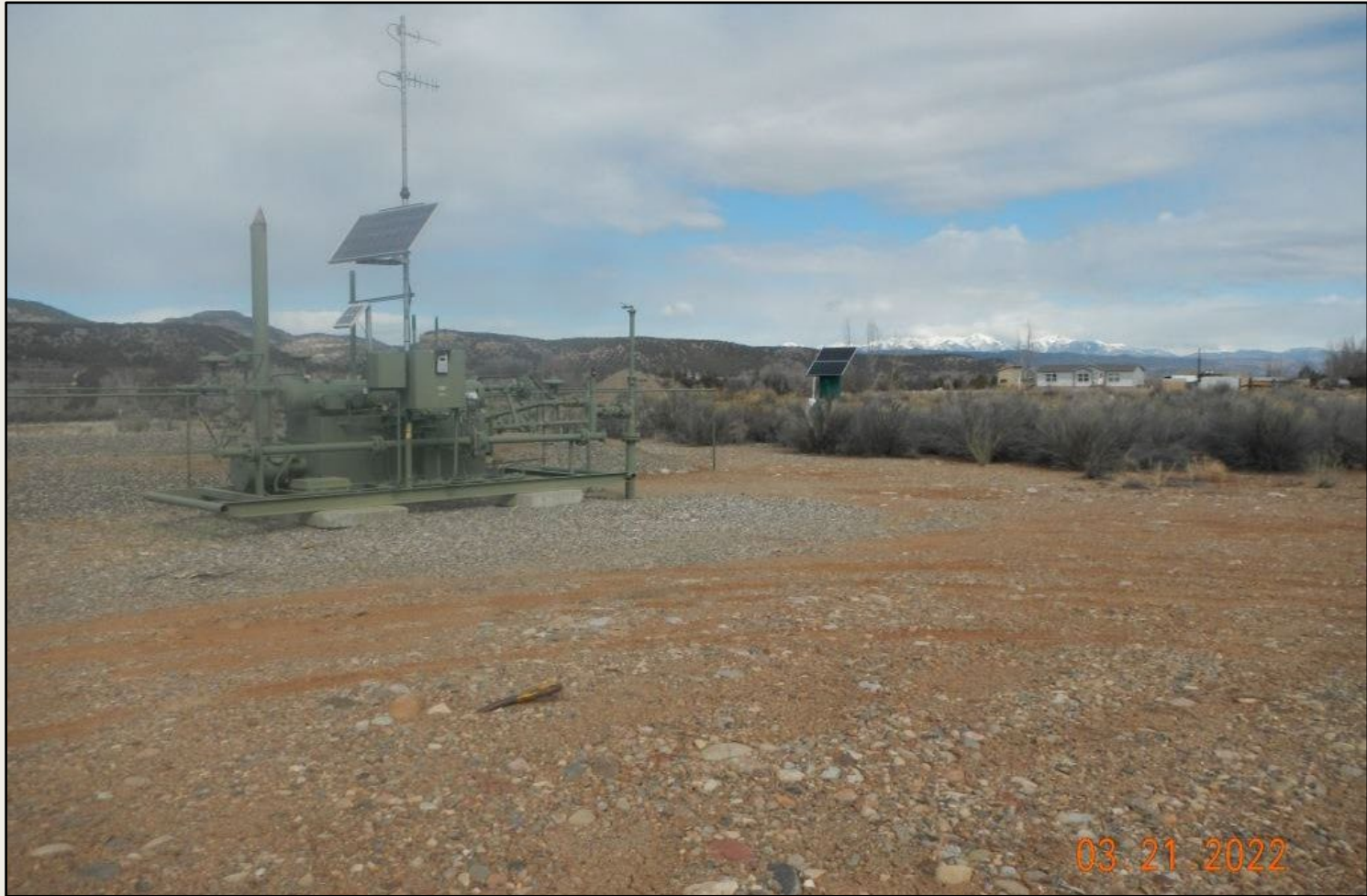
Photo 1. View of the project area from the well pad entrance facing center.