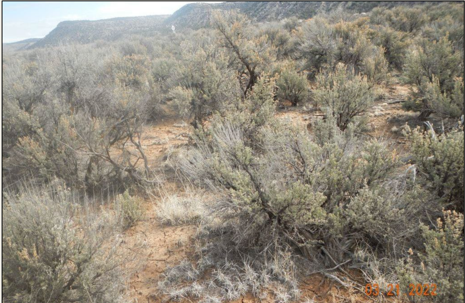
Photo 7. View of reference area comprised of sagebrush shrubland with understory of James galleta, squirreltail, prickly pear, and penstemon.