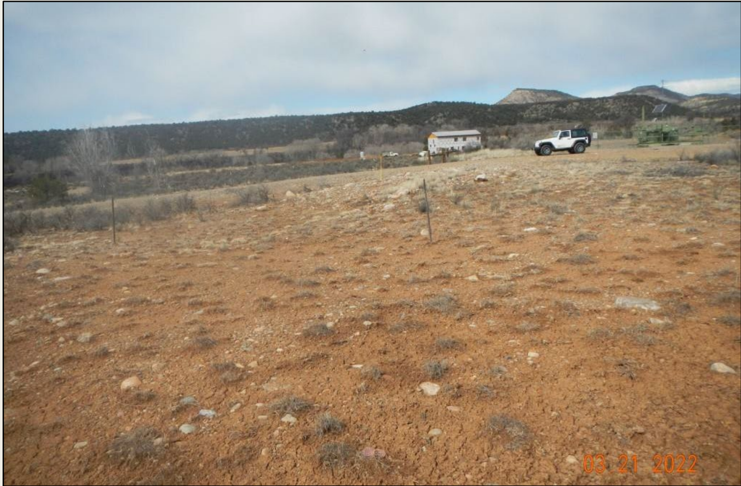
Photo 5. View of the southern project area from the southeastern corner facing westward. Grasses in the foreground largely appear dead. Spot seeding is needed in areas with sparse and bare vegetation and where there is vegetation die-off.