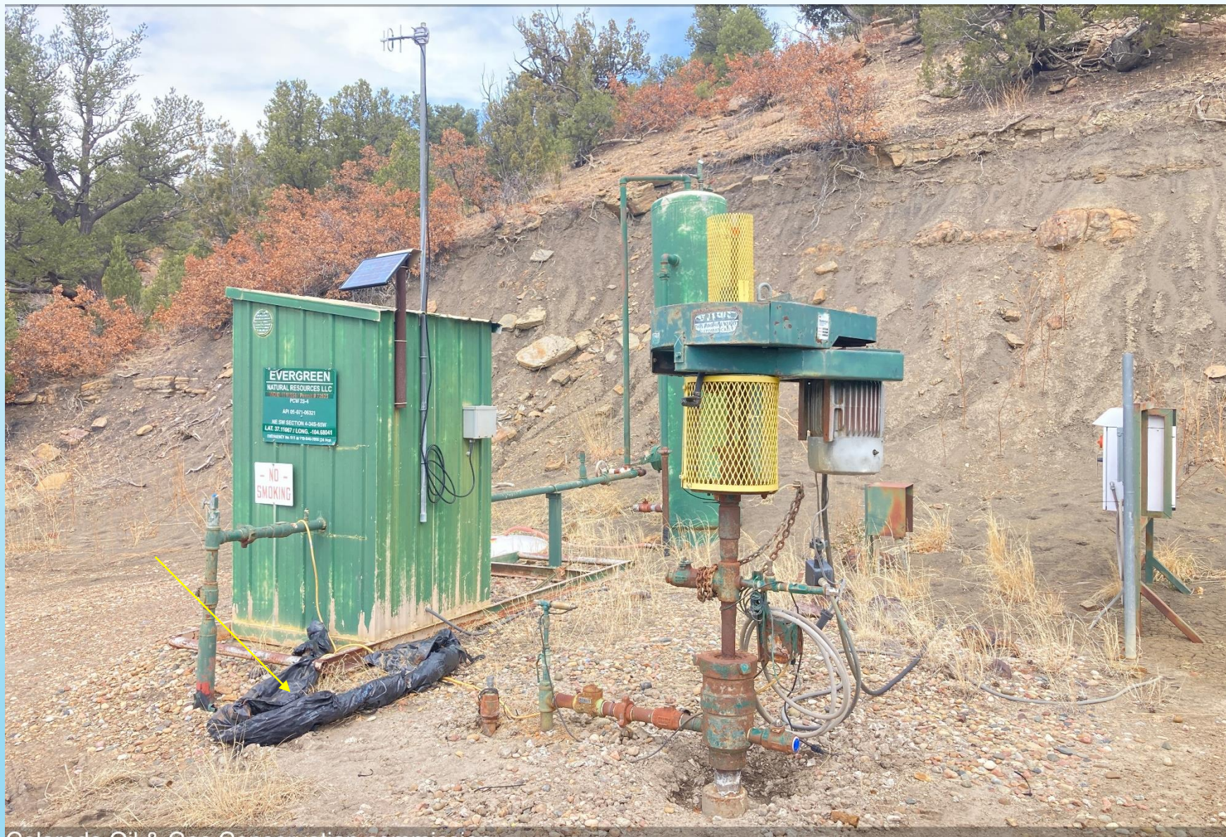
PHOTO 3: WELLHEAD AND EQUIPMENT/ TRASH ON LOCATION (BLACK PLASTIC PIPE INSULATION). REMOVE TRASH, COMPLY WITH RULE 606. CA DATE 4-7-2022.