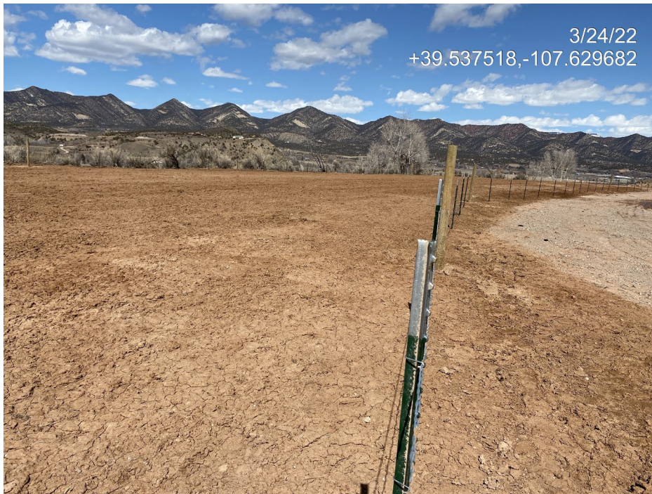
Photo 4. Photo taken from the west of the Location facing north shows interim areas of the Location where the working pad has recently been reduced.