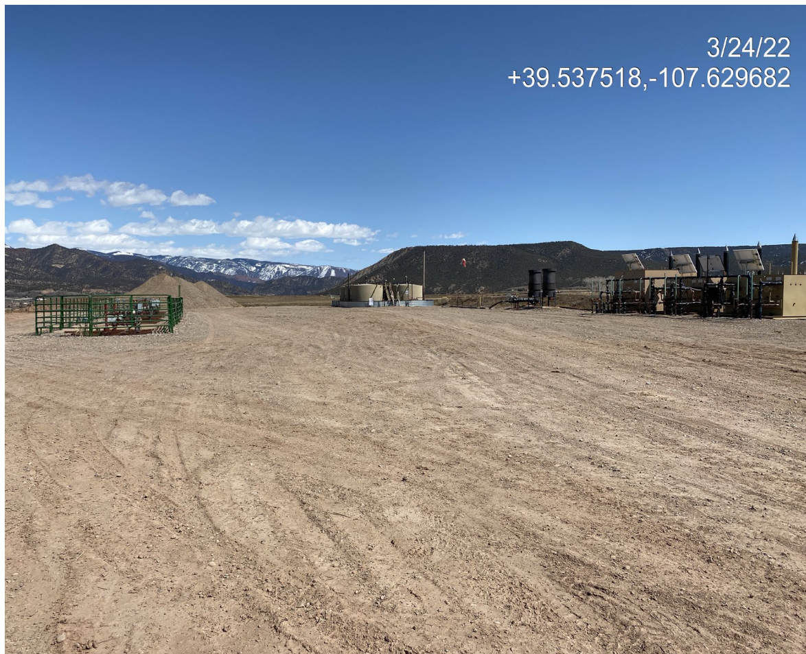
Photo 1. Photo taken from the Location entrance shows an overview of the Location.