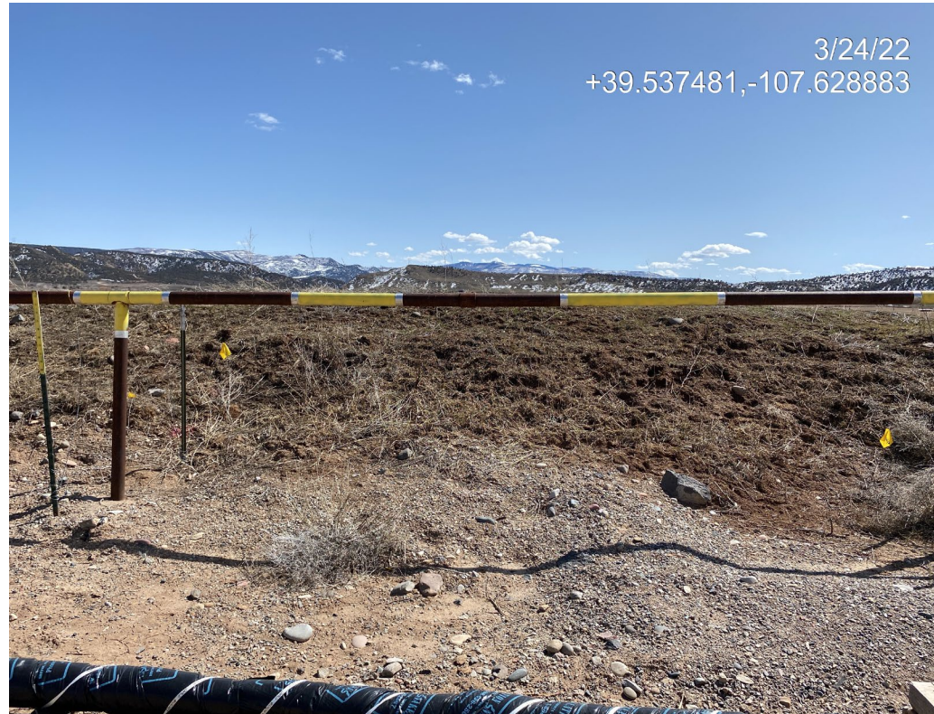
Photo 7. Photo taken from the south of the Location facing south shows cut slopes are colonized by perennial grasses.