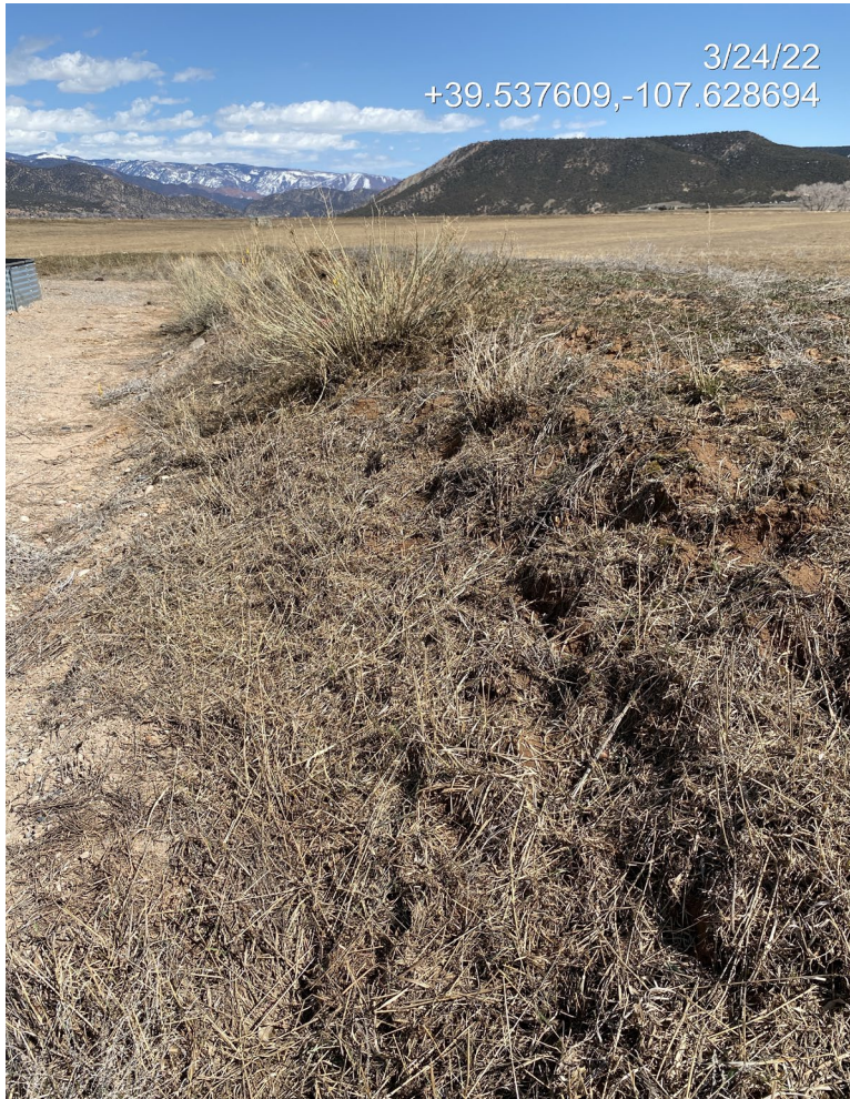
Photo 6. Photo taken from the south of the Location facing east shows cut slopes are colonized by perennial grasses and occasional shrubs.