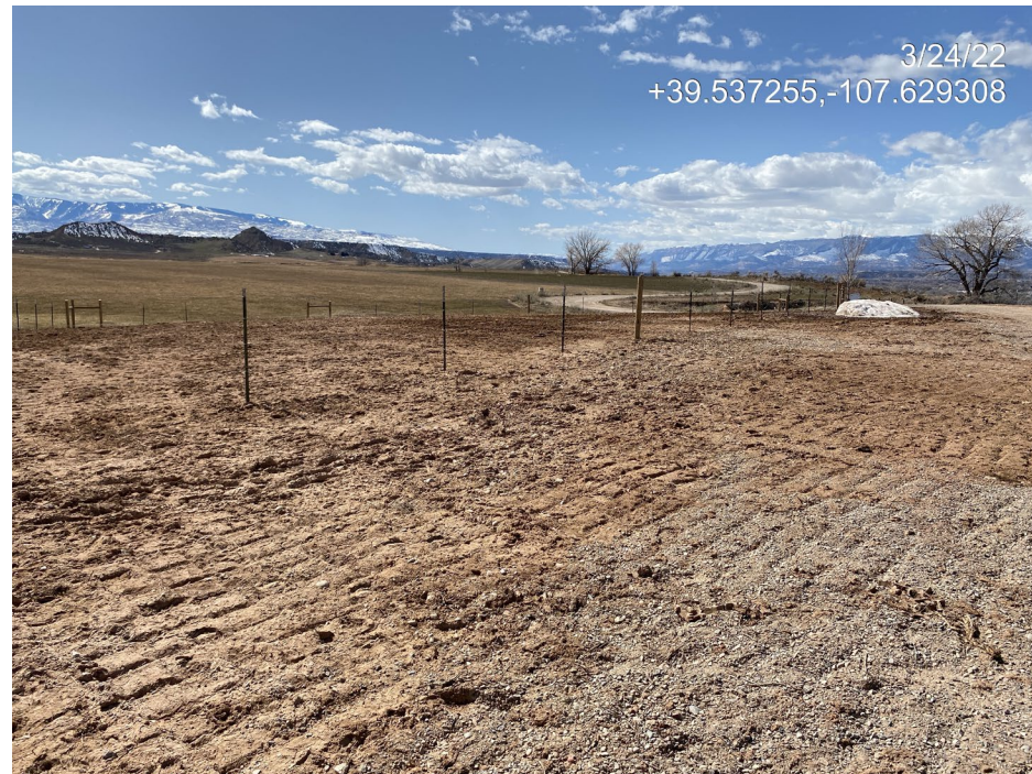
Photo 5. Photo taken from the south of the Location facing west shows interim areas of the Location where the working pad has recently been reduced.