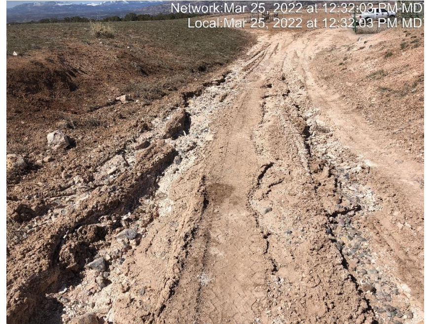
Photo #6295 Sediment has been transported from access road on to location.