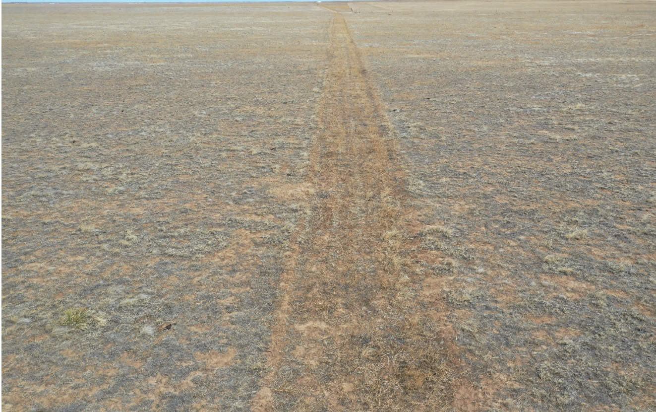
Photo 1. Drone aerial photo facing east toward the reclaimed portion of access road.