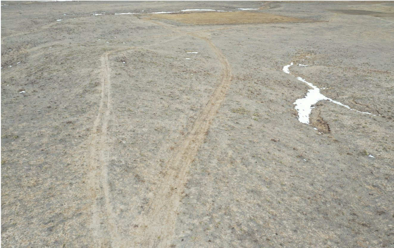
Photo 2. Drone aerial photo facing northeast along the former access road which.