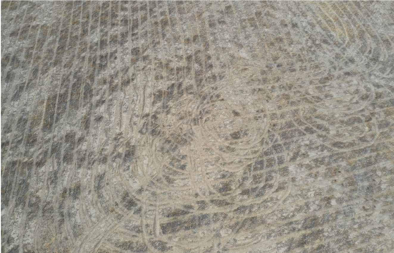
Photo 6. Facing down toward the groundcover. There appears to be mostly undesirable weeds throughout the location. Mowing has been performed but additional reseeding will need to be performed.