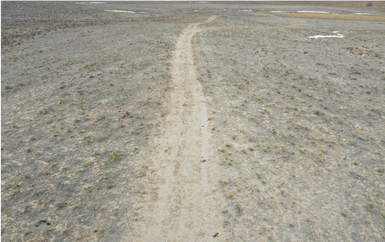
Photo 3. Drone aerial photo facing northeast toward the access road. The vegetation does not appear to be establishing along the road.