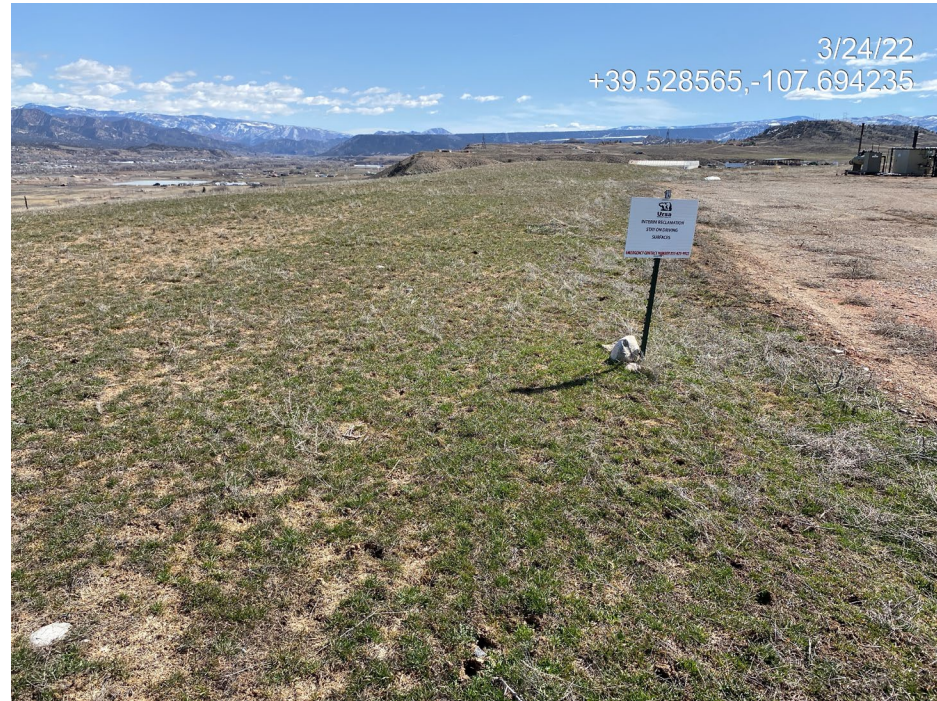
Photo 6. Photo taken from the northern interim areas of the Location facing east. Refer to additional comments under Photo 5.