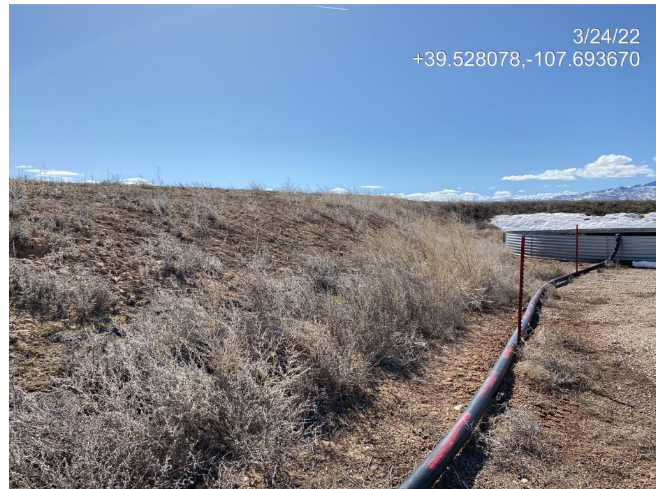
Photo 8. Photo taken from the east of the Location facing southeast shows cut slopes dominated by the undesirable plant species/weed, kochia.