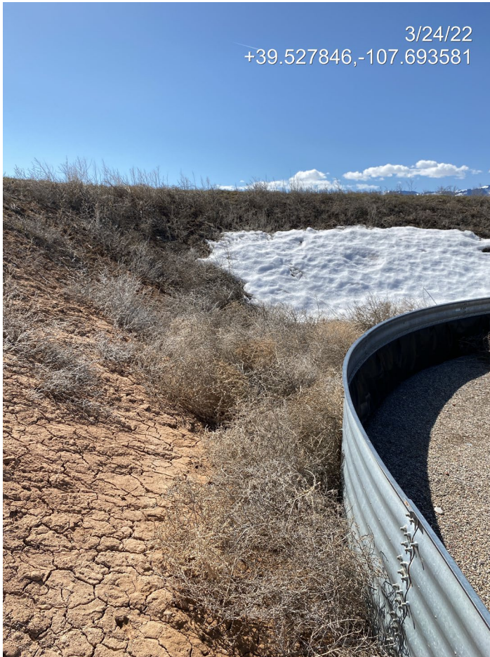
Photo 1. Photo taken from the southeast of the Location shows undesirable plant species/weed debris accumulating in interim areas and production areas adjacent to the tank battery.