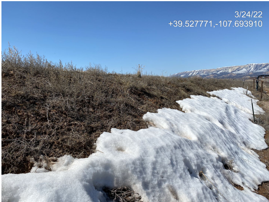
Photo 7. Photo taken from the south of the Location facing west shows cut slopes dominated by the undesirable plant species/weed, kochia. The perennial grass, crested wheatgrass is also present, but uncommon.