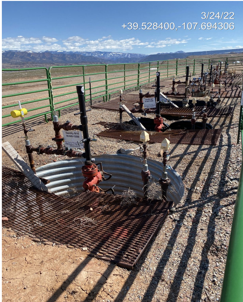
Photo 3. Photo shows BMPs to prevent wildlife access to the well cellars were missing or insufficient