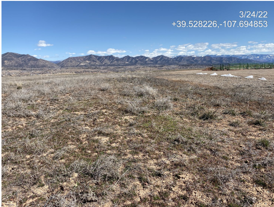
Photo 5. Photo taken from the western interim areas of the Location facing northeast shows interim areas dominated by annual, non-native and undesirable plant species/weeds including kochia, cheatgrass, mustard sp. and annual wheatgrass.