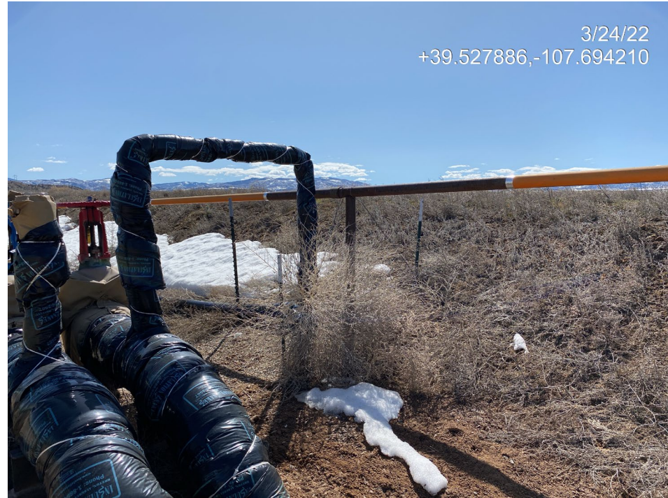
Photo 2. Photo taken from the south of the Location shows undesirable plant species/weed debris accumulating in production areas.