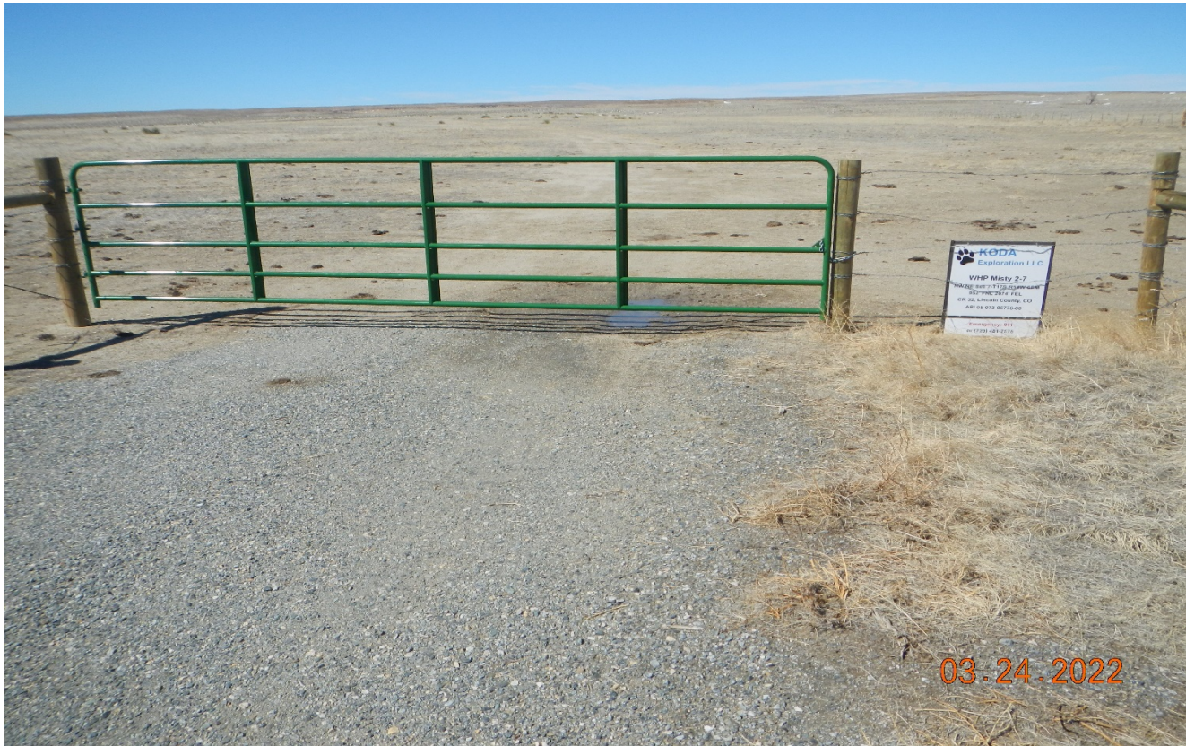
Photo 1. Facing southwest at the beginning of the access road. If well is plugged and abandoned the gravel will need to be removed and road will need to be reclaimed.