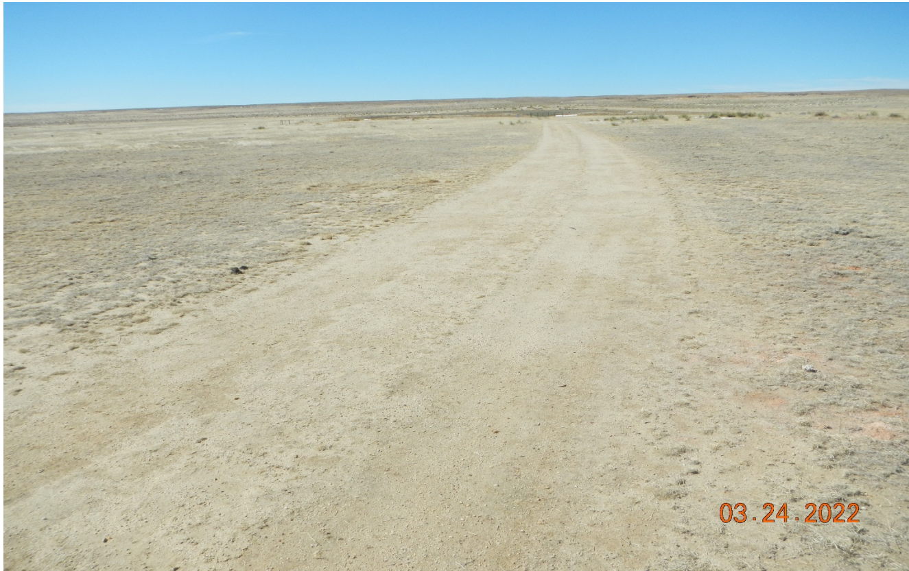
Photo 2. Facing southwest along the access road.