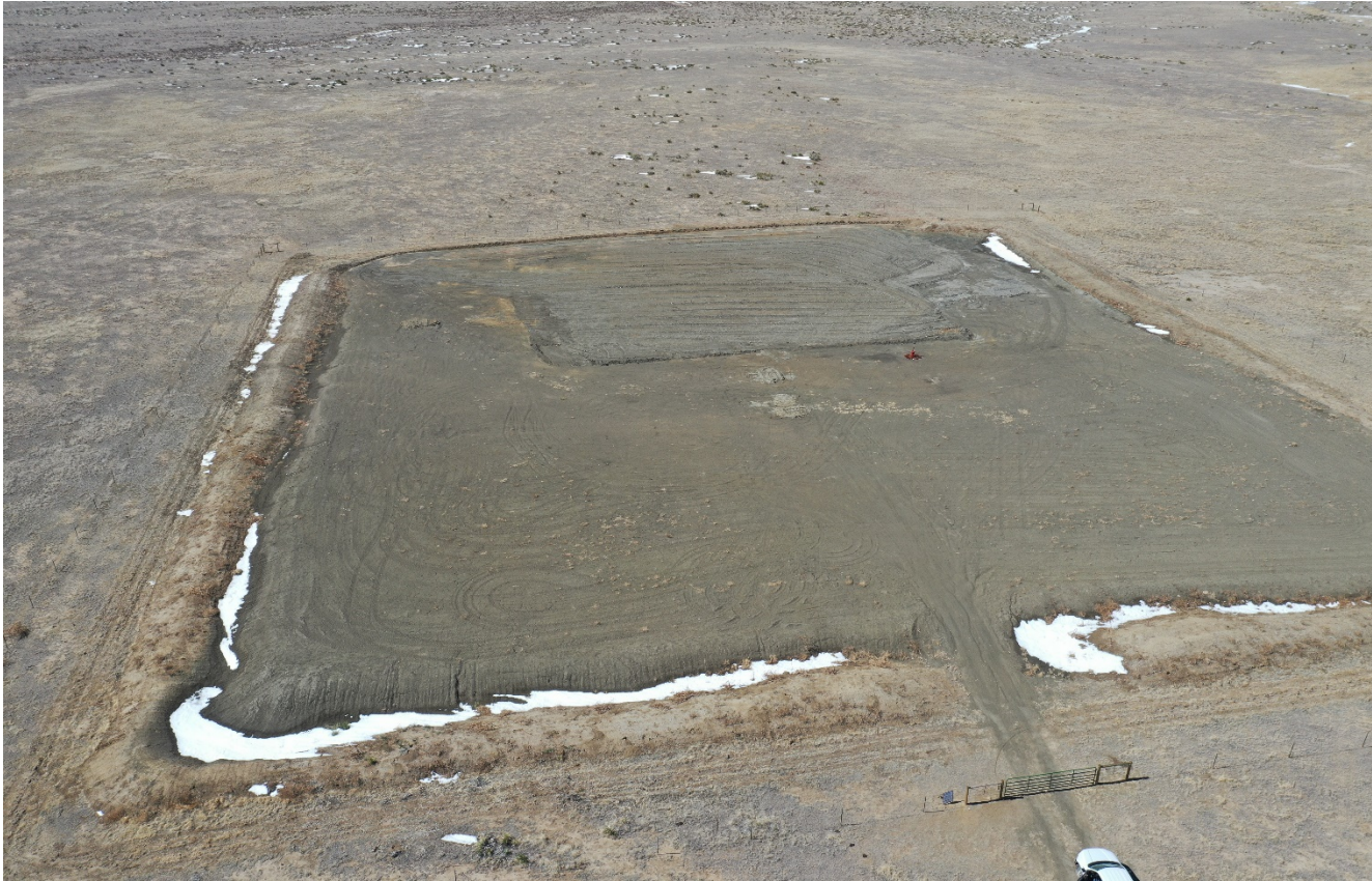
Photo 4. Drone aerial photo facing west toward the location. The location has not been reclaimed per the 1003 Rules. Soils are not protected from erosion and degradation.