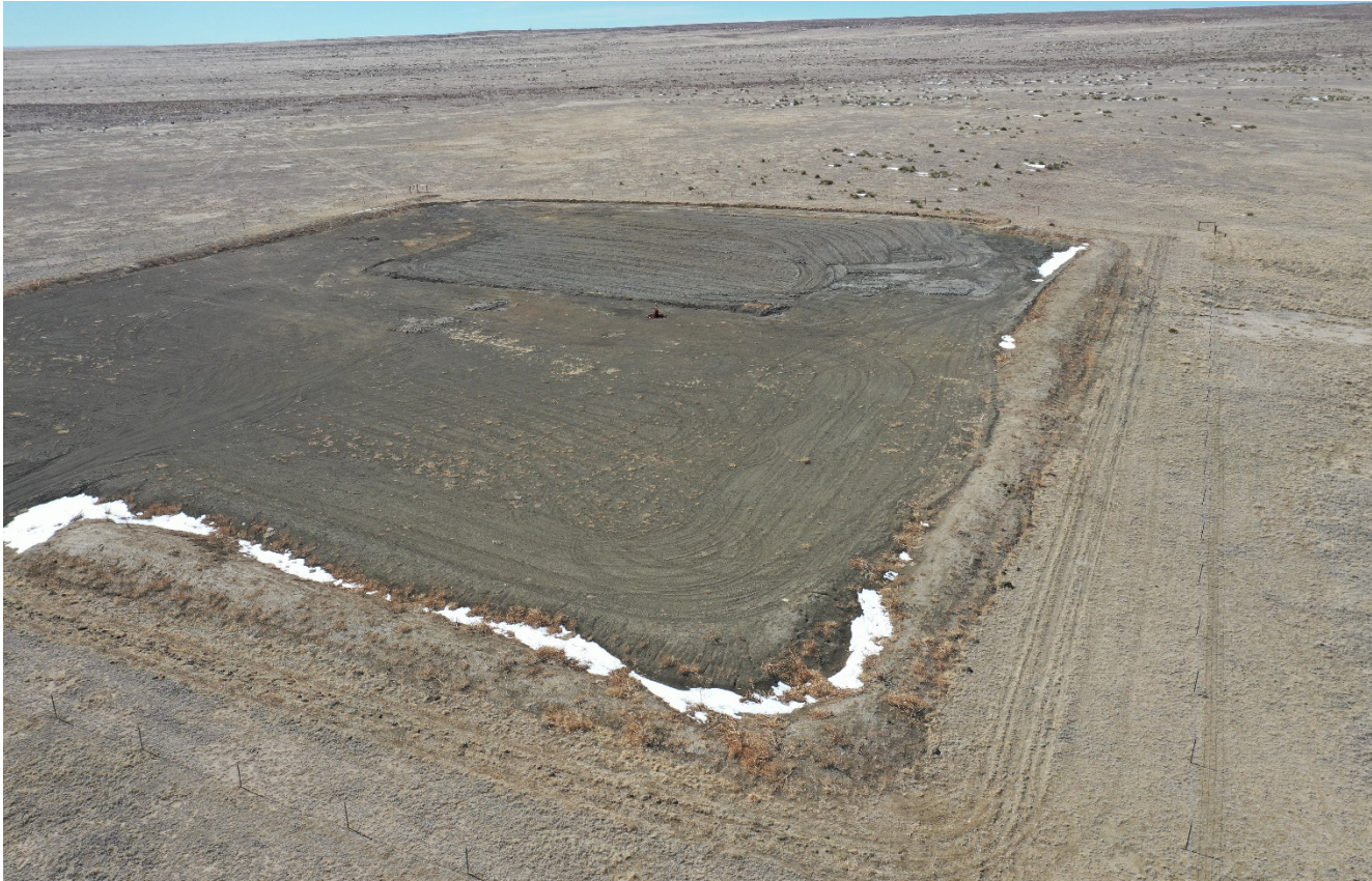
Photo 5. Facing southeast toward the location. The pit has been backfilled however reclamation has not been performed. Bare soils are susceptible to erosion.