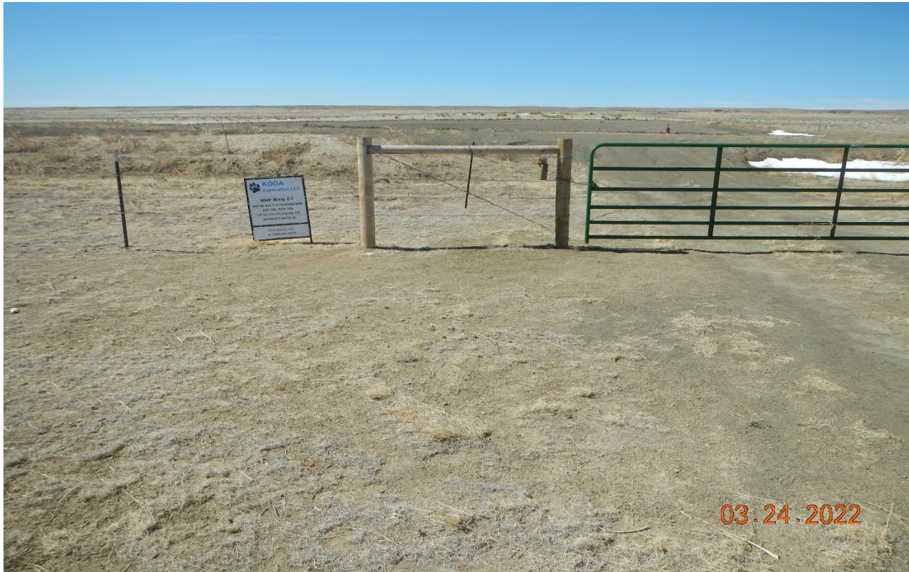
Photo 3. Facing southwest toward the fenced location.