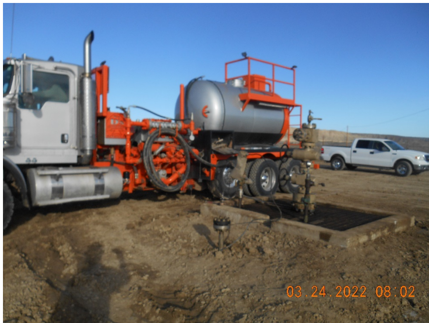
Injection wellhead during MIT.