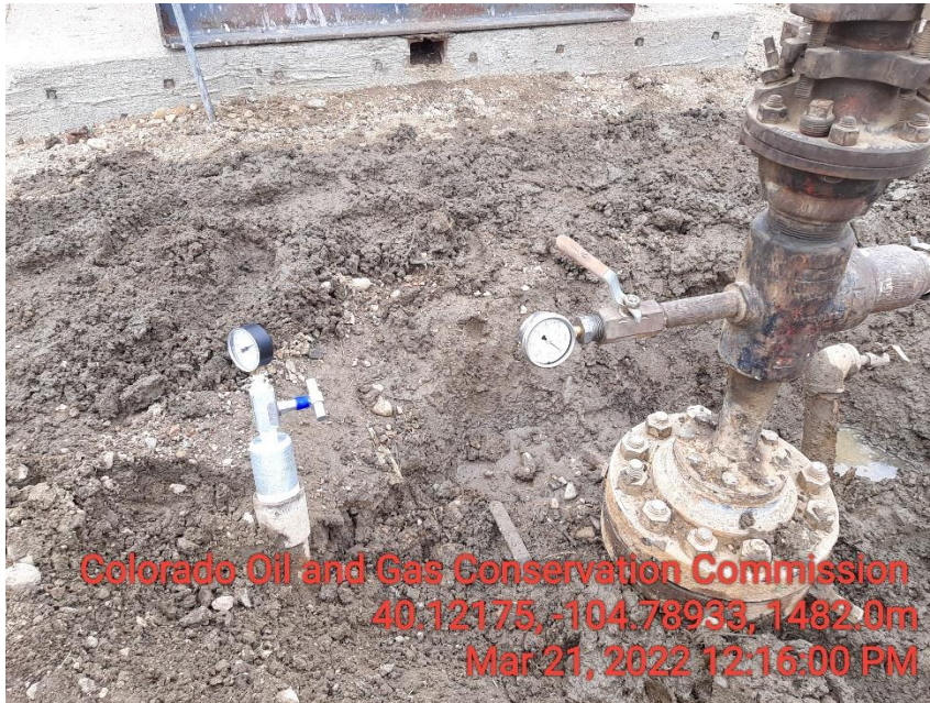
Photo 17 end of test