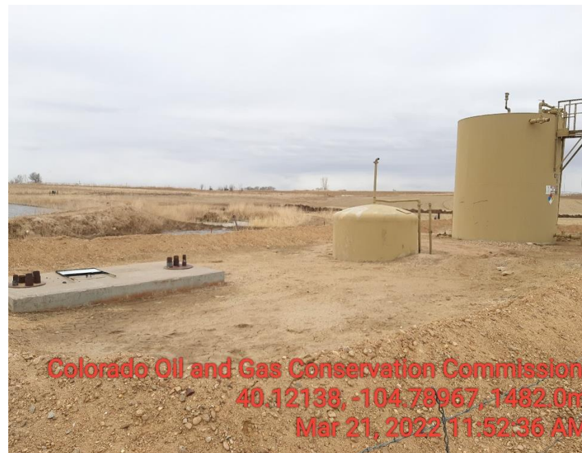
Photo 6 TNK BTRY