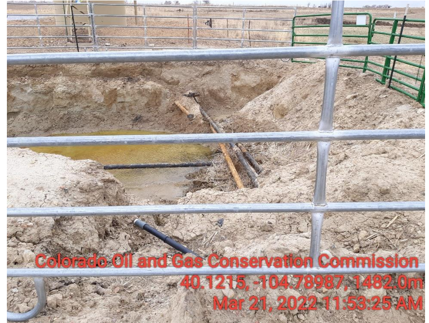
Photo 10 open excavation.