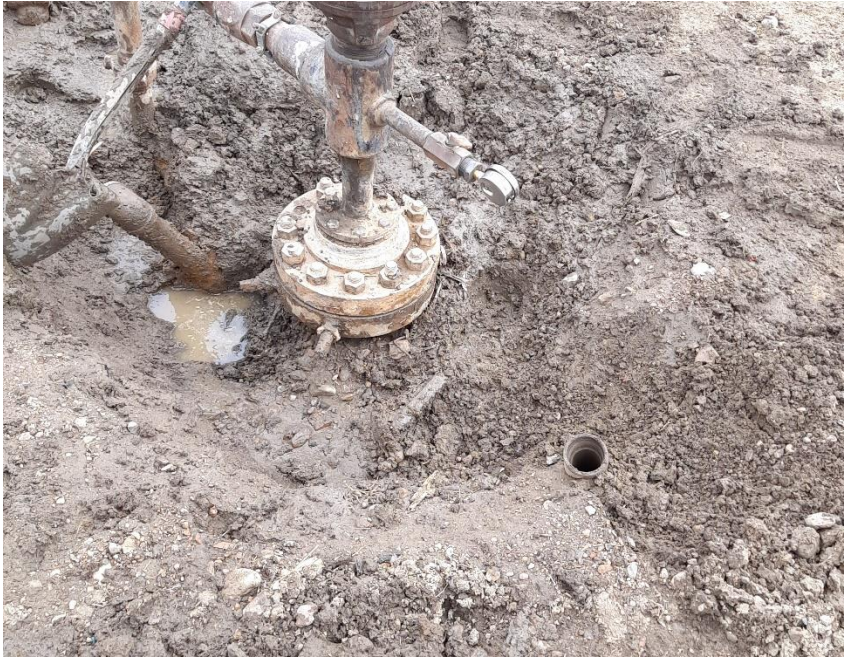
Photo 1 Crew digging up casing and braden head lines to perform test