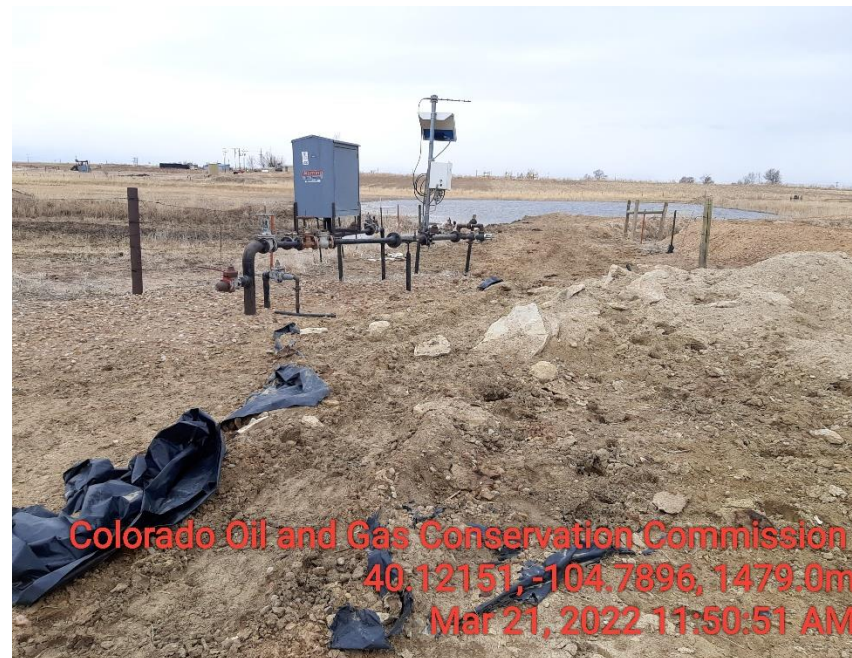
Photo 4 Contaminated material liner is ripped and into pices due to no fence or BMPs