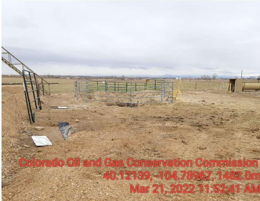
Photo 7 Open excavation