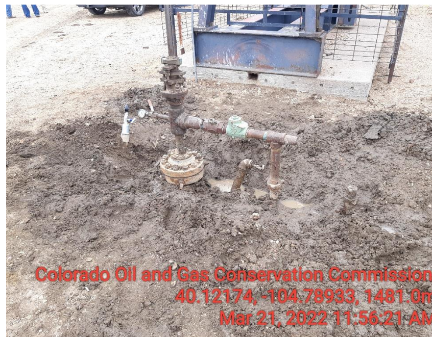
Photo 16 braden head test no gauge on braden head line.