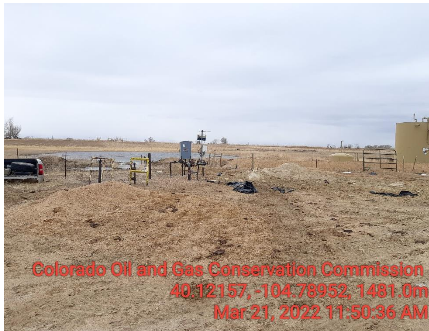
Photo 3 not BMP's or fencing around contaminated material