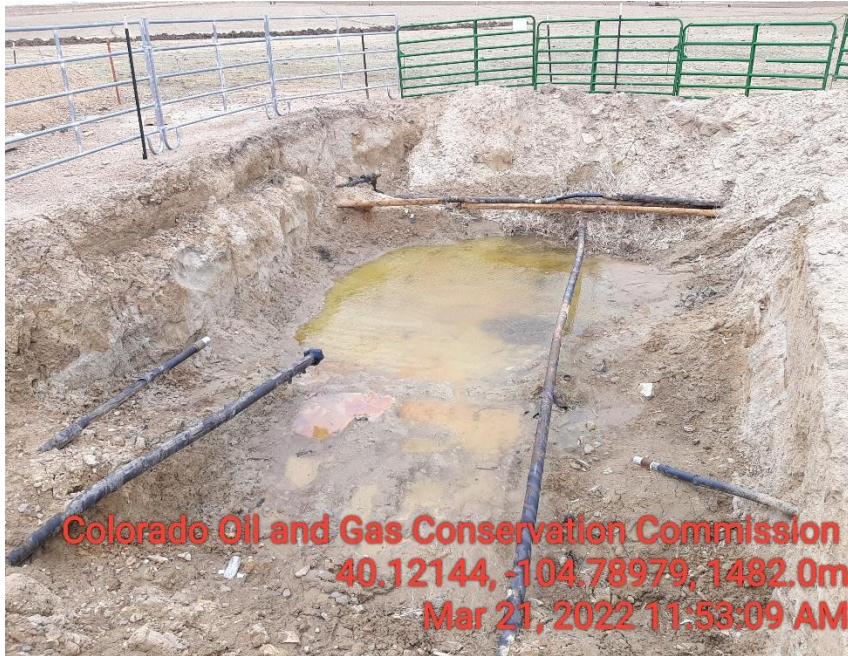
Photo 9 open excavation