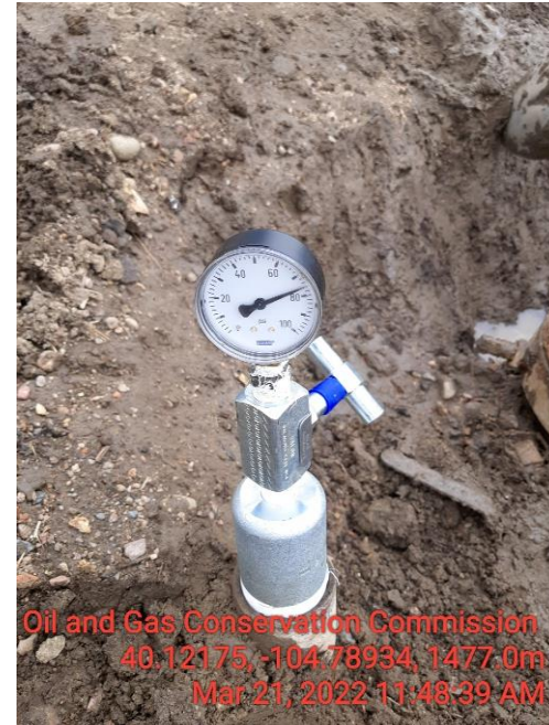
Photo 2 Casing pressure when opened