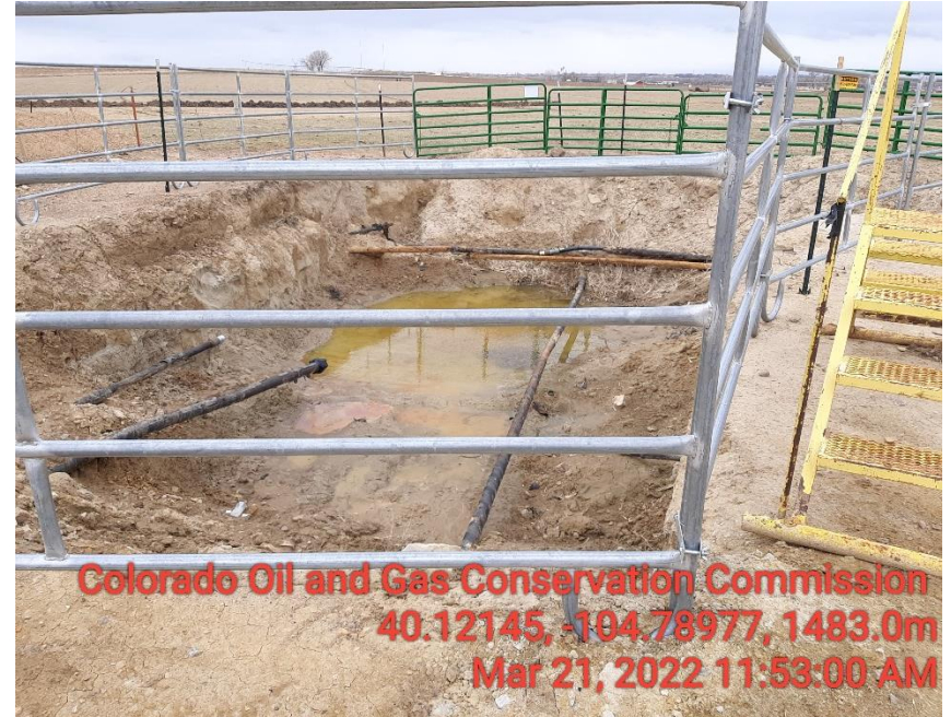
Photo 8 open excavation