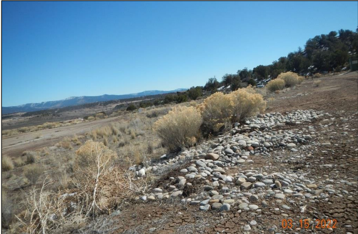
Photo 3. View of the central fill slope with grasses and shrubs such as sand dropseed, Indian ricegrass, and rubber rabbitbrush. Cobble placed to stabilize rilling is not adequate BMP rilling observed in several areas.