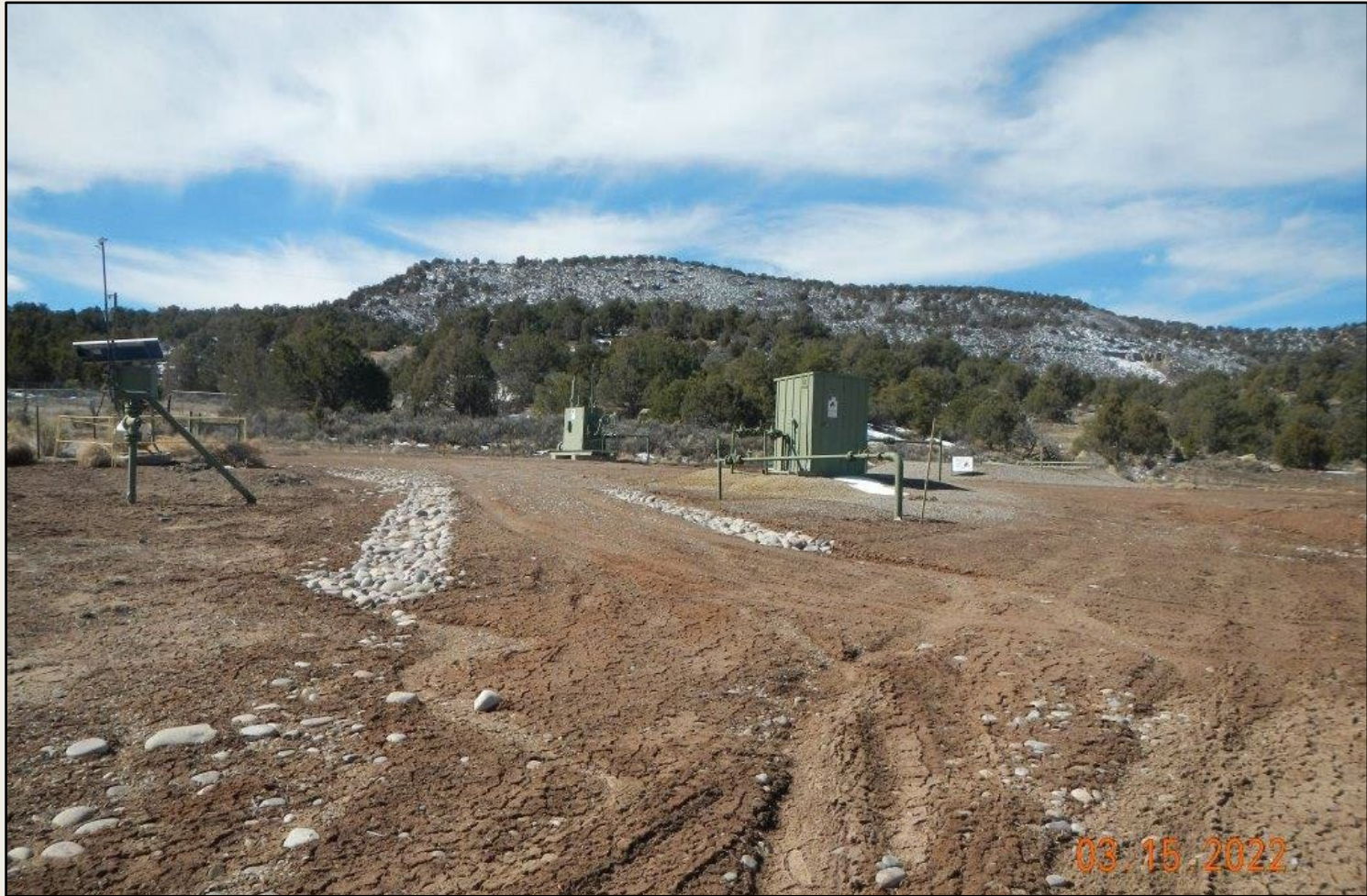
Photo 1. View of the southern project area from the southern entrance facing center.