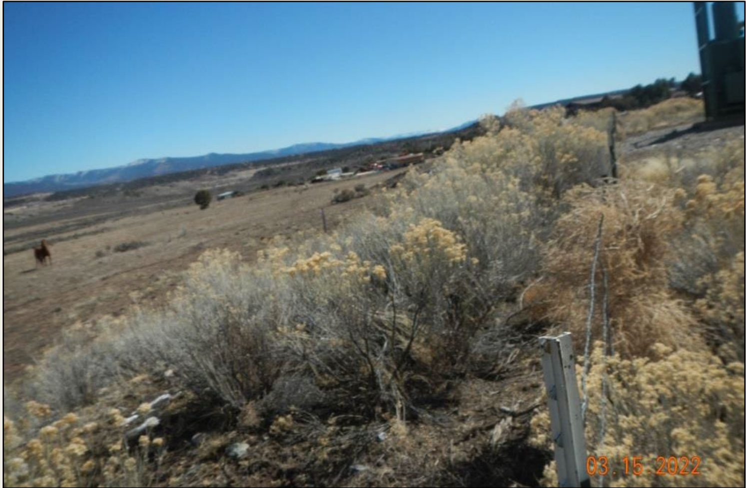
Photo 4. View of the northern project area from the northwestern corner facing eastward. Revegetation is progressing with rubber rabbitbrush, sand dropseed, and sideoats grama.