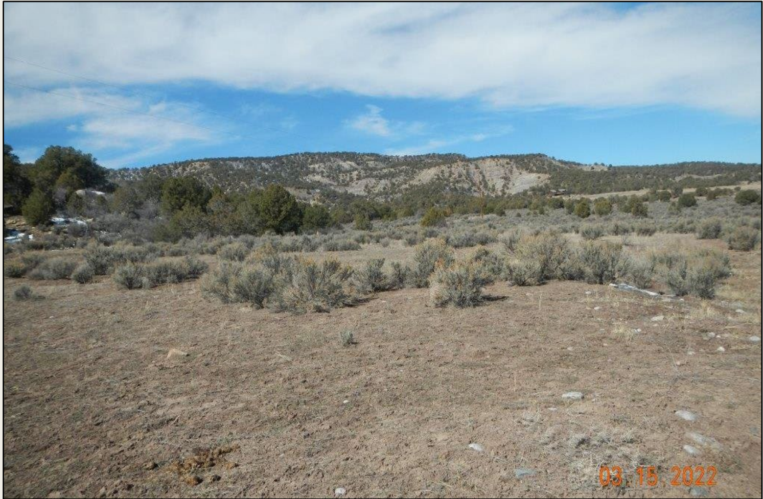
Photo 7. View of reference area comprised of open sagebrush and grassland with western wheatgrass and James galleta observed.