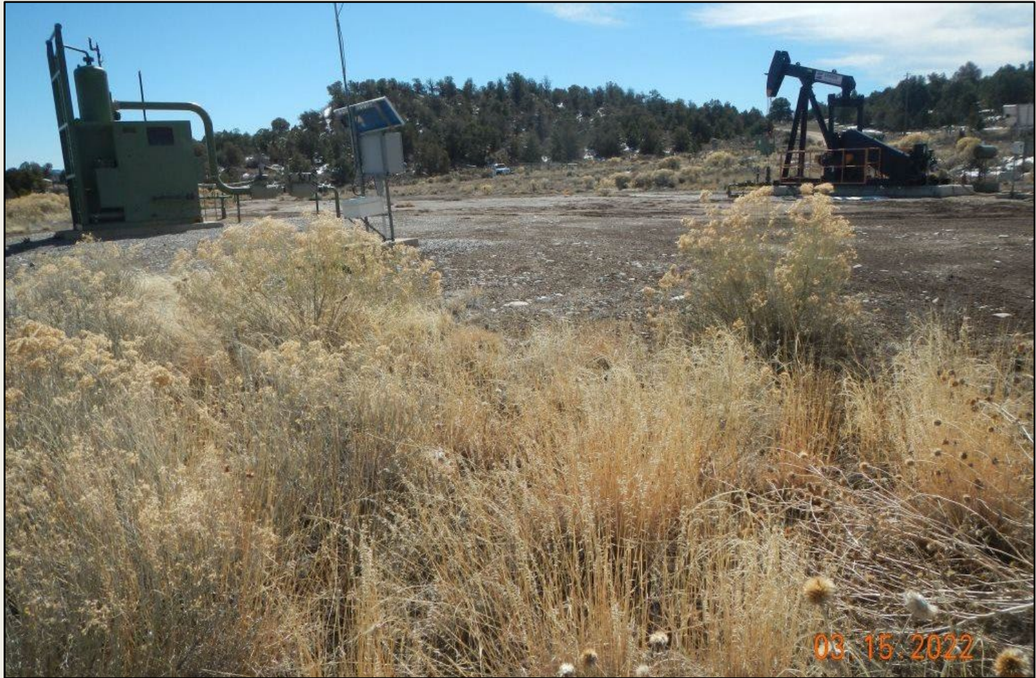
Photo 2. View of the northern project area from the northwestern corner facing center.