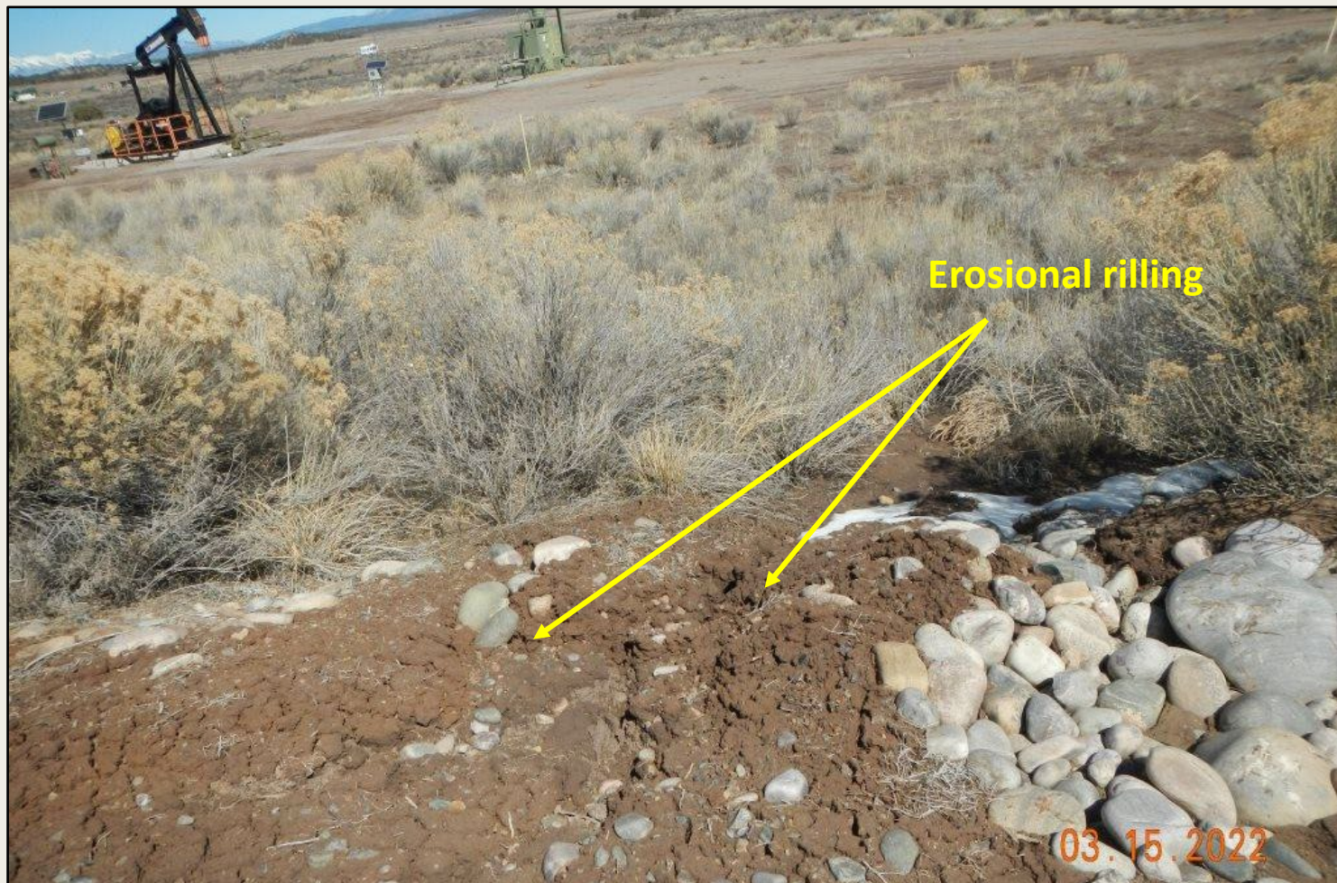
Photo 6. View of more erosional rilling observed in the central/southern fill slope.