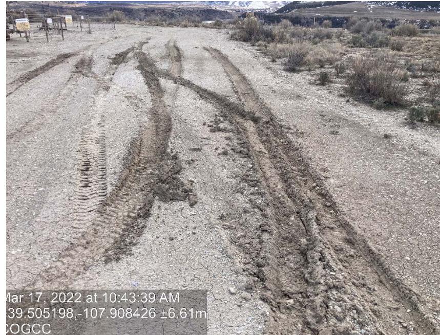
Lack of stabilization/compaction/degrading