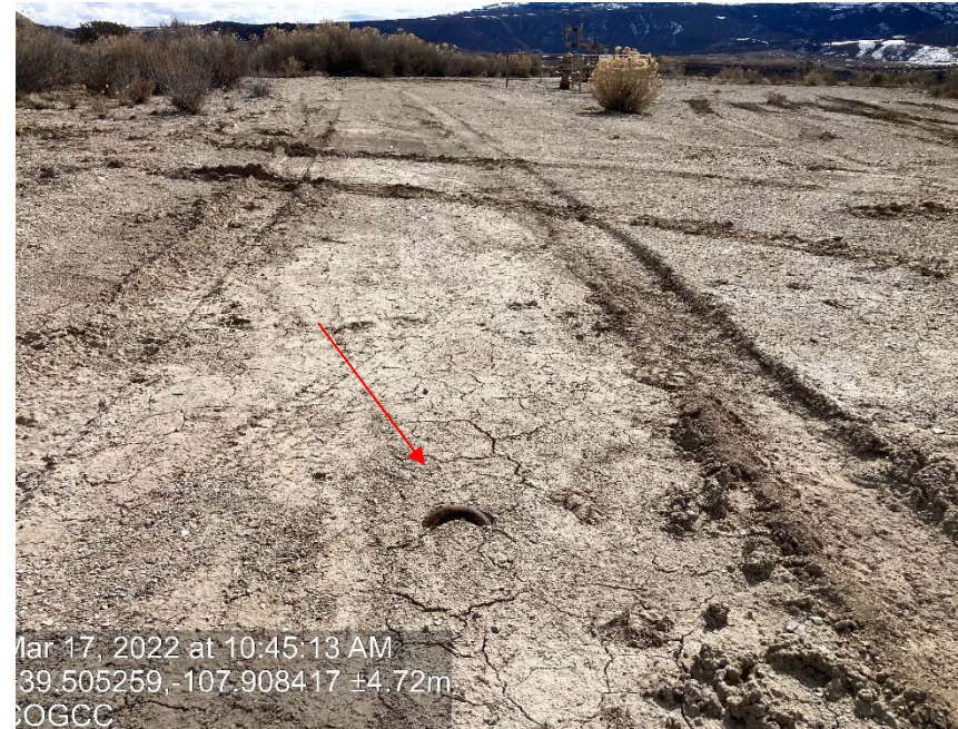
Unmarked dead man