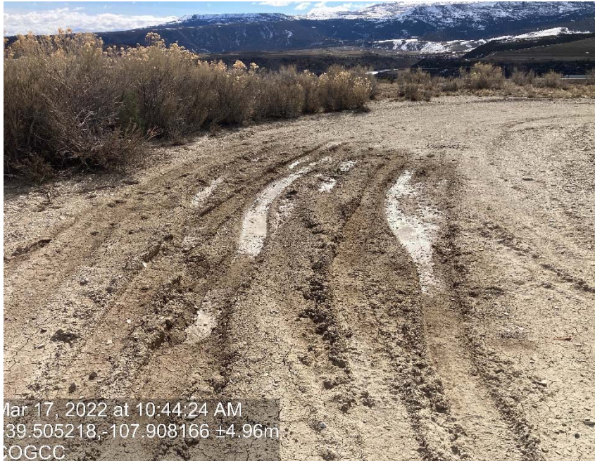
Lack of stabilization/compaction/degrading