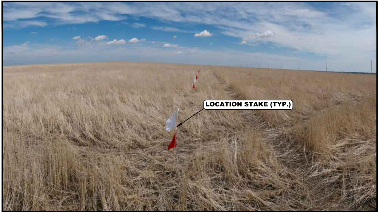
PHOTO: VIEW OF PROPOSED LOCATION