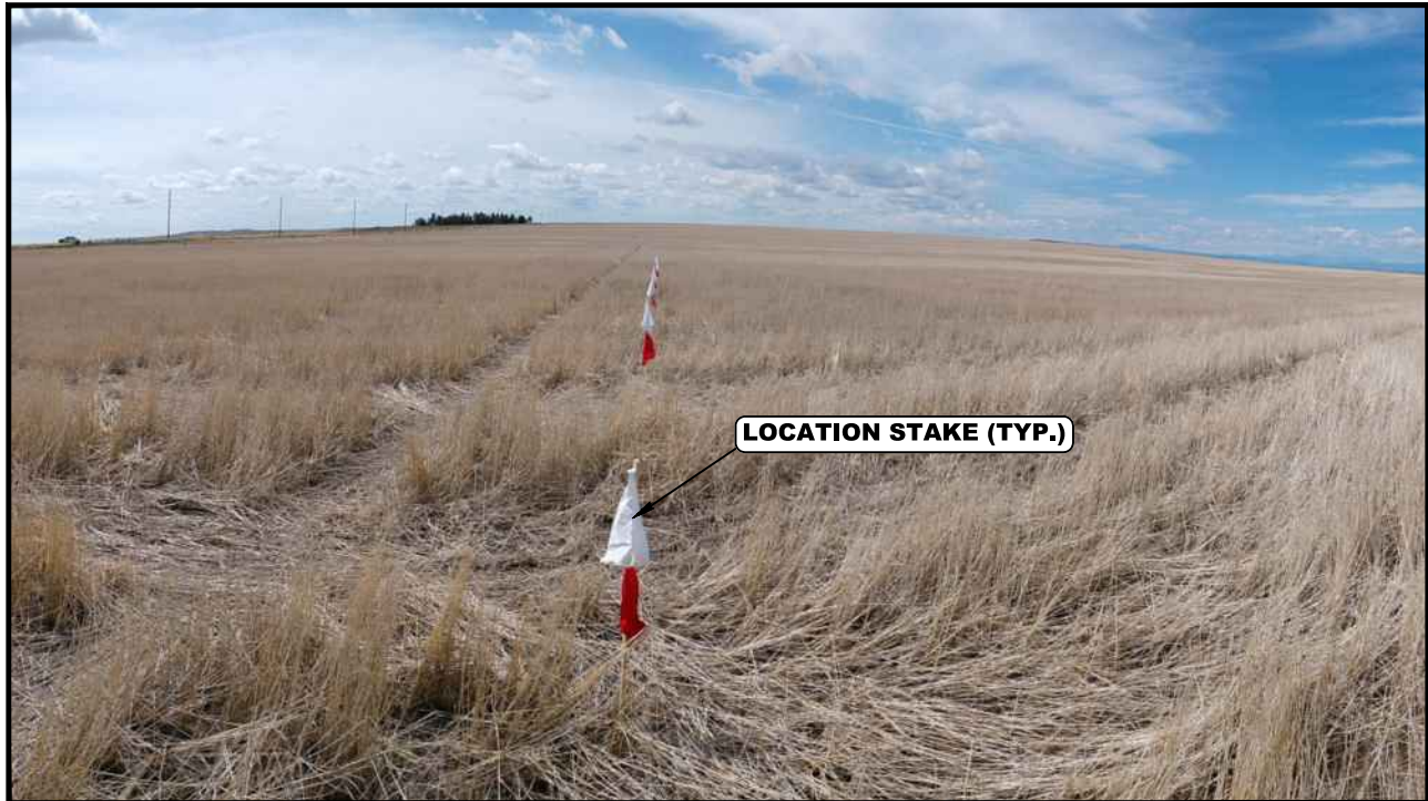
PHOTO: VIEW OF PROPOSED LOCATION