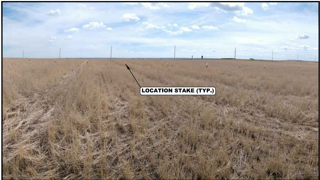
PHOTO: VIEW OF PROPOSED LOCATION