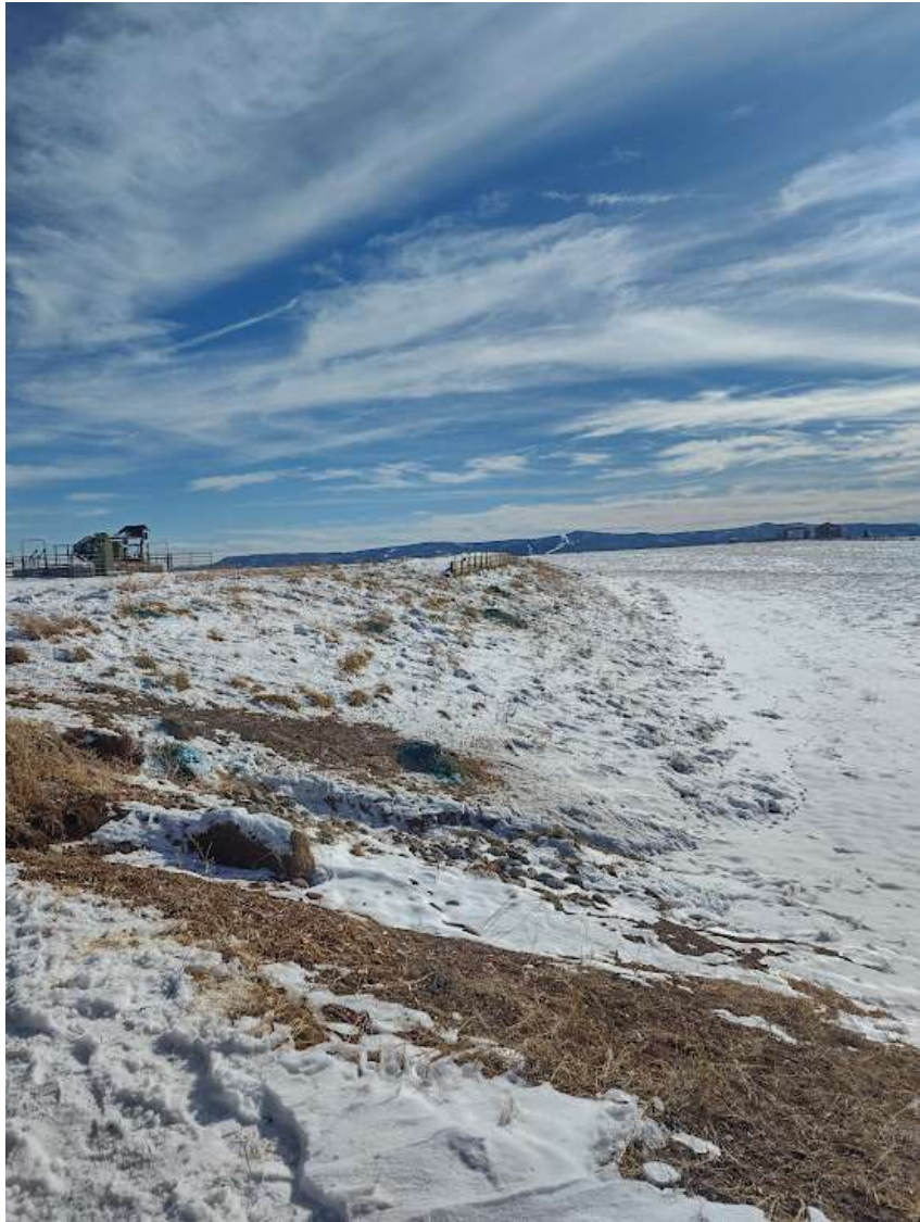
Mechanical Removal of weeds