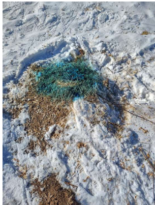
Mechanical Removal of weeds