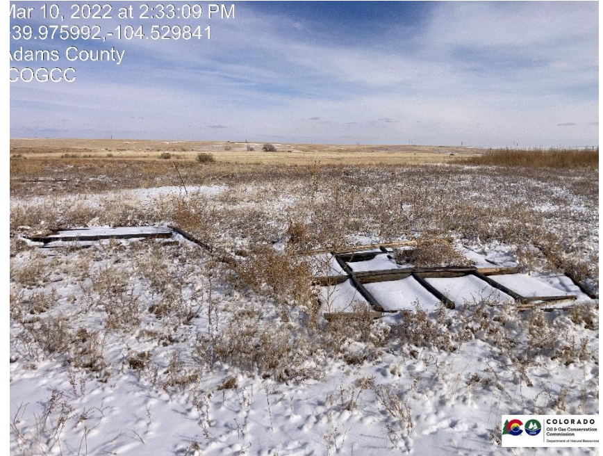
Pic 2 trash on location

Mar 10, 2022 at 2:33:09 PM 39.975992,-104.529841 Adams County COGCC