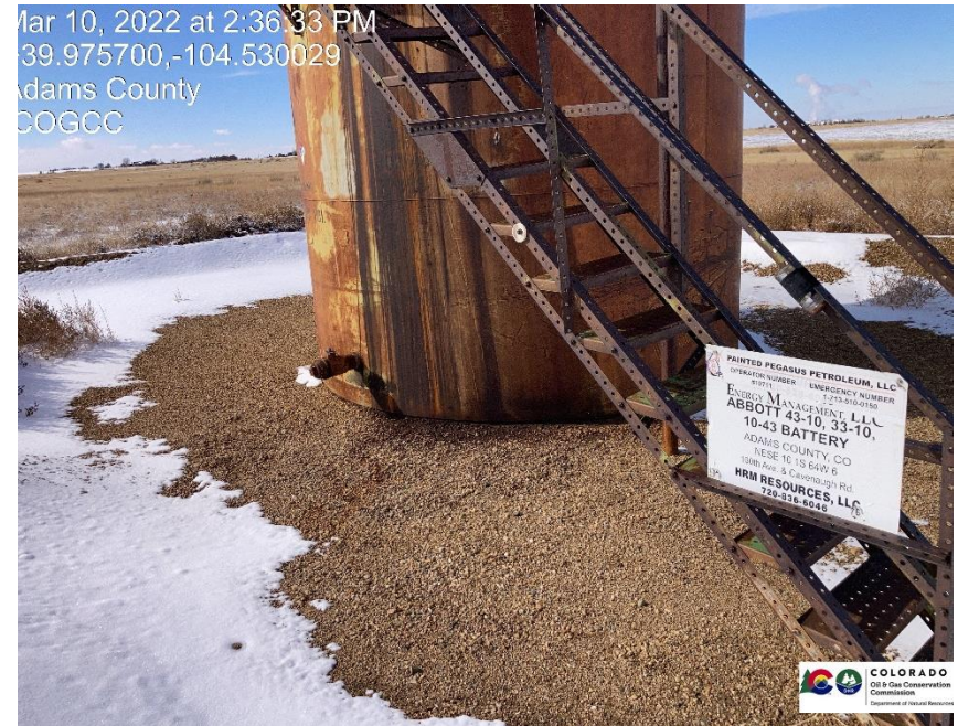
Pic 8 tank had a spill in past, this spill was never cleaned up from previous inspections. Tank appears to have production fluid stored inside.