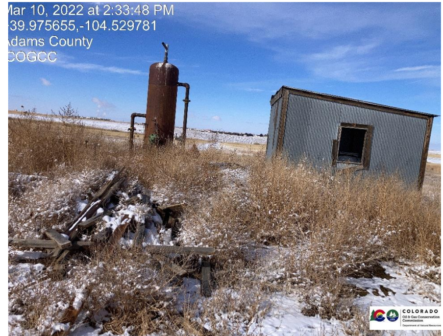
Pic 4 storage shed, and Separator, trash on location.