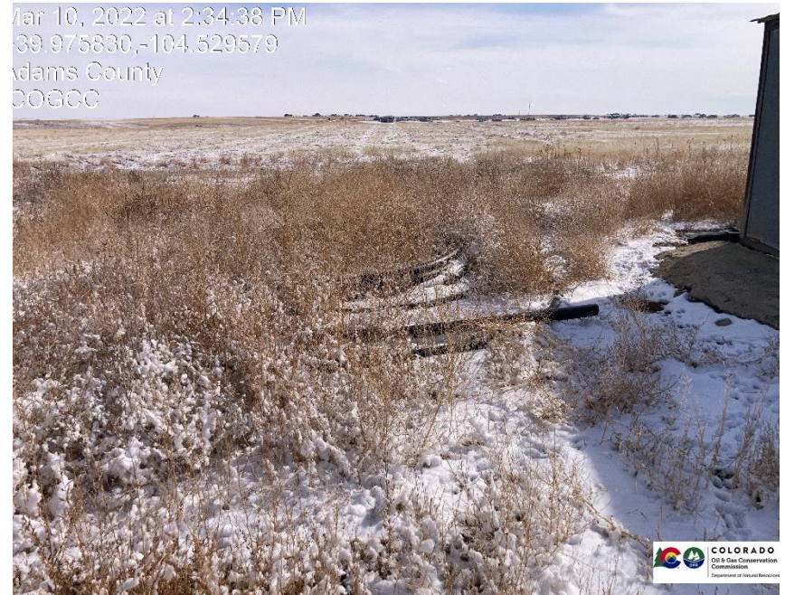
Pic 6 poly tubing on ground

Mar 10, 2022 at 2:34:38 PM 39.975830,-104.529579 Adams County COGCC