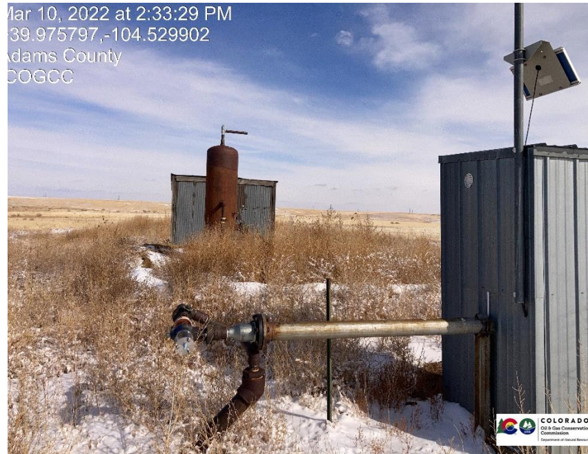
Pic 3 gas meter run, separator, storage shed