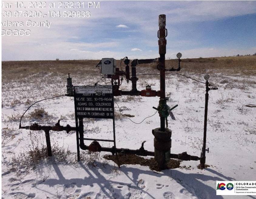
Pic 1 wellhead, at time of inspection all valves were in the close position. Bradenhead in close position. Small gas leak on packing on wellhead. Unable to tighten hammer union on wellhead.

Mar 10, 2022 at 2:32:31 PM 39.976200,-104.529833 Adams County COGCC