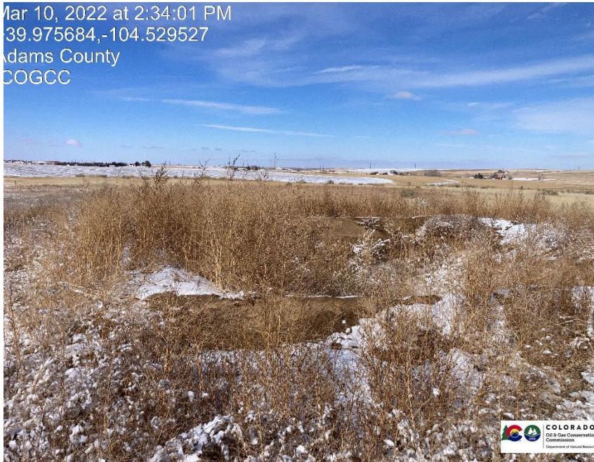
Pic 5 pit

Mar 10, 2022 at 2:34:01 PM 39.975684,-104.529527 Adams County COGCC