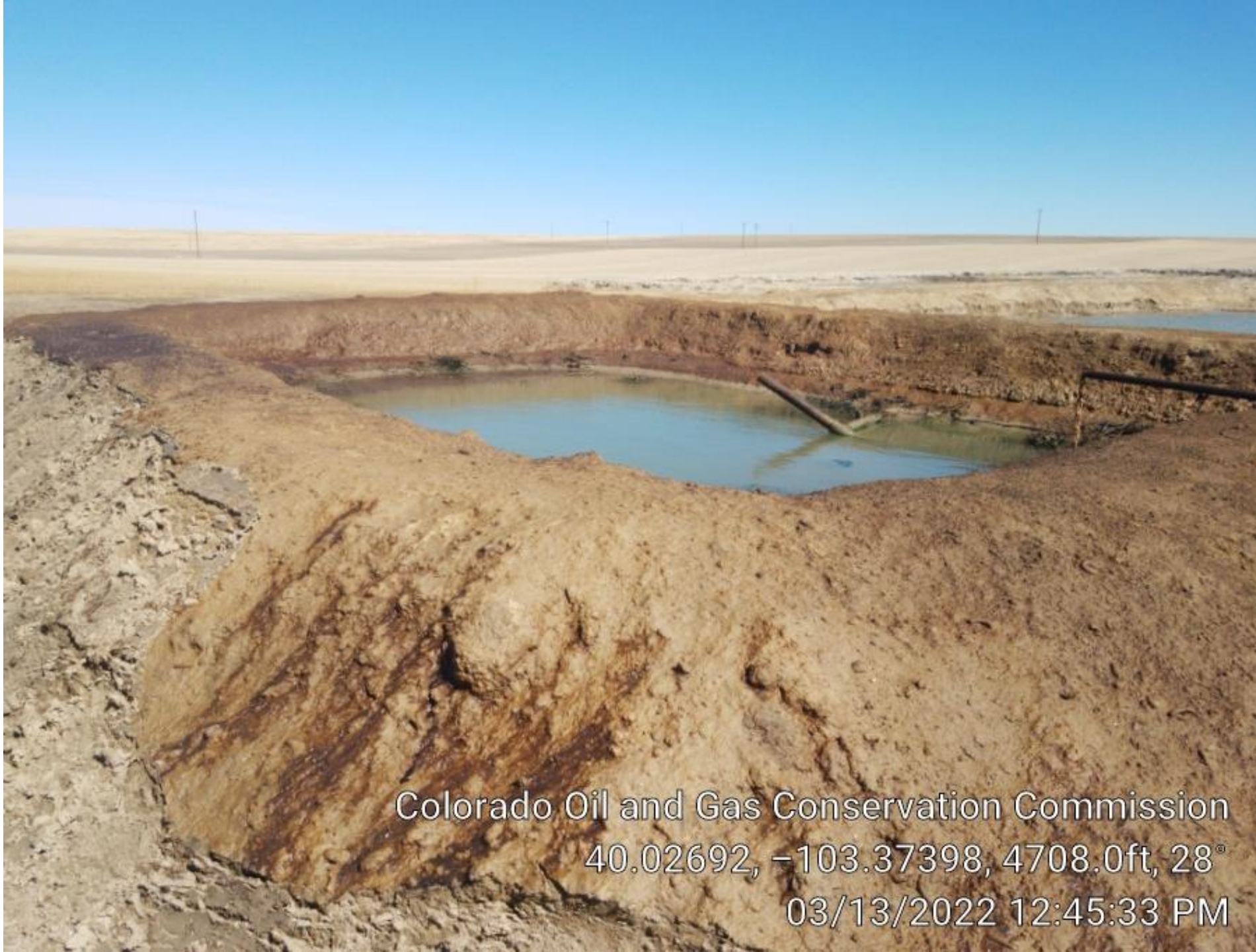
First produced water pit.

Colorado Oil and Gas Conservation Commission 40.02692, -103.37398, 4708.0ft, 28° 03/13/2022 12:45:33 PM