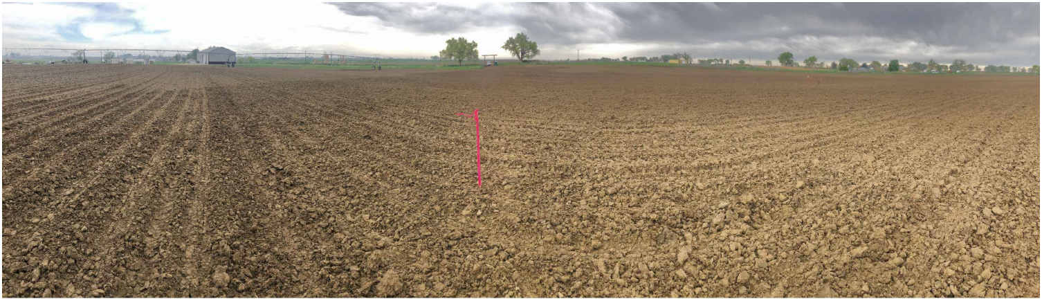
SOUTH VIEW (PANORAMIC)