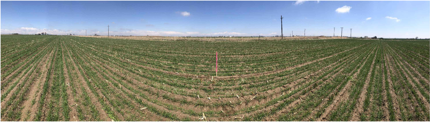
SOUTH VIEW (PANORAMIC)