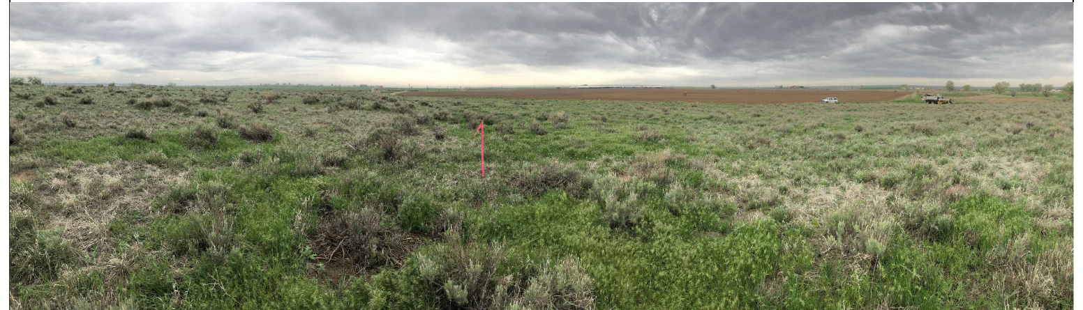
SOUTH VIEW (PANORAMIC)