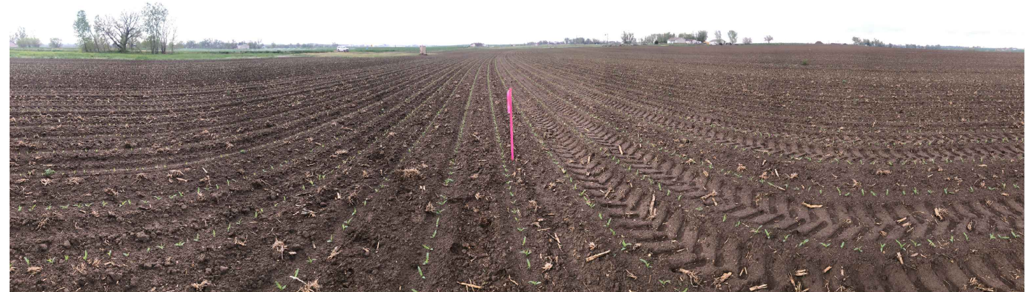
SOUTH VIEW (PANORAMIC)