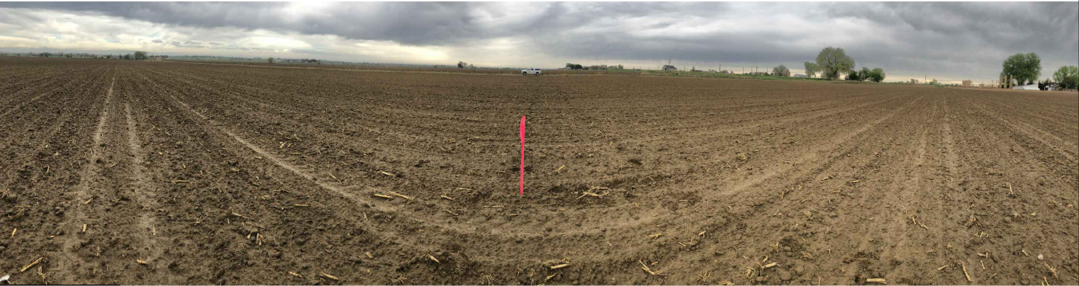
SOUTH VIEW (PANORAMIC)