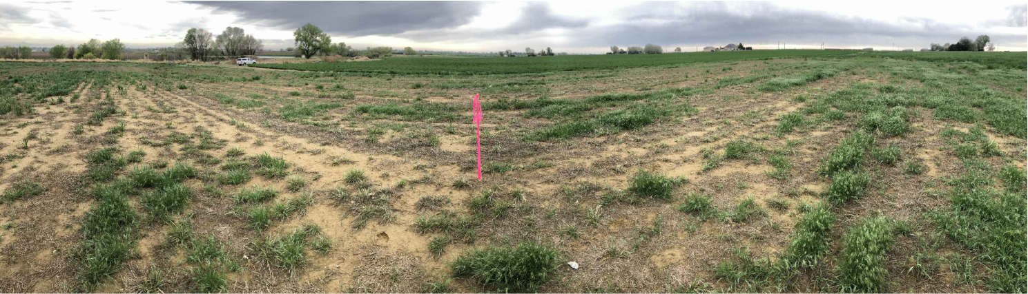
SOUTH VIEW (PANORAMIC)