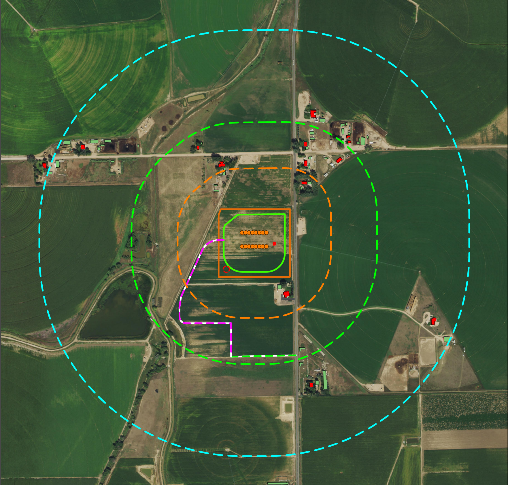
CULTURAL TABLE: (NUMBER OF FEATURES FOUND WITHIN EACH RADIUS AS MEASURED FROM THE WORKING PAD SURFACE)