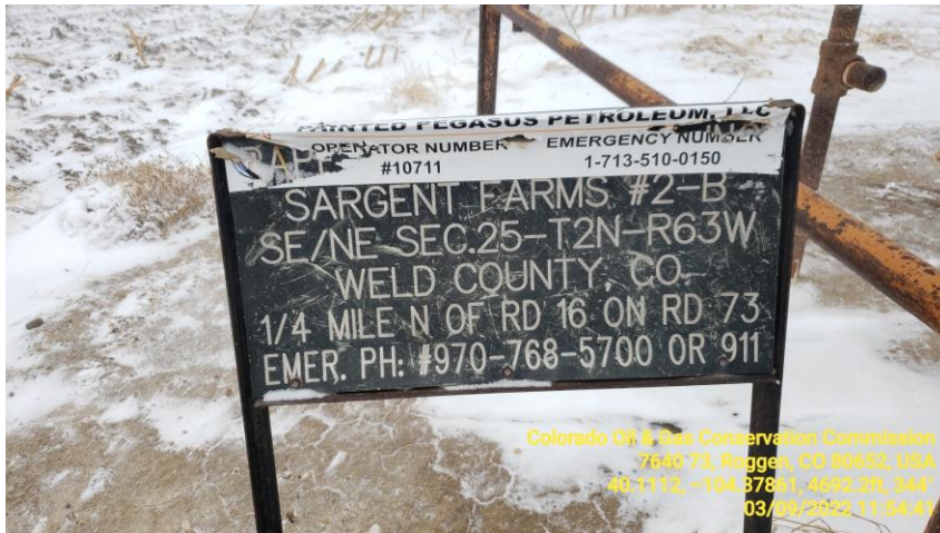
Photo 1 WH sign