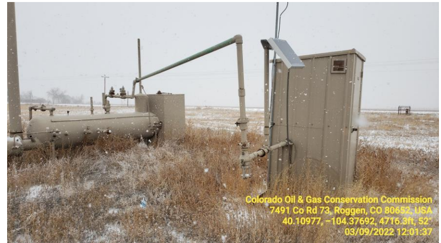
Photo 6 Horiz. Heated Sep. and Gas Meter Run