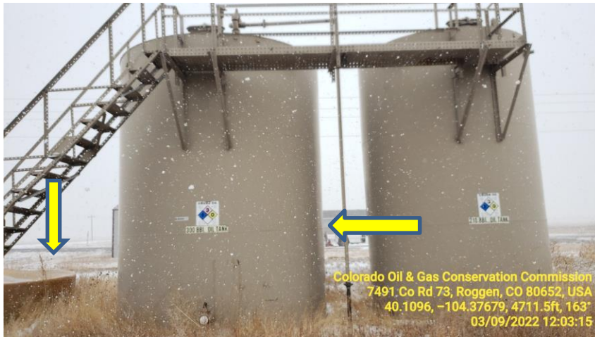
Photo 5 TB tank on the left (east tank) has about 5 ft. of fluid in it, and PW tank is about \frac{3}{4} full.