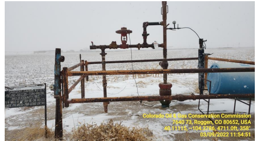
Photo 2 WH