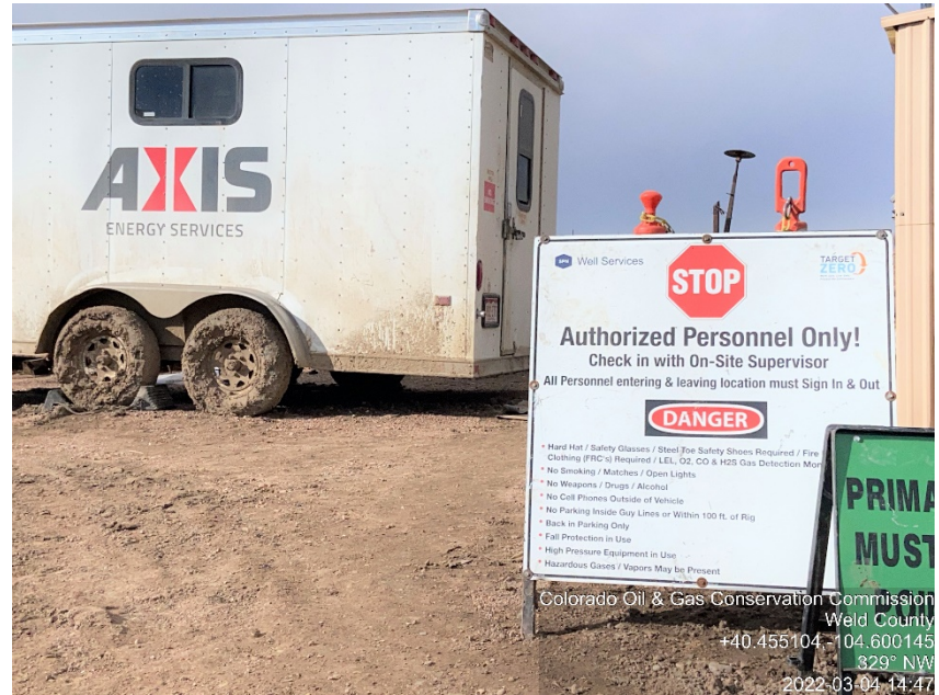
Colorado Oil & Gas Conservation Commission Weld County +40.455104 -104.600145 329° NW 2022-03-04 14:47