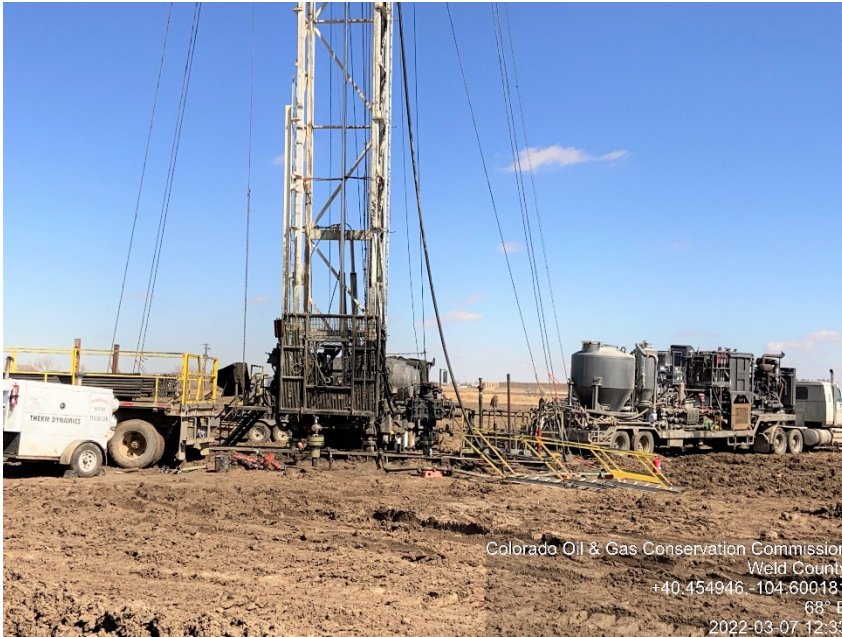
Colorado Oil & Gas Conservation Commission Weld County +40.454946 -104.600181 68° E 2022-03-07 12:33